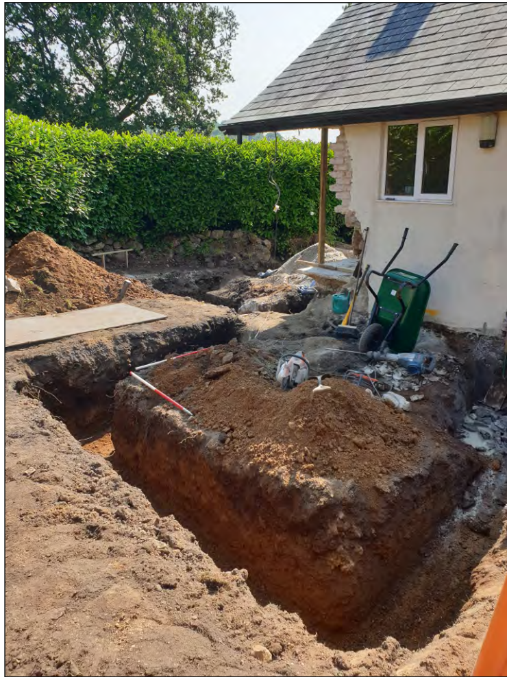
Pl. 1 General view of the foundations. 1m scales. Looking northeast.