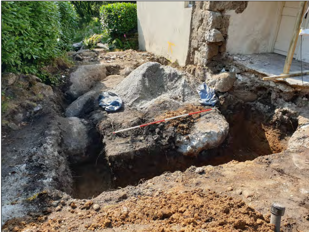
Pl. 2 General view of the foundations. 2m scale. Looking east.