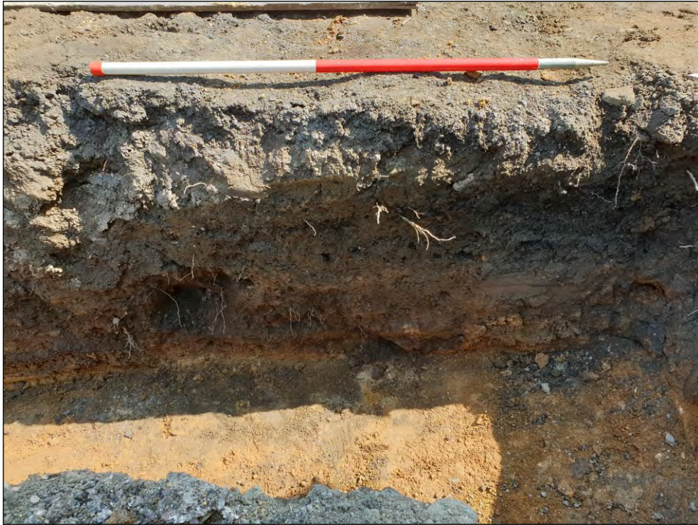
Pl. 3 Section showing deposit sequence. 1m scale. Looking northeast.