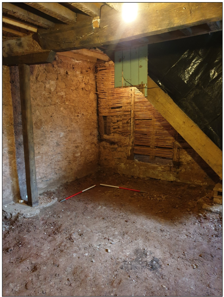
Pl. 2 General view of former kitchen showing reduced levels. 1m scales. Looking northeast.