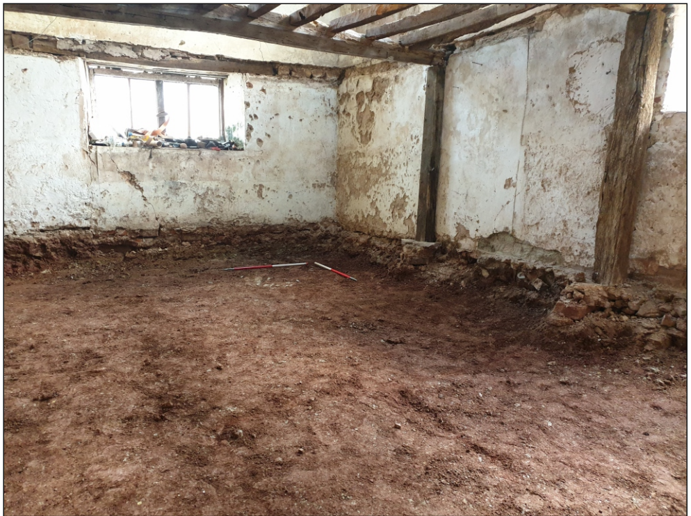
Pl. 1 General view of north wing showing reduced levels. 1m scales. Looking northeast.