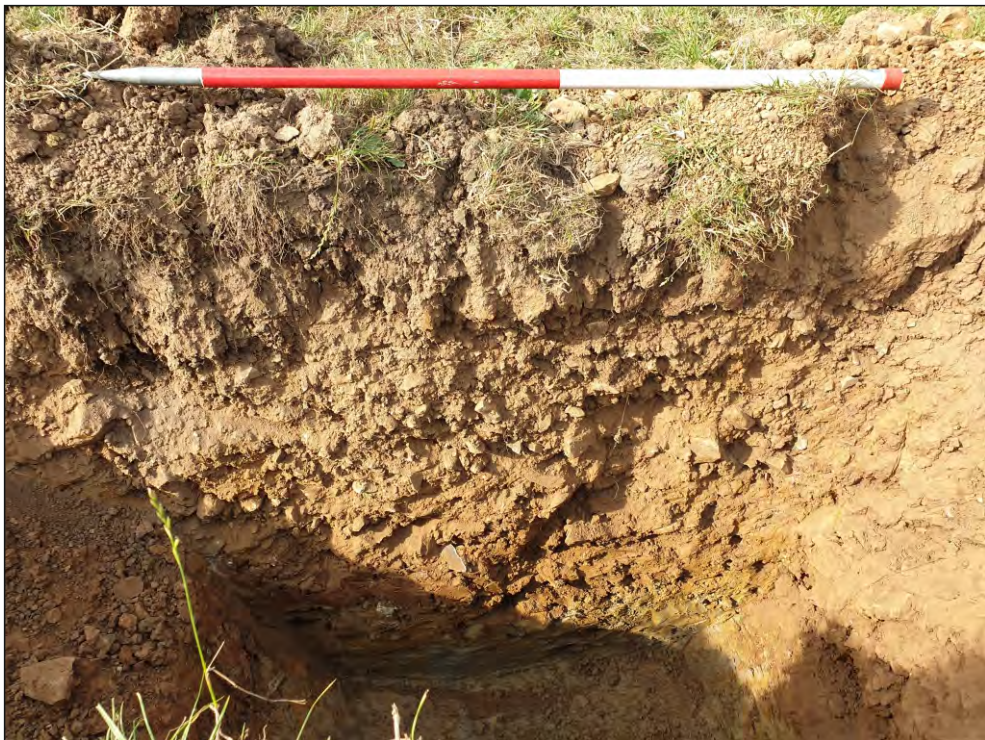
Pl. 2 Sample section within foundation pits showing deposit sequence. 1m scale. Looking southwest.