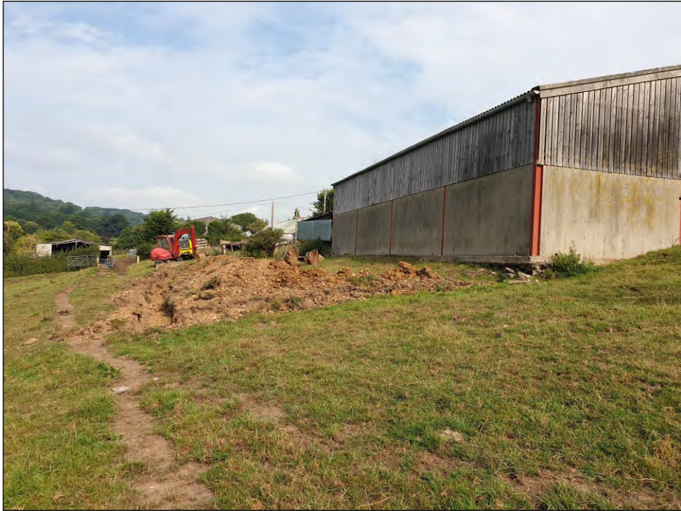
Pl. 1 General view of the foundation trench. Looking northwest.