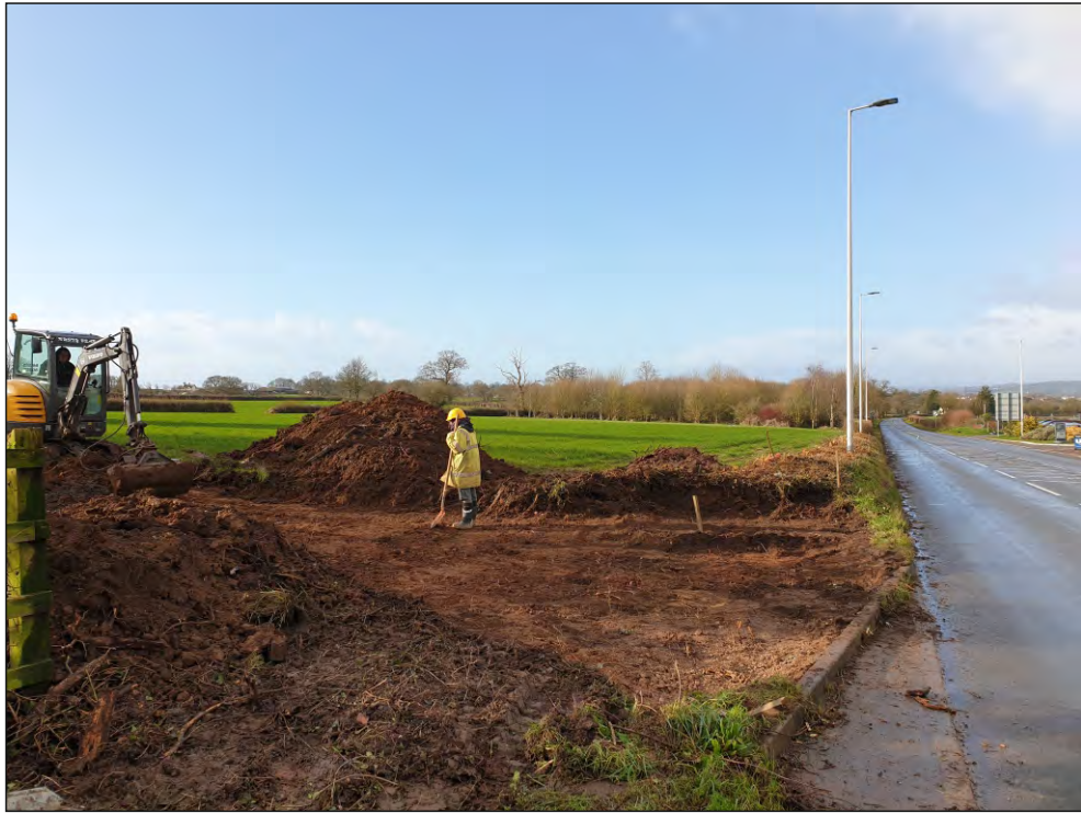
Pl. 1 General view of road splay excavations showing depth of topsoil (100) and modern disturbance. Looking southwest.