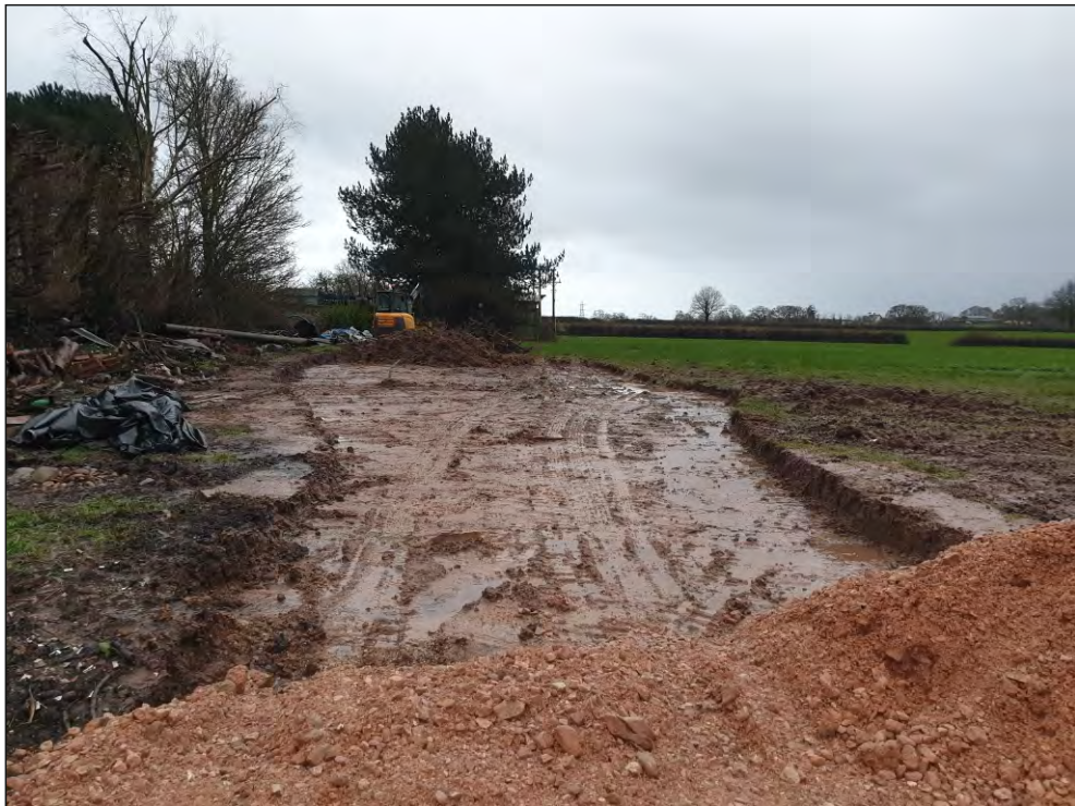
Pl. 2 General view of main area showing depth of topsoil (100). Looking south.