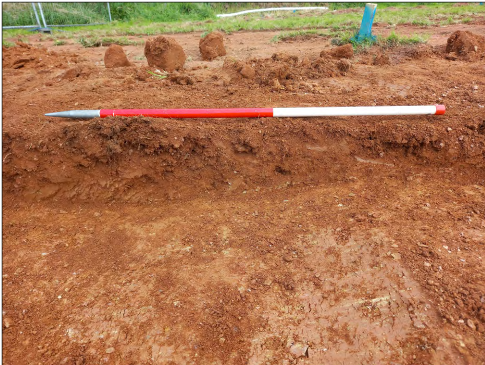
Pl. 4 Section through the house platform showing a simple deposit sequence of topsoil (100) above shillet natural subsoil (101). 1m scale. Looking north.