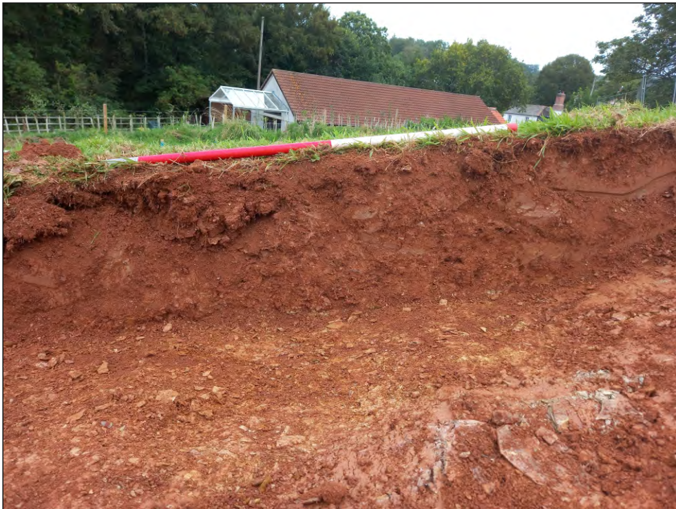
Pl. 2 Section through the access road showing a simple deposit sequence of topsoil (100) above shillet natural subsoil (101). 1m scale. Looking north.