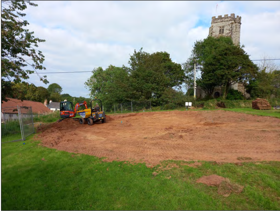
Pl. 1 General view of the access road soil strip with St Martin's Church in the background. Looking east.