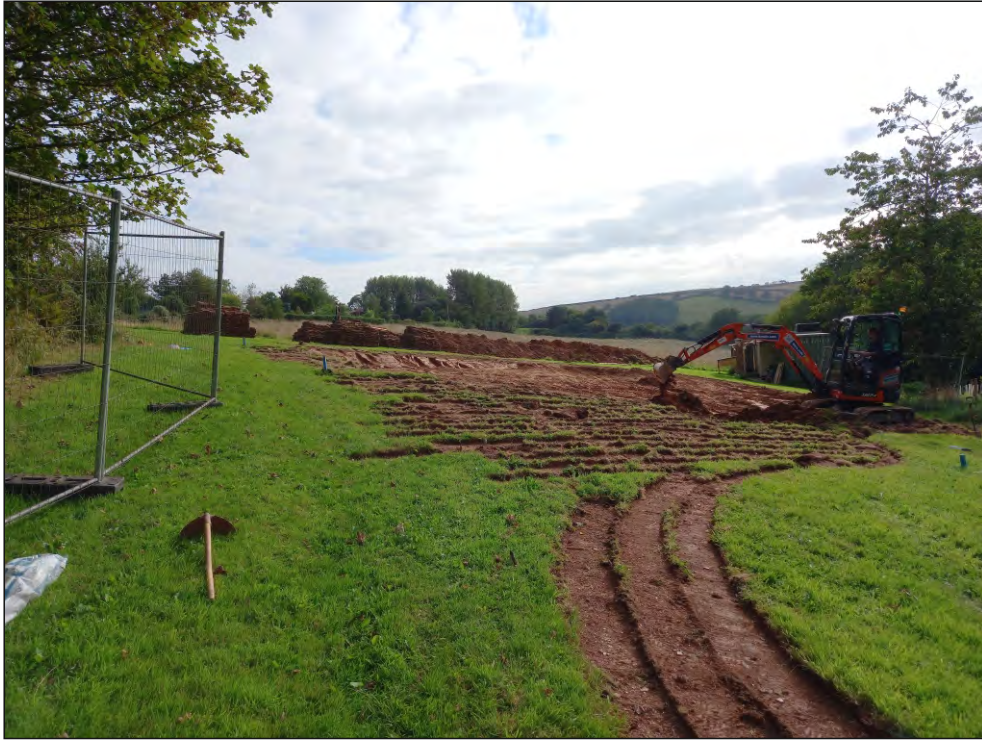
Pl. 3 General view of the house platform soil strip with Sherford Down in the background. Looking south.