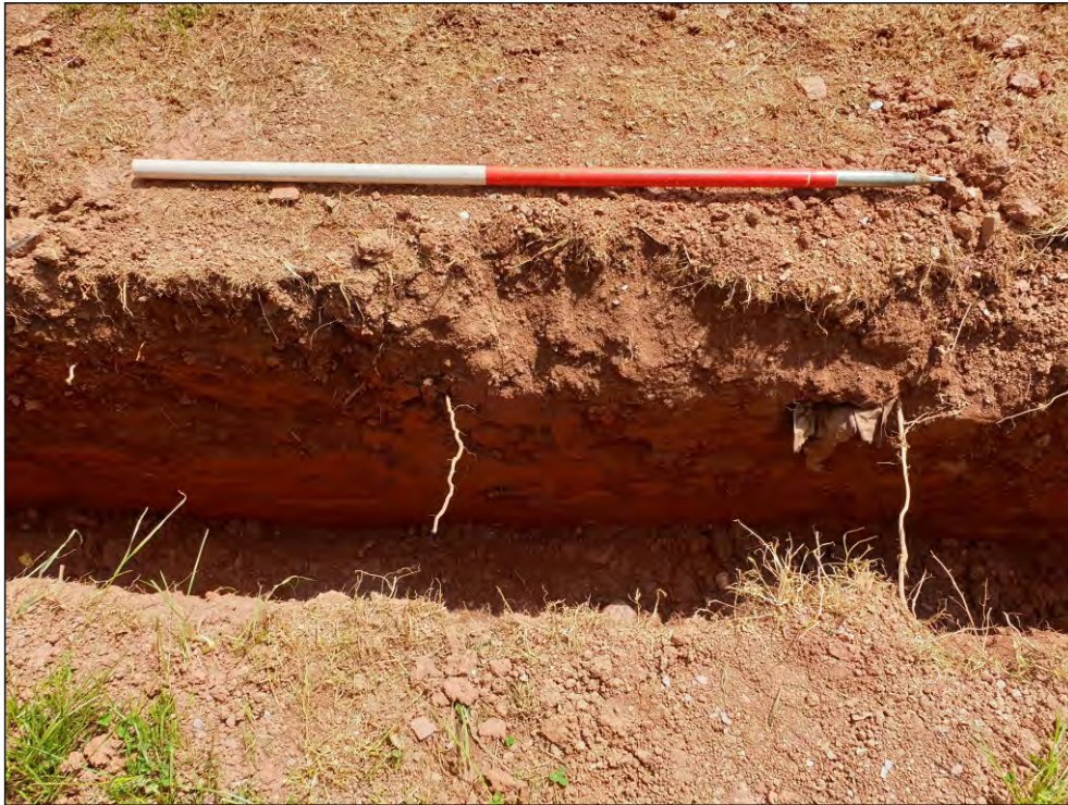
Pl. 3 Section through service trench showing depth of topsoil (100) above natural subsoil (101). 1m scale. Looking southeast.