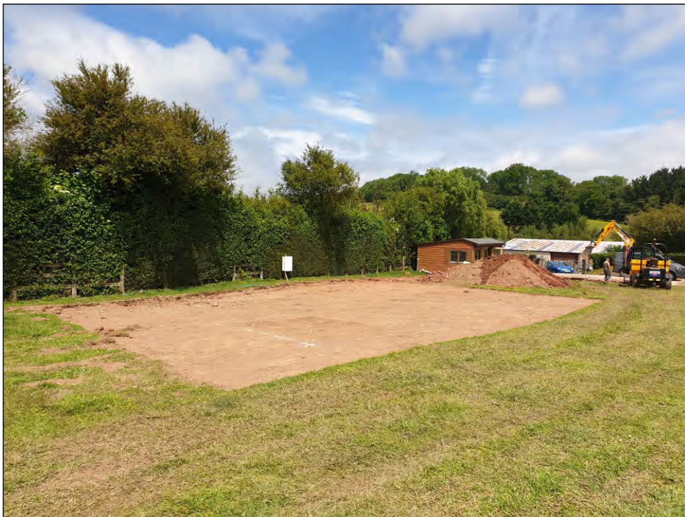
Pl. 2 General view of area strip. Looking northwest.