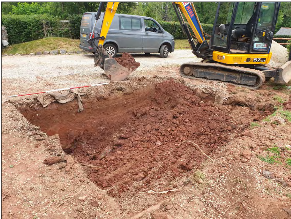
Pl. 4 General view of soakaway showing depth of topsoil (100) above natural subsoil (101). 2m scale. Looking northeast.