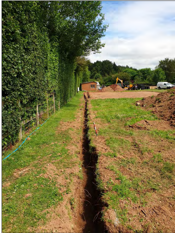
Pl. 1 General view of service trench with area strip in background. 2m scale. Looking northeast.