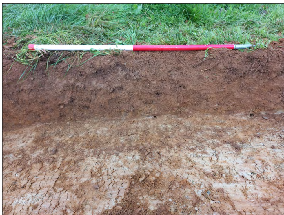
Pl. 3 Sample section Trench 1. 1m scale. Looking southwest.