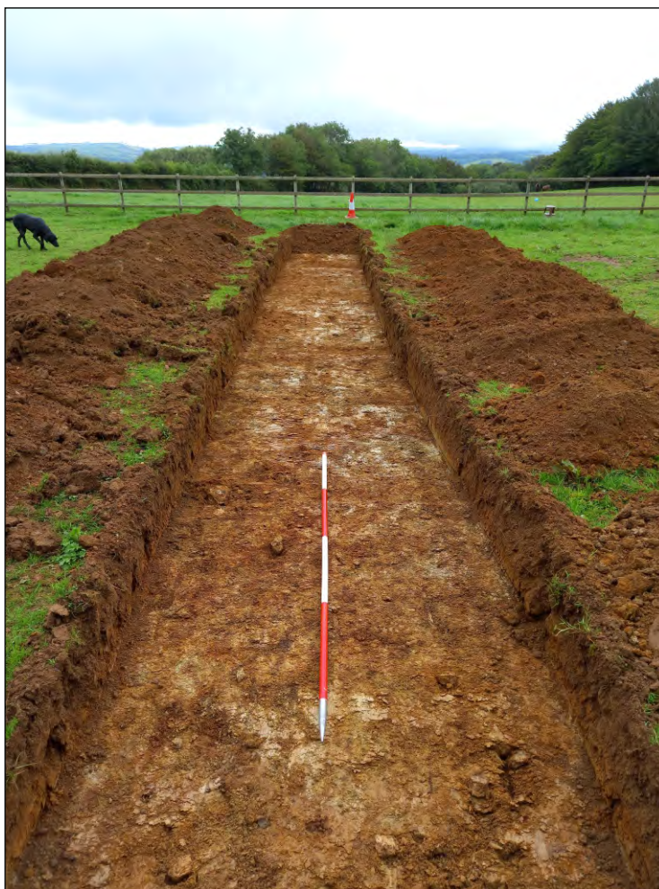
Pl. 2 General view of Trench 1. 2m scale. Looking southeast.