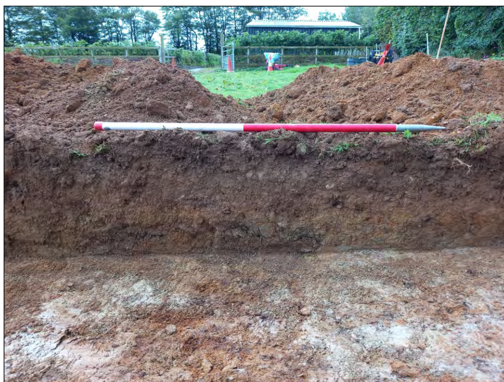
Pl. 5 Sample section Trench 2. 1m scale. Looking south.