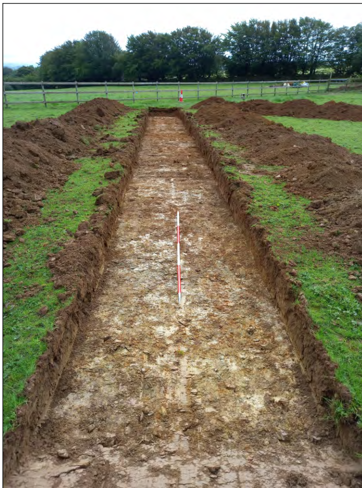
Pl. 4 General view of Trench 2. 2m scale. Looking east.