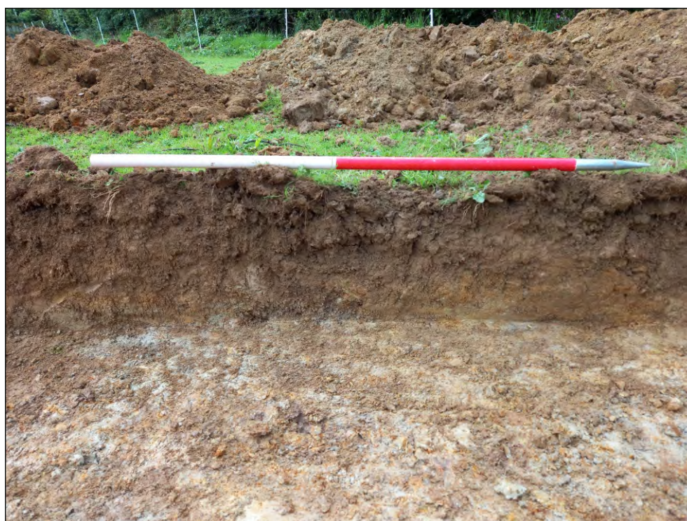
Pl. 7 Sample section Trench 3. 1m scale. Looking southeast.