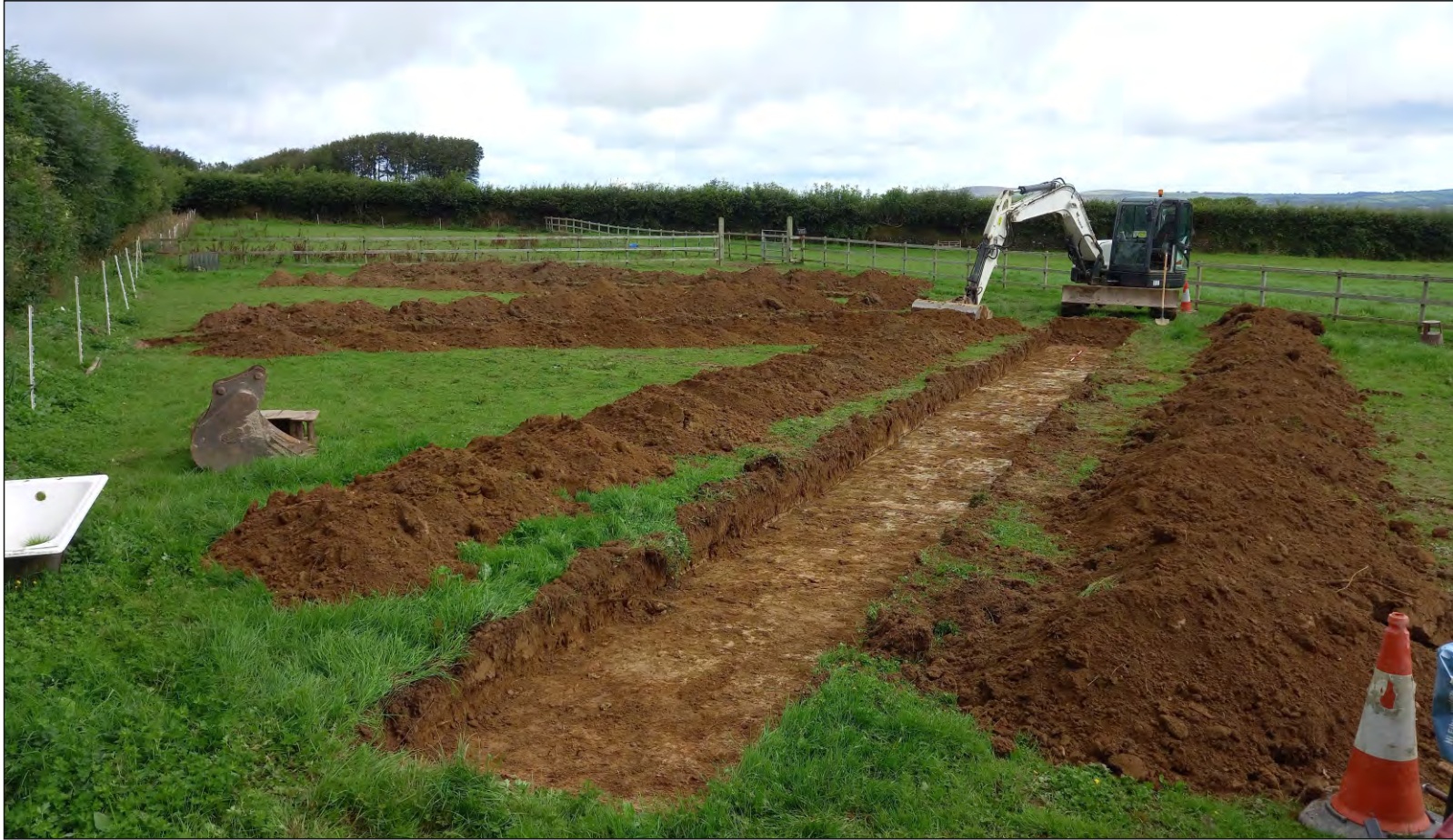
Pl. 1 General view of site showing Trenches 1-3. Looking northeast.