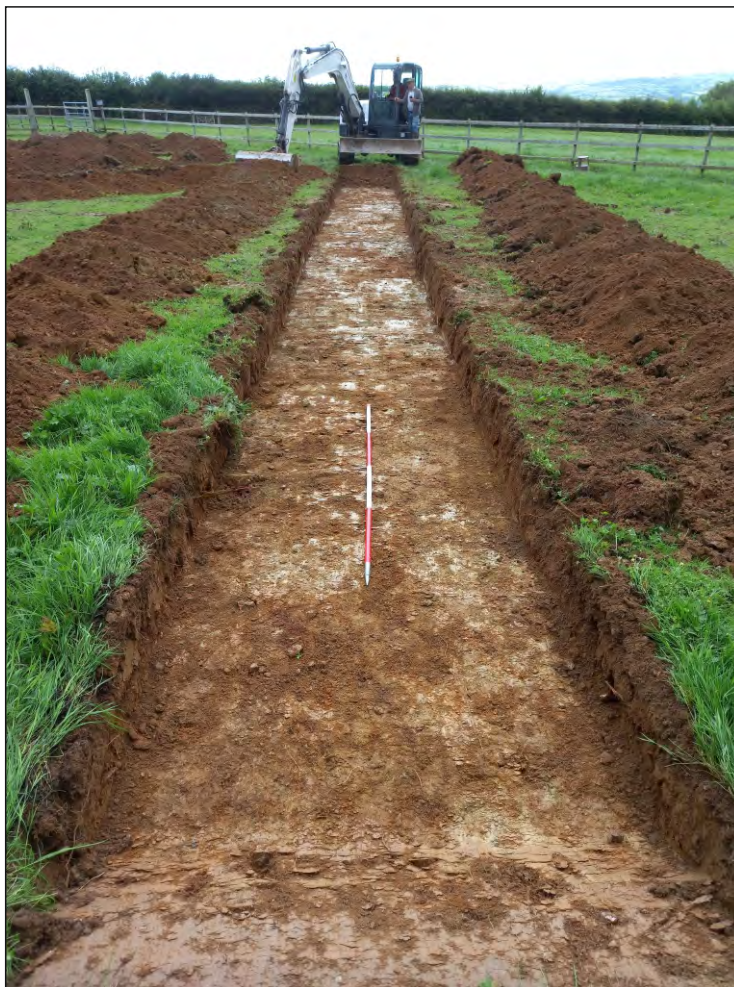
Pl. 6 General view of Trench 3. 2m scale. Looking northeast.