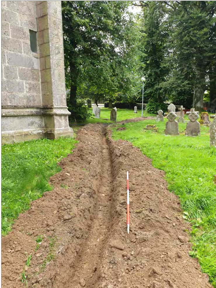
Pl. 3 General view of trench. 2m scale. Looking southwest.