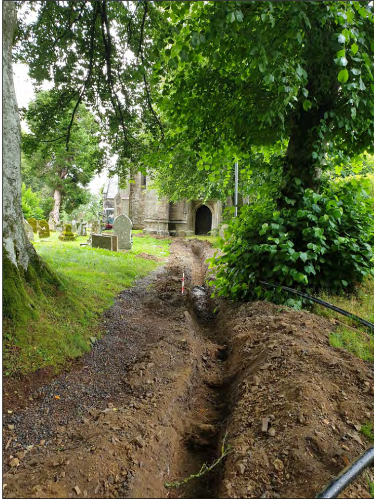
Pl. 1 General view of trench. 2m scale. Looking east.