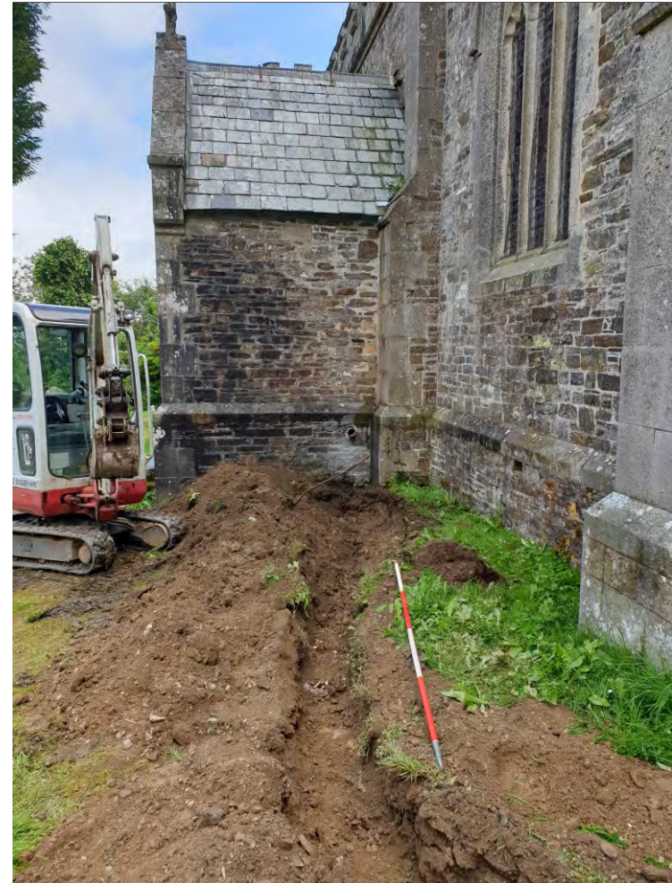
Pl. 4 General view of trench. 2m scale. Looking east.