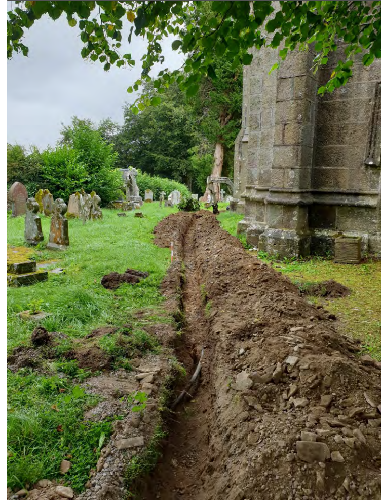
Pl. 2 General view of trench. 2m scale. Looking northeast.