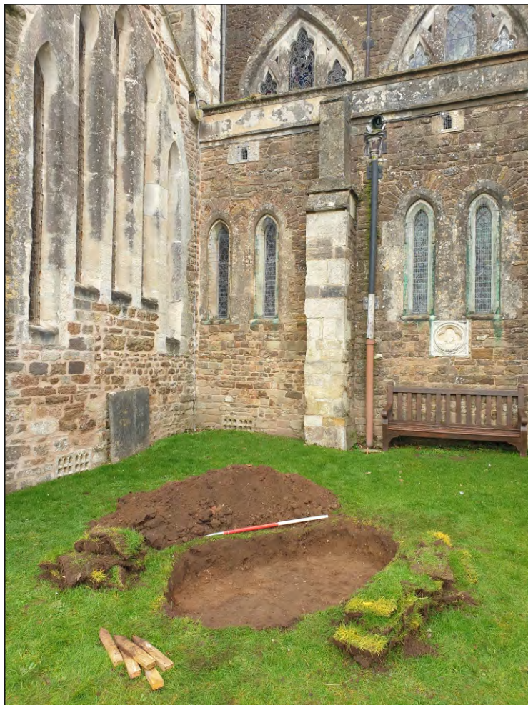
Fig. 2 Plan and photograph of the statue base.