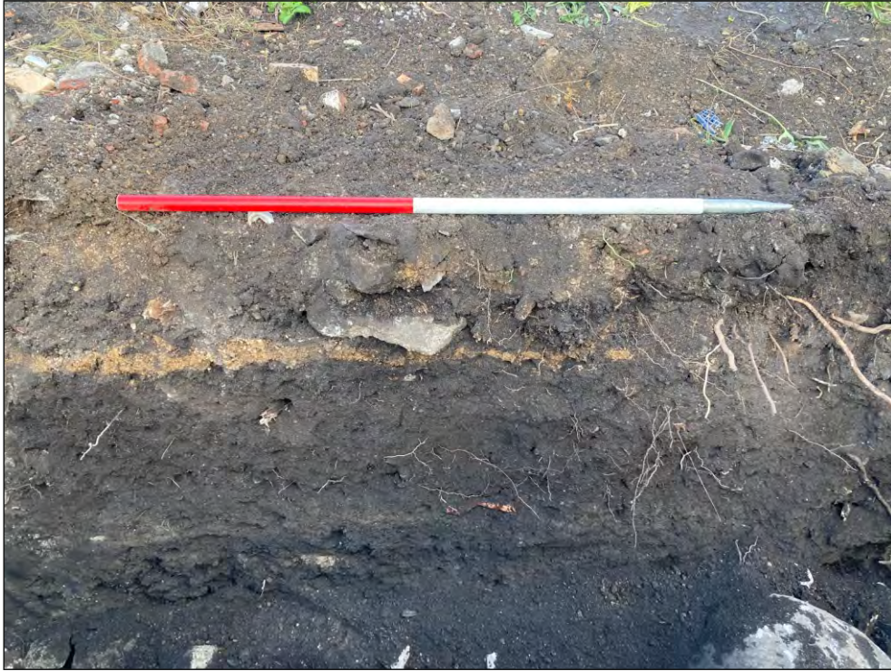
Pl. 3 Section through service trench showing depth of deposit sequence above growan natural subsoil. 1m scale. Looking north.