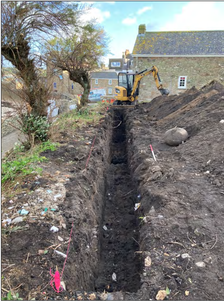
Pl. 1 General view of the service trench showing depth of deposits above growan natural subsoil. 1m scale. Looking east.