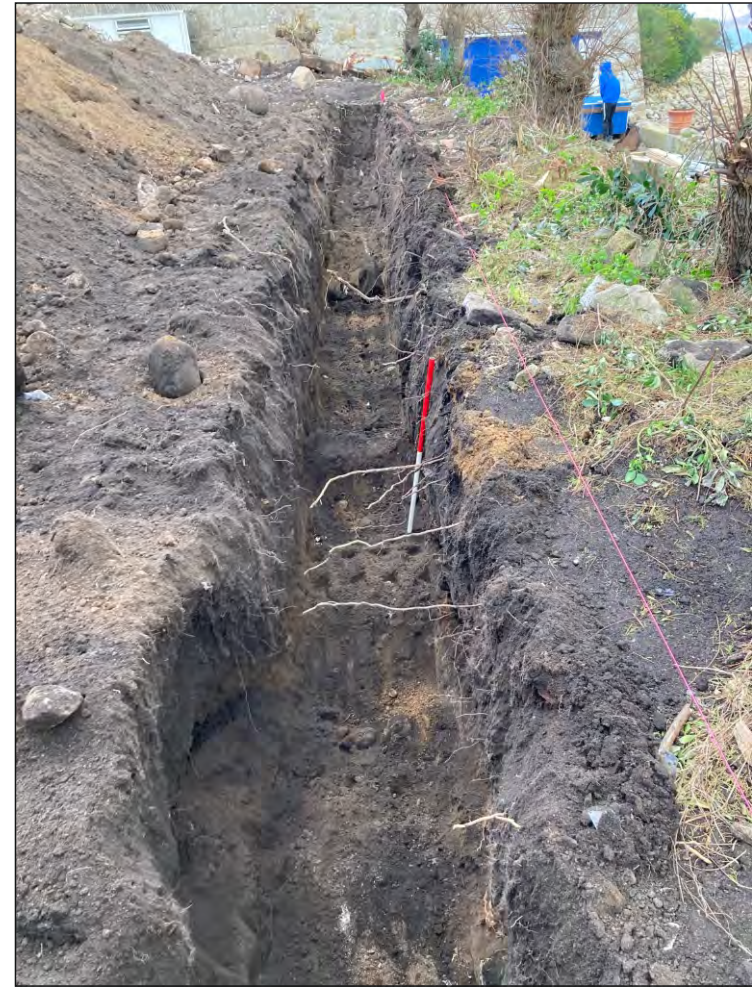
Pl. 2 General view of the service trench showing depth of deposits above growan natural subsoil. 1m scale. Looking west.