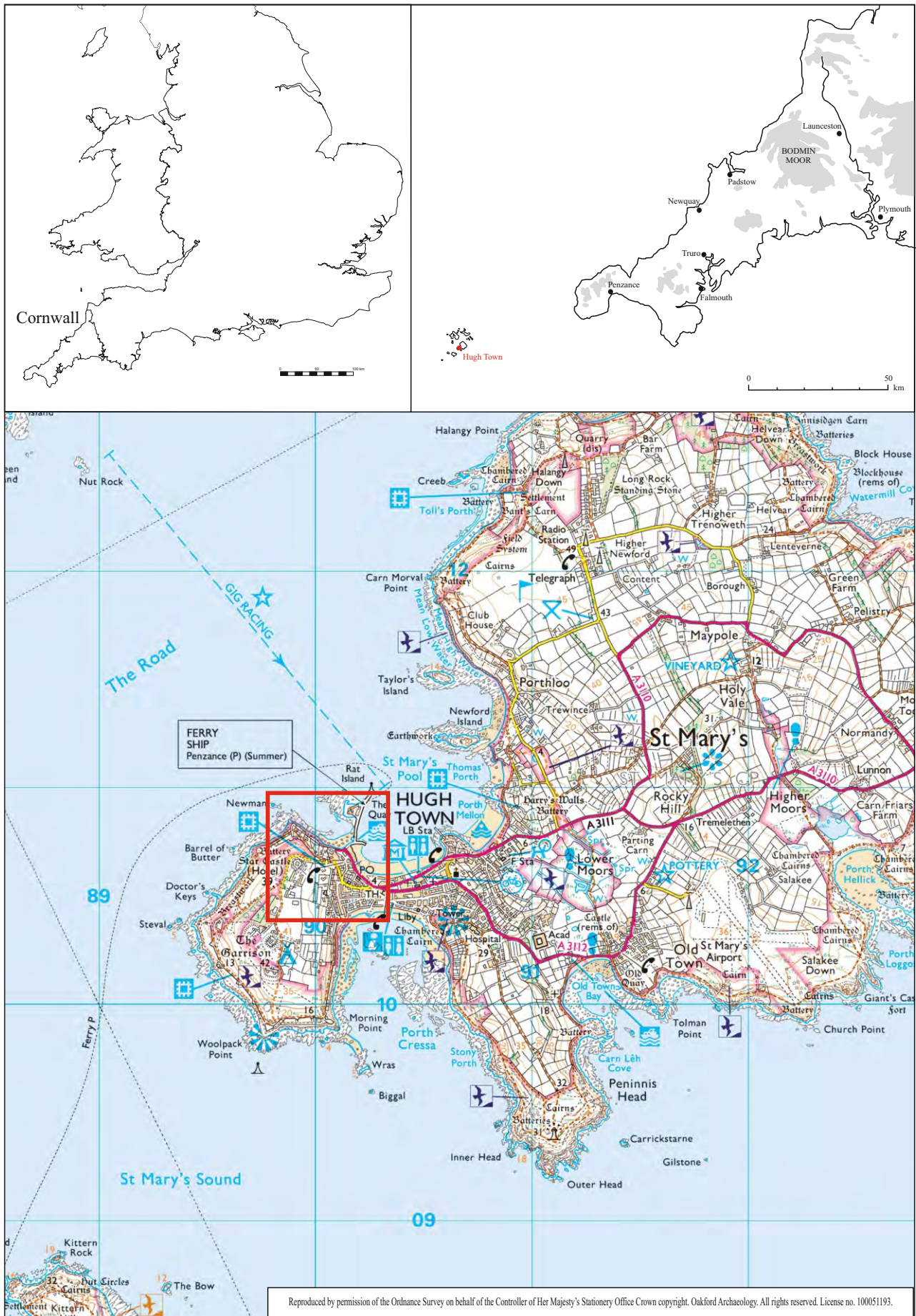
Fig. 1 Location of site.