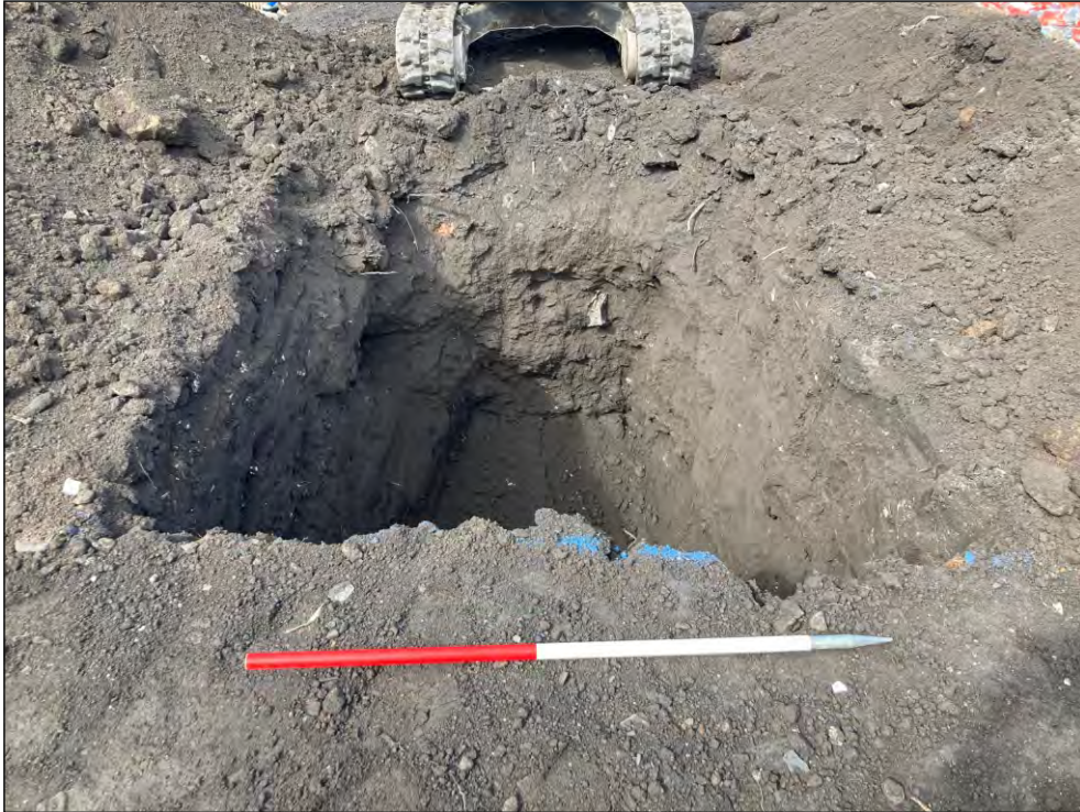
Pl. 5 General view of septic tank showing depth of former garden soil. 1m scale. Looking northwest.