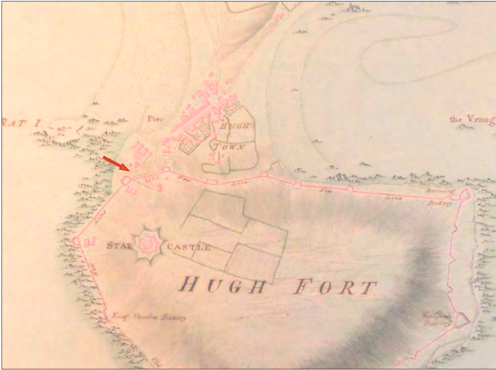
Fig. 4 Detail from Horneck's 1744 Plan of Hugh Fort.