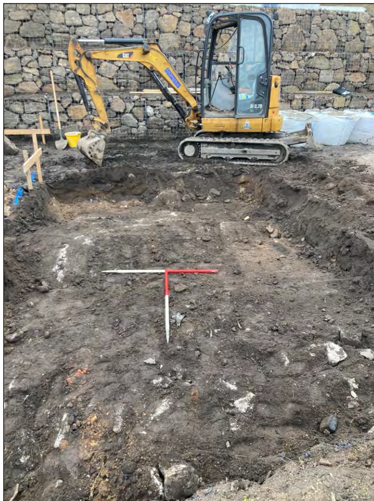
Pl. 4 General view of foundation for Pod 2. 1m scales. Looking southwest.