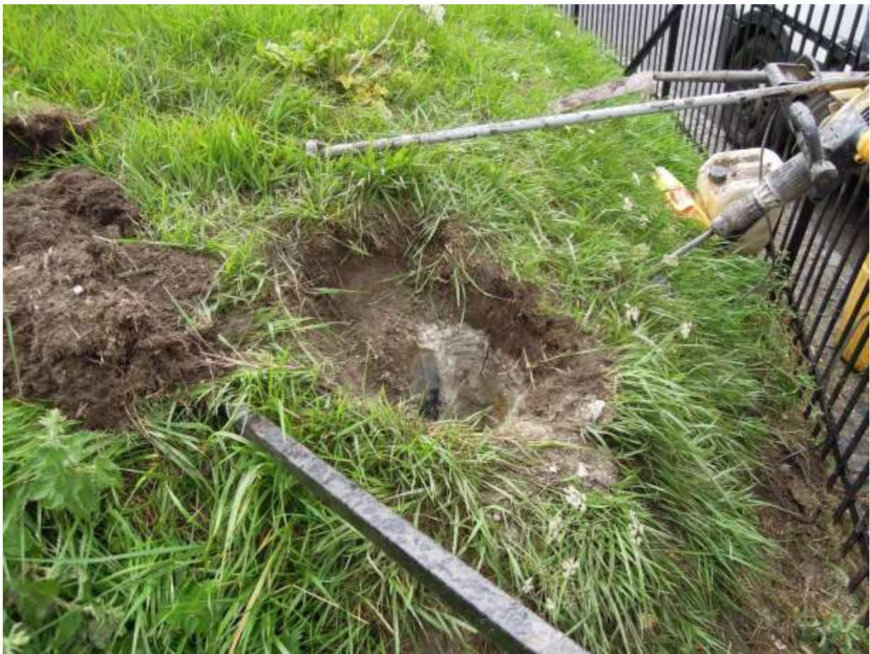
Fig. 3 Detailed view of Post-hole 7 after excavation, looking south