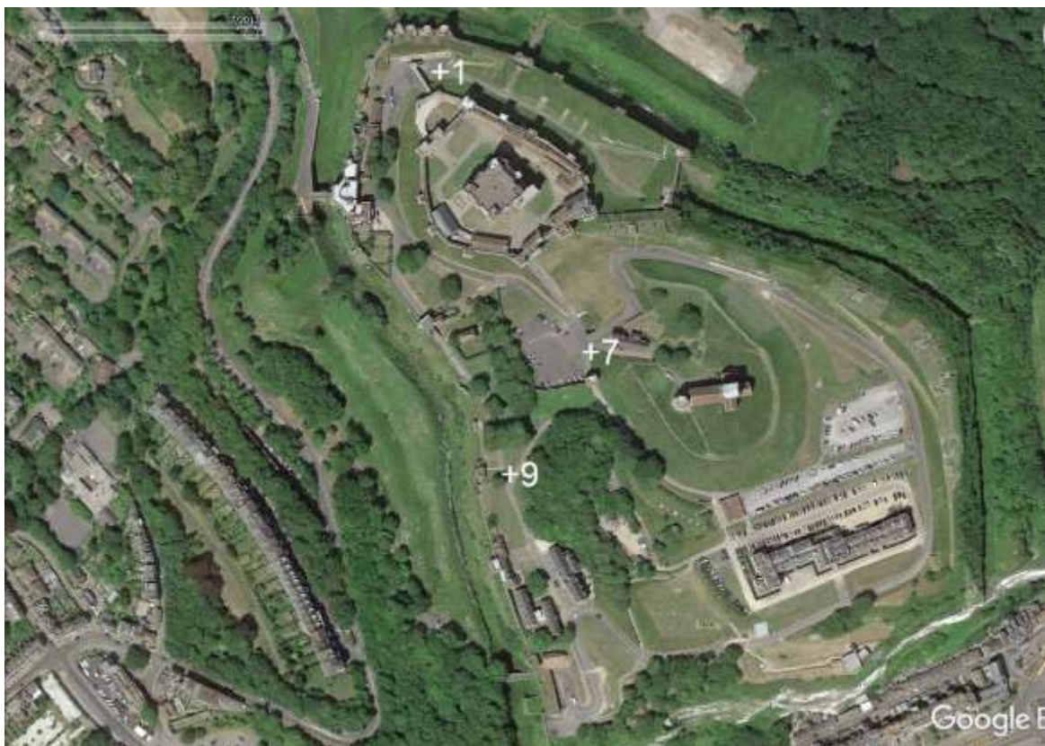
Fig. 5 Aerial view of Dover Castle showing position of new post-holes (PHs 1, 7 & 9)