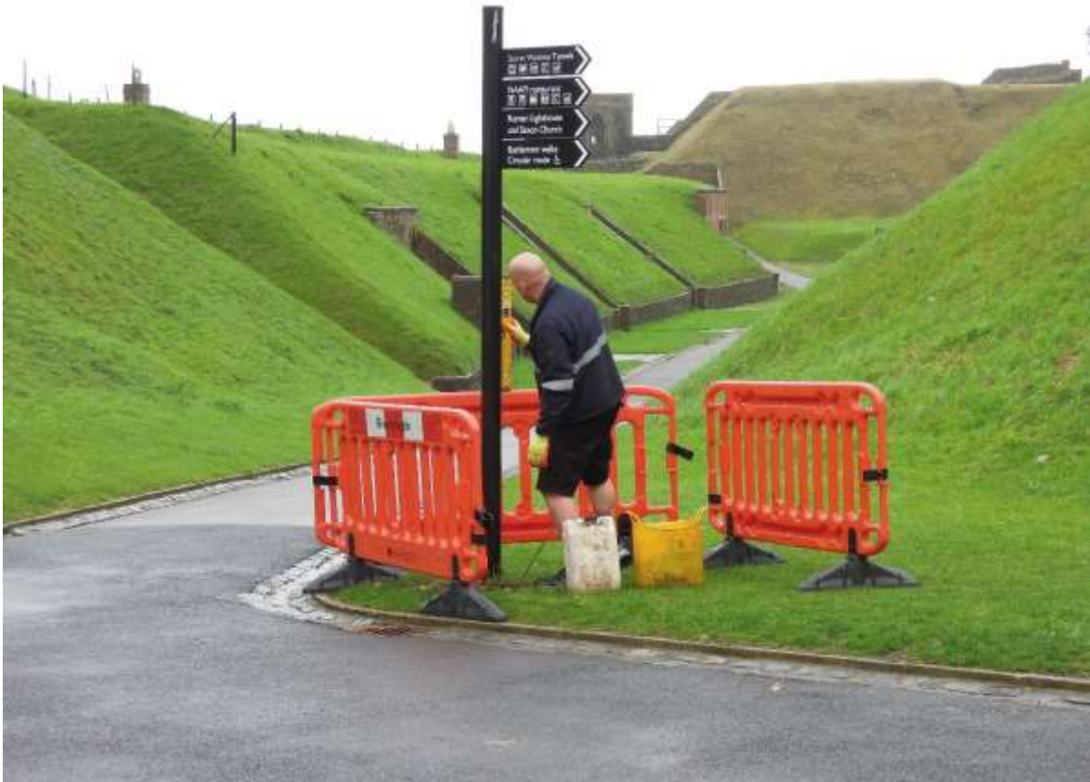
Fig. 2 General view of new post inserted into Post-hole 1, looking east