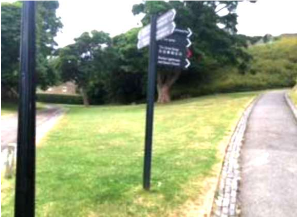
Fig. 4 General view of the site of Post-hole 9 before new post was installed, looking north