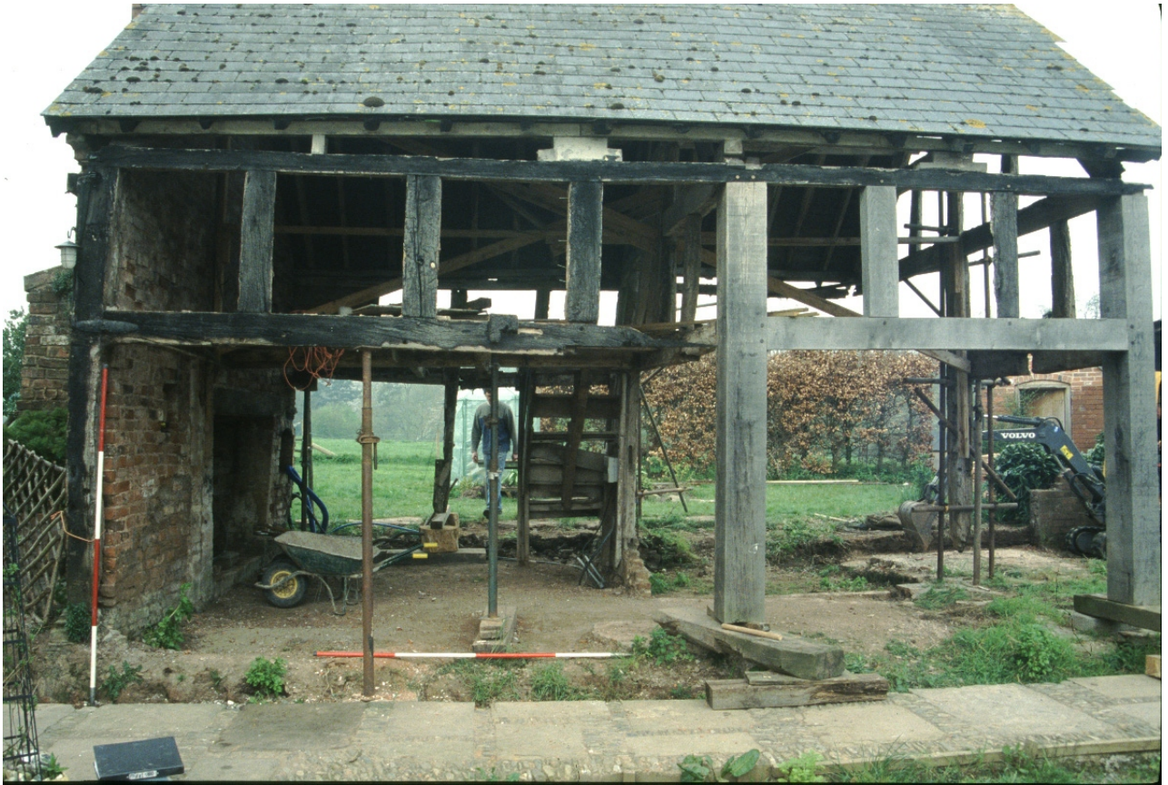
Plate 1 Kitchen looking west