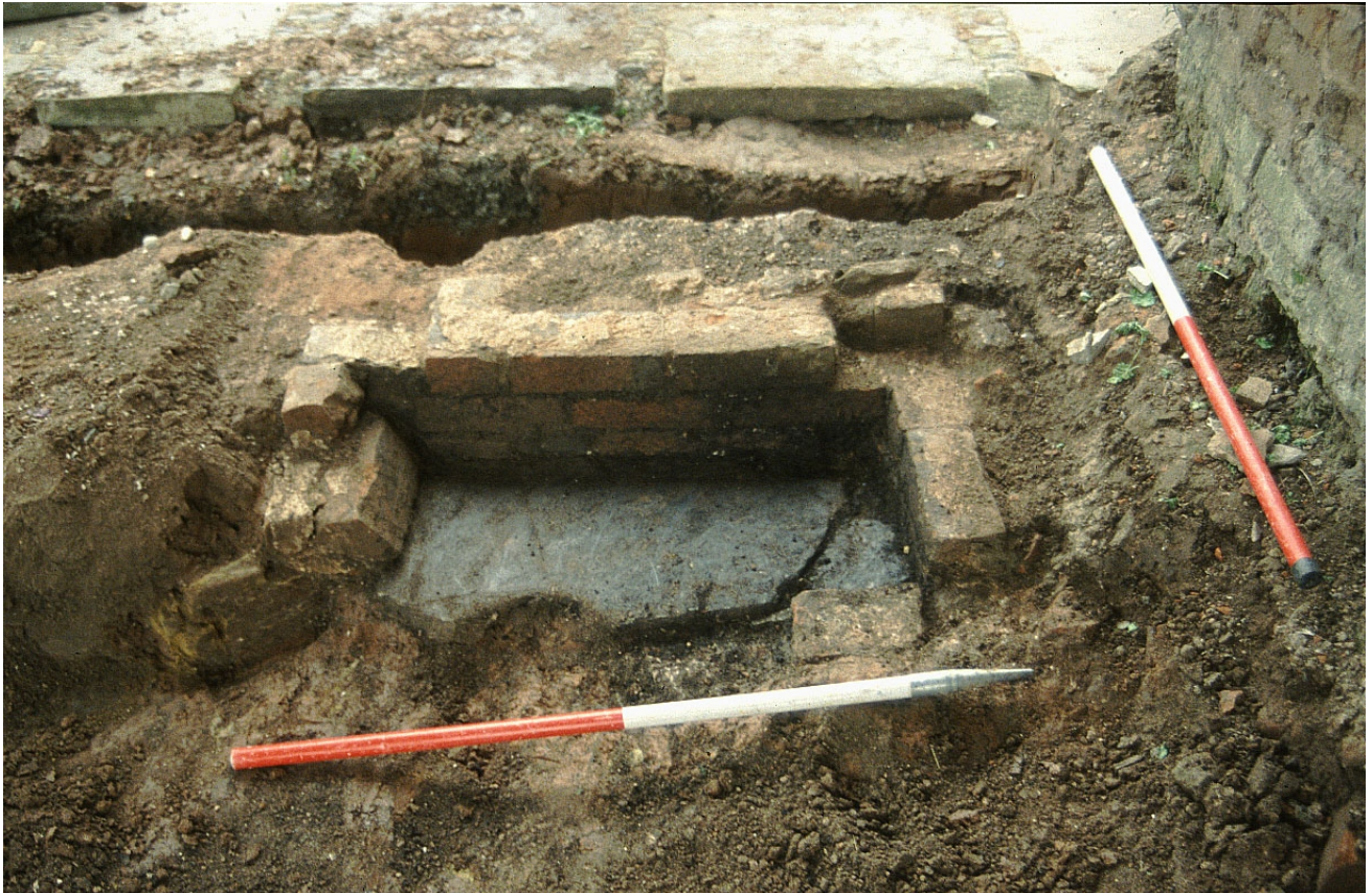
Plate 3 Hearth 110