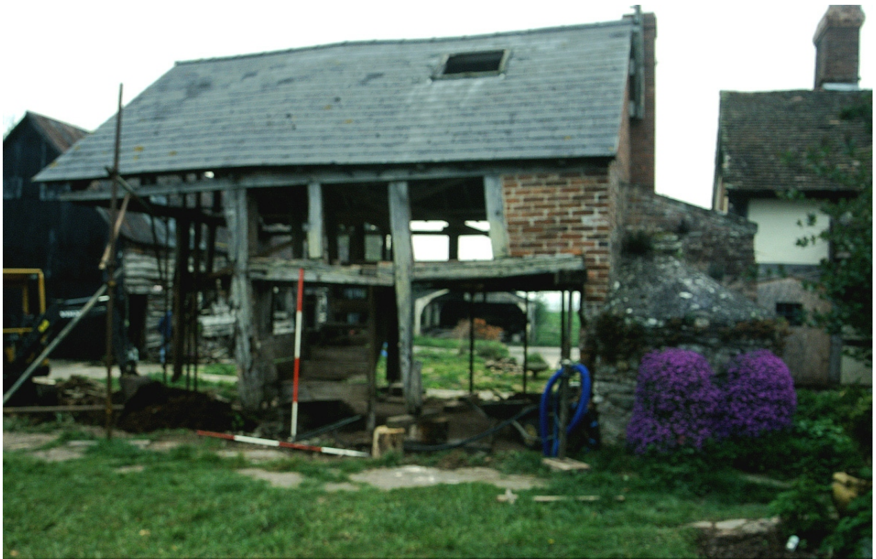
Plate 1 Kitchen looking east