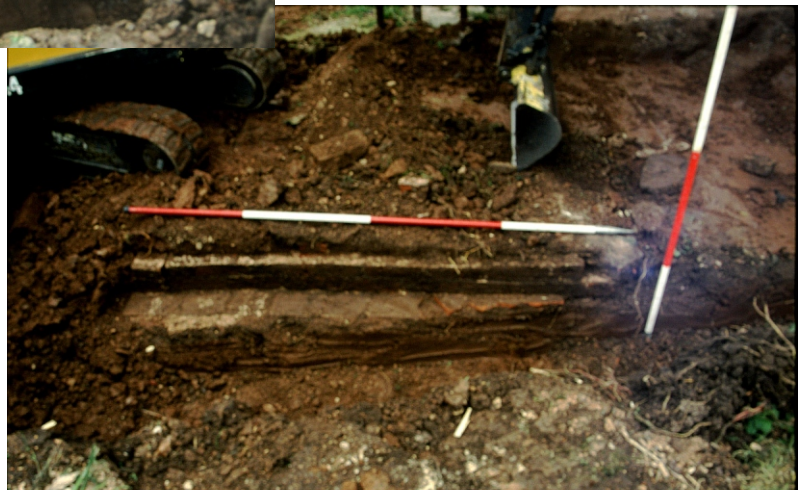
Plate 5 Drain 105