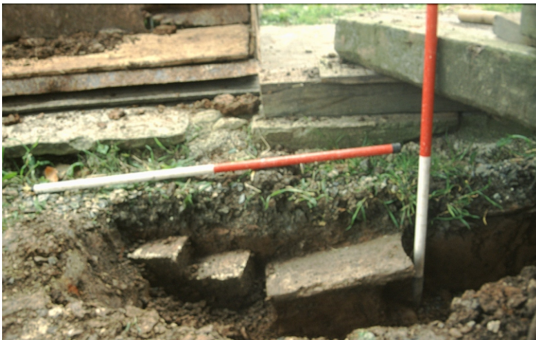
Plate 4 Sandstone slab108