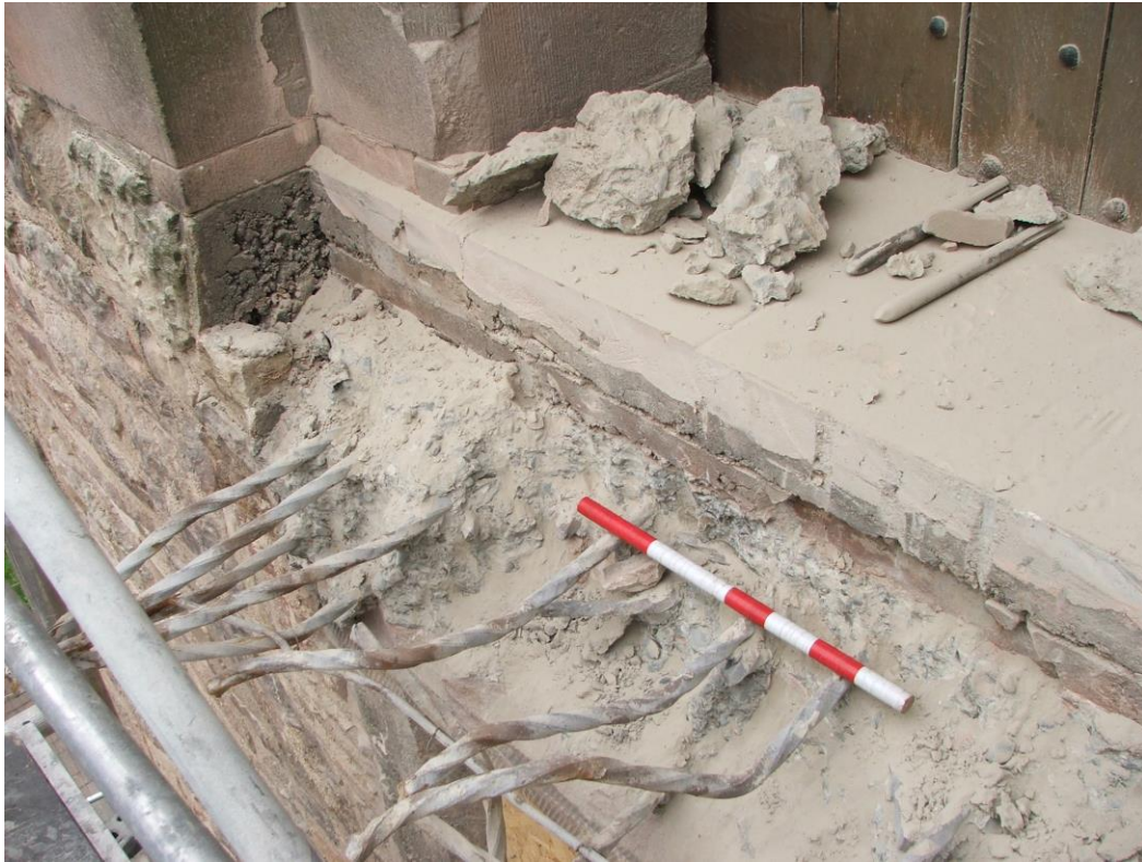
Plate 2 mid excavation view of concrete within door threshold (0.40m scale)