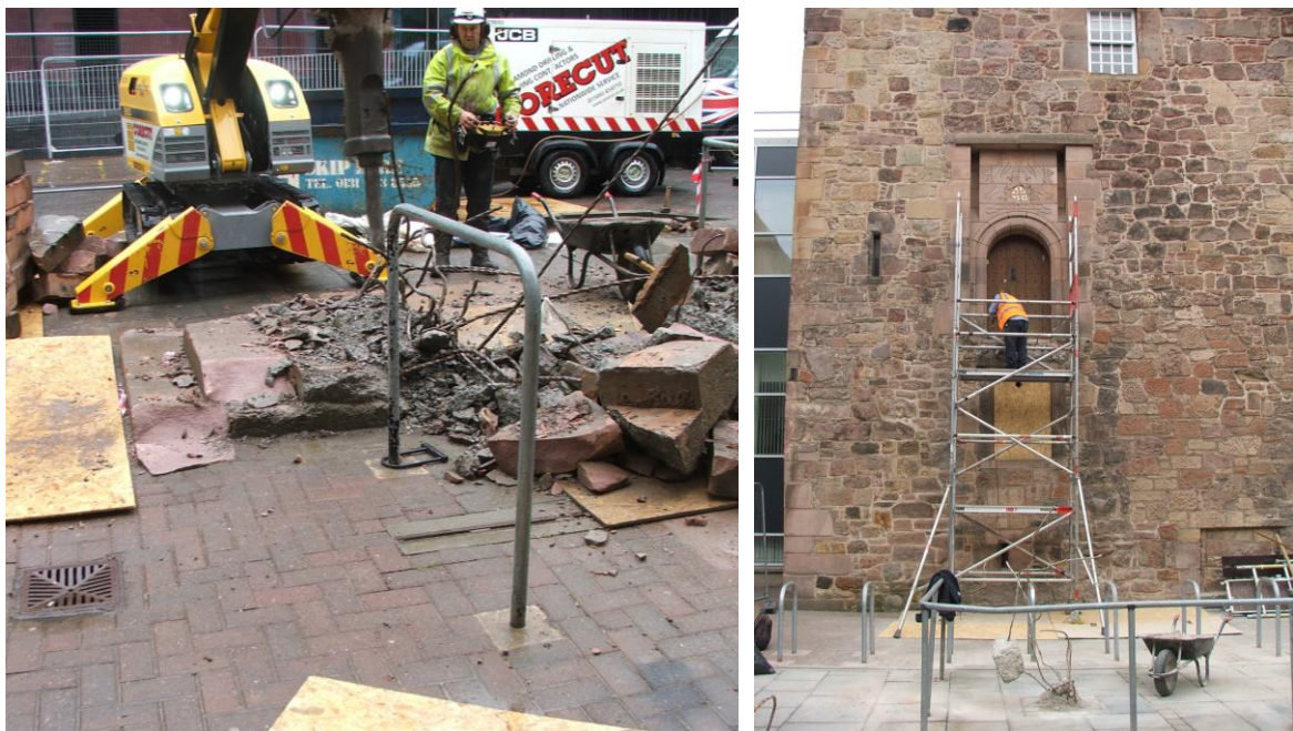
Plate 1 pre excavation view of foundations and junction with castle

The only find of note was a plastic biro pen jammed between the foundation and the surrounding paving; this find was not retained.