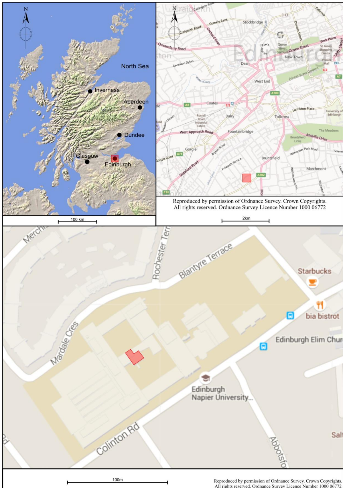
Figure 1 site location