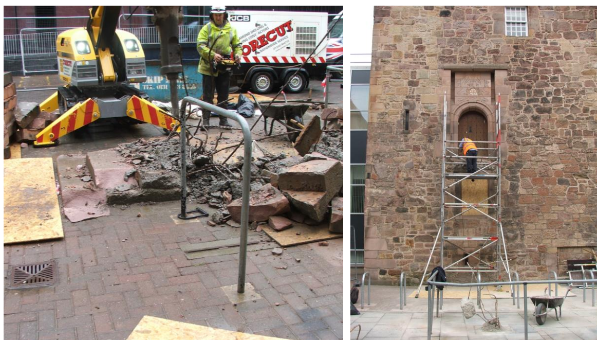
Plate 1 pre excavation view of foundations and junction with castle

The only find of note was a plastic biro pen jammed between the foundation and the surrounding paving; this find was not retained.