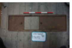
2313 ECHF (090)....