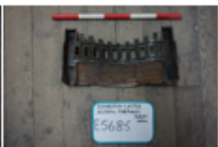
2313 ECHF (072)....