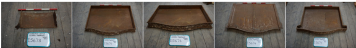
2313 ECHF (041).... 2313 ECHF (042).... 2313 ECHF (043).... 2313 ECHF (044).... 2313 ECHF (045)....