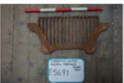
2313 ECHF (088)....