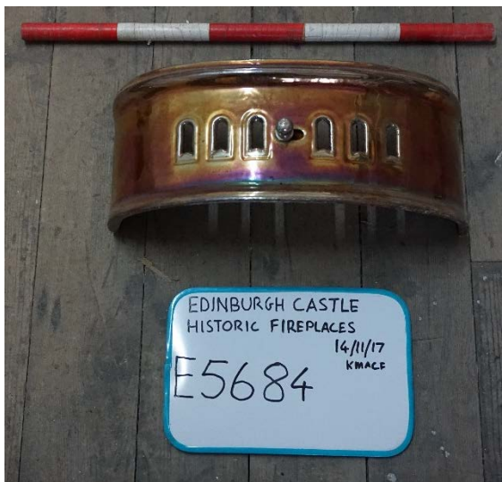
Plate 33 E5684 fireplace fret

These sat in front of the grate covering the grate and ash pan and also controlled the air flow to the fire. These were mostly early to mid-20 th century with some earlier ones.