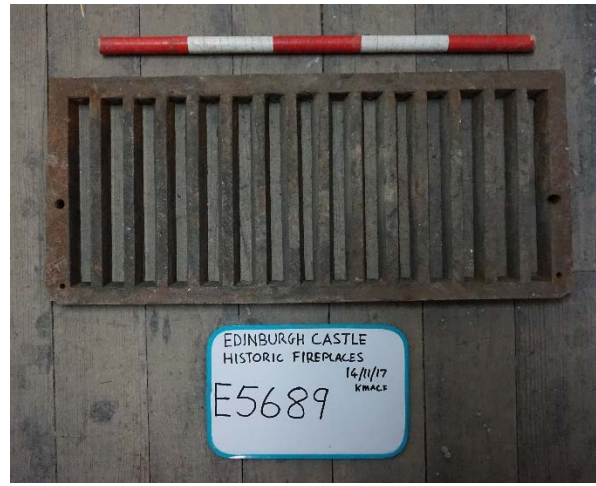
Plate 23 E5689 large grate