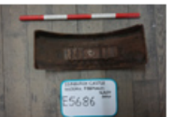
2313 ECHF (075)....