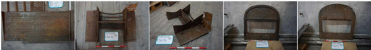
2313 ECHF (051).... 2313 ECHF (052).... 2313 ECHF (053).... 2313 ECHF (054).... 2313 ECHF (055)....