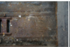
2313 ECHF (079)....