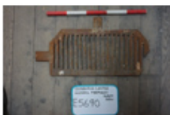
2313 ECHF (086)....