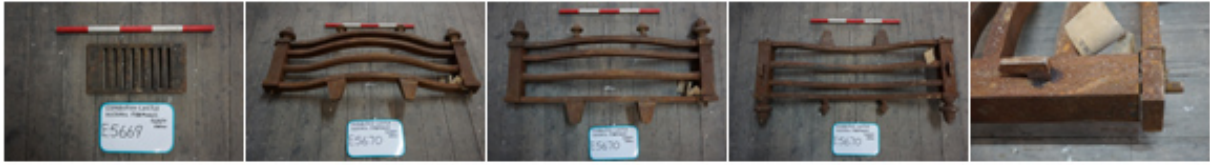
2313 ECHF (031).... 2313 ECHF (032).... 2313 ECHF (033).... 2313 ECHF (034).... 2313 ECHF (035)....