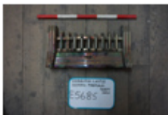
2313 ECHF (071)....