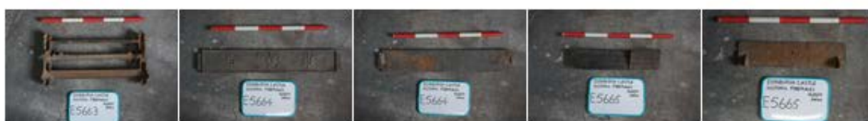
2313 ECHF (016).... 2313 ECHF (017).... 2313 ECHF (018).... 2313 ECHF (019).... 2313 ECHF (020)....