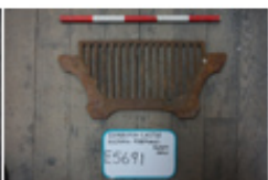
2313 ECHF (087)....