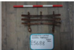
2313 ECHF (082)....