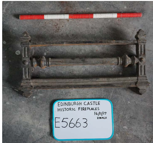
Plate 41 E5663 fireplace fret

E5667 and E5700 were bowed bar fronts that likely fitted into something like an insert fireplace fire.