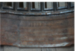
2313 ECHF (073)....