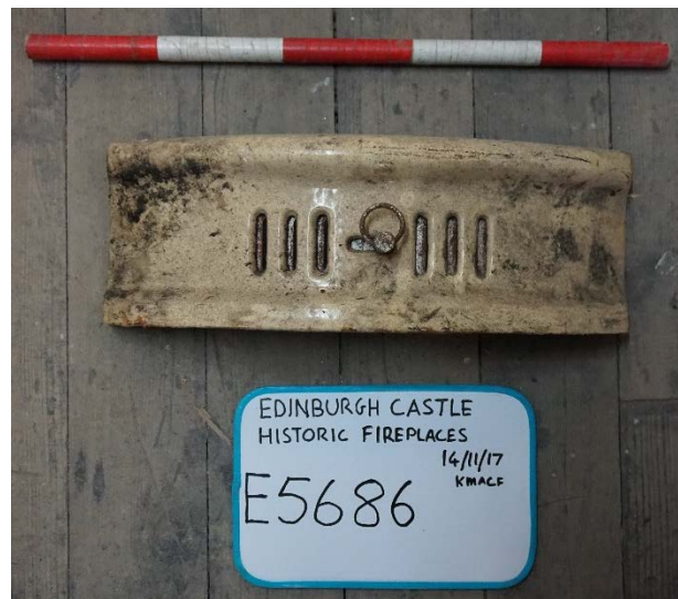
Plate 34 E5686 fireplace fret

E5684, E5686 & E5687 were bowed enameled frets of early to mid-20 th C date.