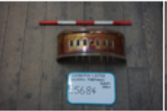
2313 ECHF (069)....