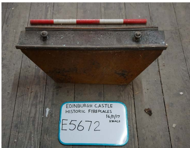
Plate 42 E5672 copper fronted ash pan