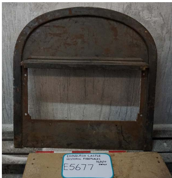
Plate 12 range front E5677