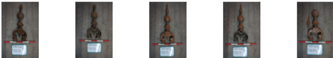
2313 ECHF (056).... 2313 ECHF (057).... 2313 ECHF (058).... 2313 ECHF (059).... 2313 ECHF (060)....