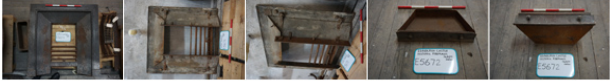
2313 ECHF (036).... 2313 ECHF (037).... 2313 ECHF (038).... 2313 ECHF (039).... 2313 ECHF (040)....