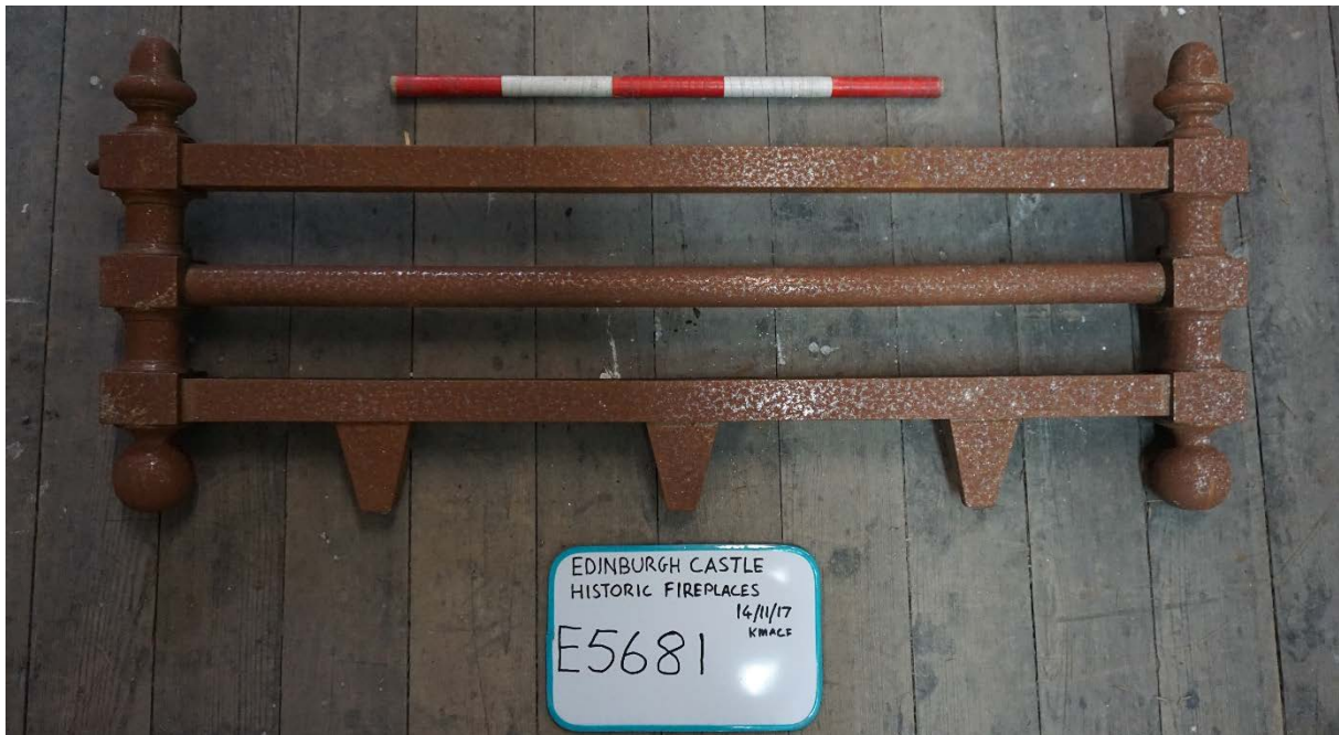
Plate 16 fire front E5681

Although these are very similar it appears they have been assembled slightly differently with the side upright acorn and ball finials reversed and the bars arranged differently on either one.