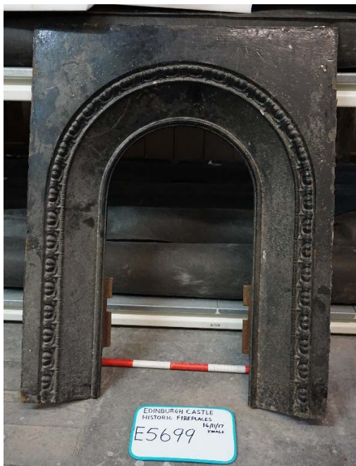
Plate 8 fire insert E5699 front

Insert E5699 was formed in a single cast iron piece with a round topped opening with a decorative moulded surround. Tabs on the internal face show where fire bars would have been attached.