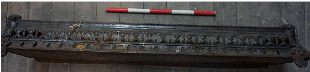
Plate 21 fire fender E5701 detail of design