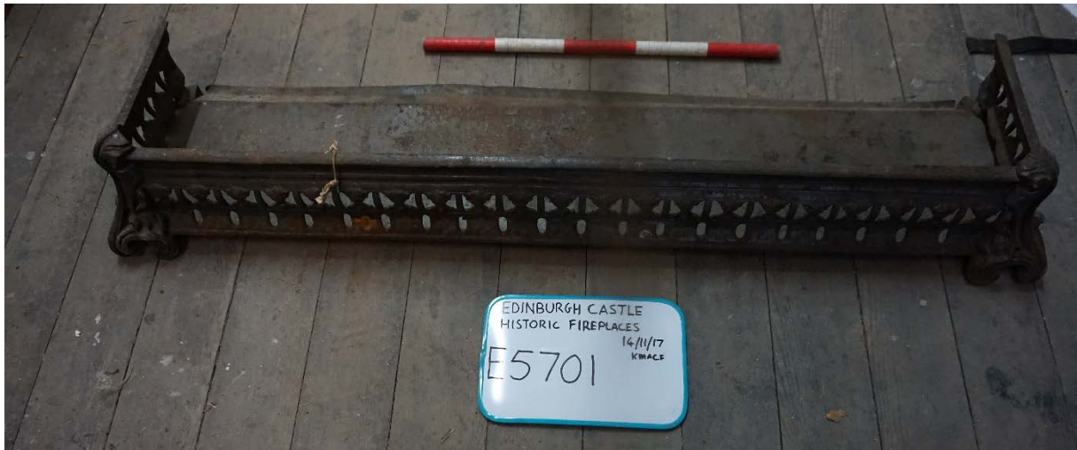
Plate 20 large fire fender E5701