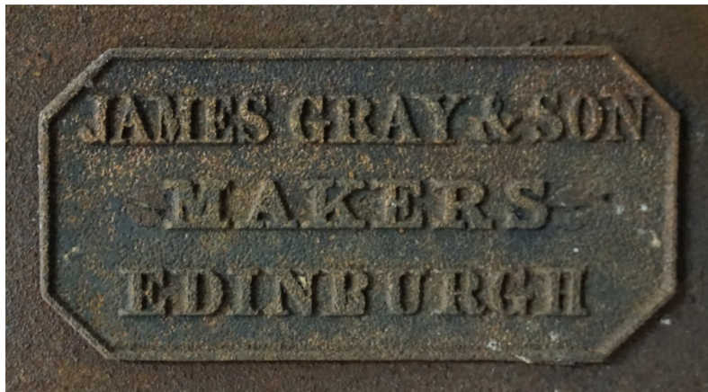
Plate 3 E5694 maker's plate

A large probable kitchen range formed from substantial and heavy plates of iron likely dated from the 19 th century, the main part of this was numbered E5694 but loose parts E5693, E5692 and E5696 are most likely further parts of this range. The back plate of the range had a makers' plate "JAMES GREY & SON MAKERS EDINBURGH" this is likely James Grey and Son from 85 or 89 George St., Edinburgh, founded 1818 by James Grey and latterly succeeded by his son/s.