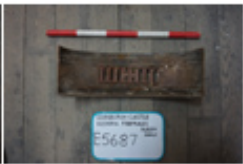
2313 ECHF (077)....