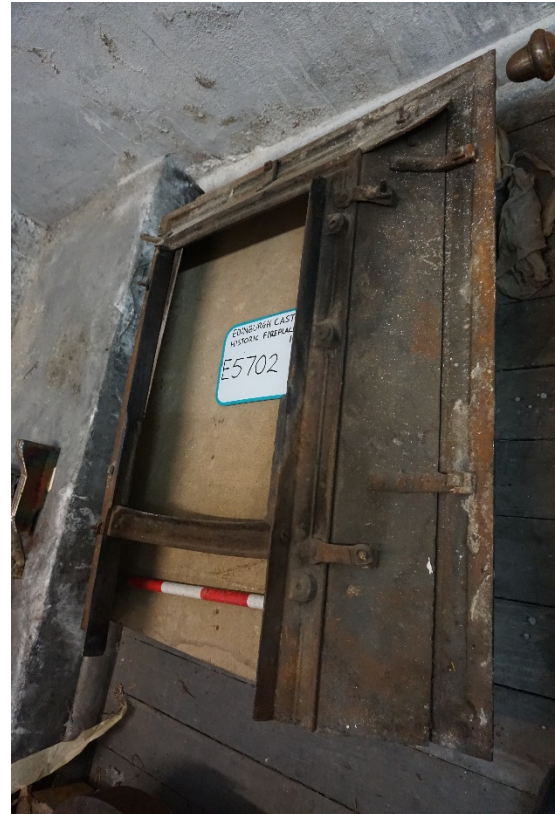
Plate 11 fire insert E5702 rear showing construction