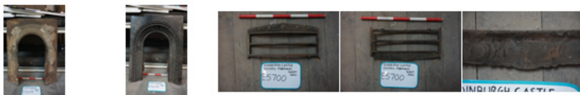
2313 ECHF (106).... 2313 ECHF (107).... 2313 ECHF (108).... 2313 ECHF (109).... 2313 ECHF (110)....