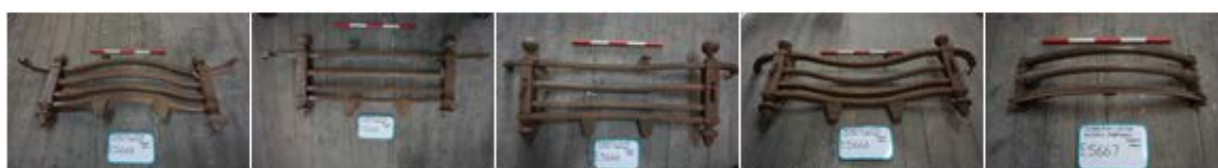
2313 ECHF (021).... 2313 ECHF (022).... 2313 ECHF (023).... 2313 ECHF (024).... 2313 ECHF (025)....