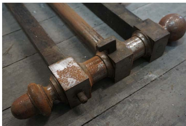
Plate 17 E5681 detail of side upright showing hook on rear

E5681 is also a large 1m wide fire front/bars similar to E5661 and E5670 which is also screwed and bolted together but with only three bars and three triangular details on the front rather than two. This one is also slightly more ornate than the others with part-turned side uprights and the finish in this case appeared to have been burnished. Again as with the others the arrangement is somewhat mixed with the placement of the acorn and ball finials and the alignment rear hook different.