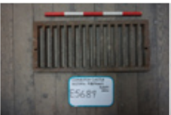
2313 ECHF (083)....