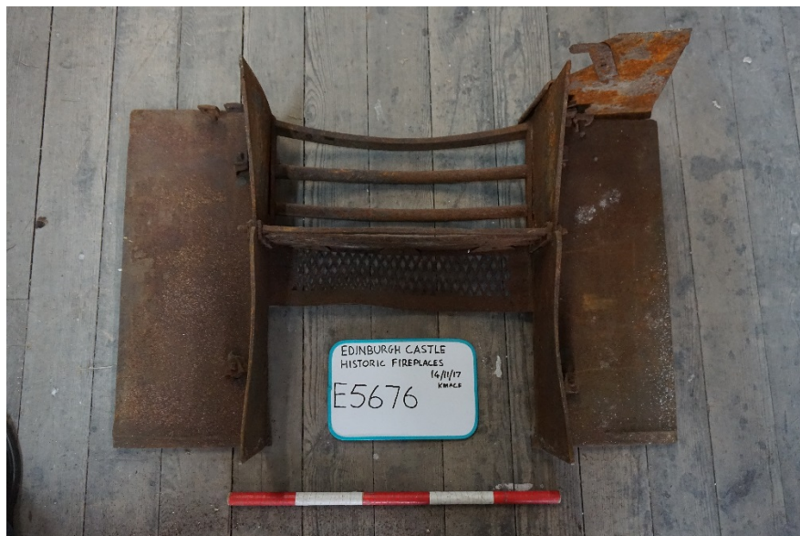
Plate 2 hob grate E5676 rear