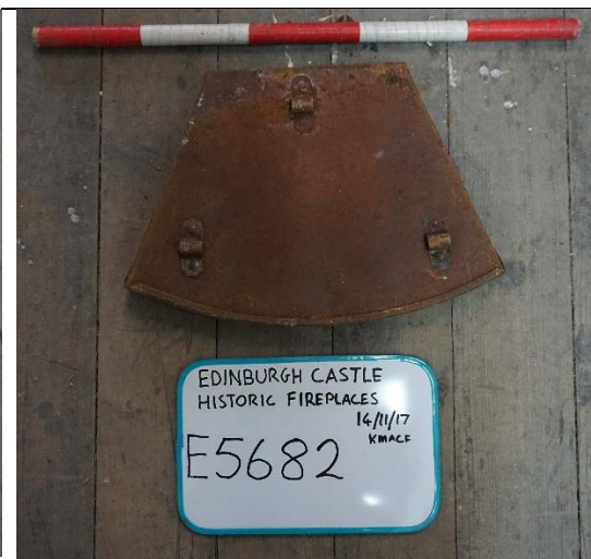
Plate 43 E5682 plain ash pan

These ash pans would sit beneath the grates to collect ash for easy disposal.