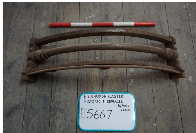
Plate 38 E5667 fireplace fret