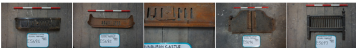
2313 ECHF (096).... 2313 ECHF (097).... 2313 ECHF (098).... 2313 ECHF (099).... 2313 ECHF (100)....