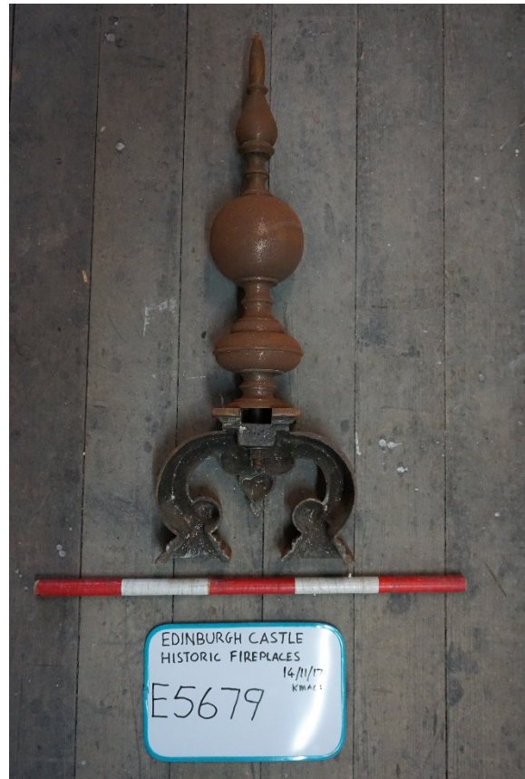
Plate 19 E5679 fire dog rear showing hollow casting

There were likely four (or more) of these originally forming two pairs, two of these had originally a polished/burnished finish and the third was heavily corroded. These finishes are comparable to the finishes on the large open fire bars E5666 and E5681 and are likely part of the same arrangement with fire dogs E5679 and E5680 part of E5681 and E5678 part of E5666 . The fire dogs may even have been attached directly to the curved-out support arms although the method of attaching is not clear if that was the case.