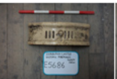
2313 ECHF (074)....