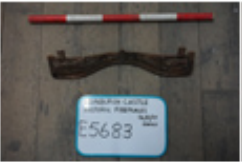
2313 ECHF (068)....