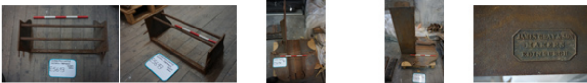
2313 ECHF (091).... 2313 ECHF (092).... 2313 ECHF (093).... 2313 ECHF (094).... 2313 ECHF (095)....