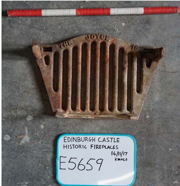
Plate 27 E5659 stool grate underside

Four stool grates were recorded these would be free standing within the fireplace and set up on four integral legs, in use these were often damaged, easily replaced and interchangeable between fireplaces. All were marked with maker/ model or range and size, these were all for a 16" fireplace width.