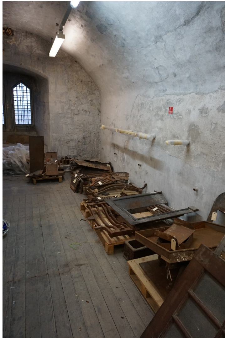
Fireplaces in storage