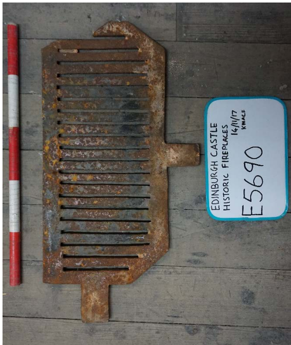
Plate 24 E5690 tabbed grate