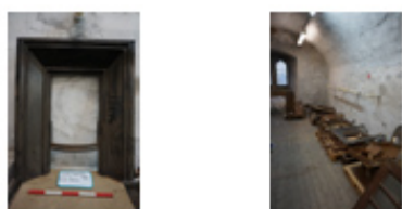
2313 ECHF (116).... 2313 ECHF (117)....