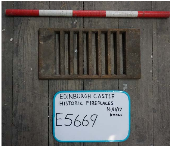
Plate 22 E5669 small grate