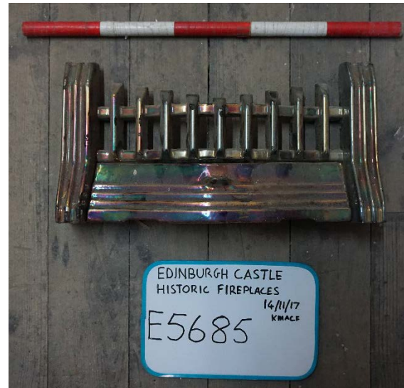
Plate 36 E5685 fireplace fret