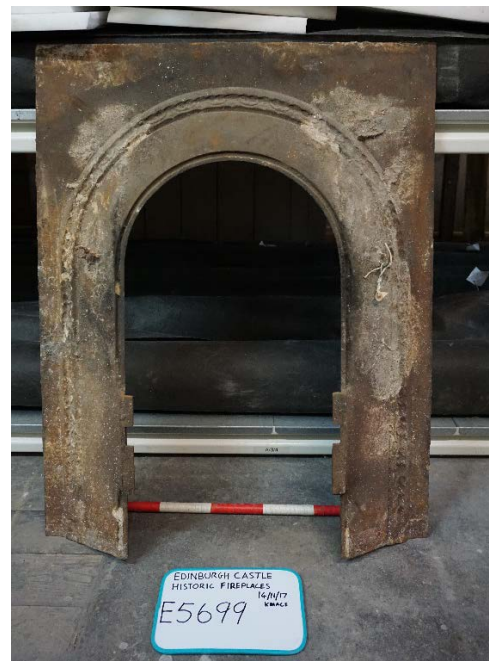
Plate 9 fire insert E5699 rear showing construction