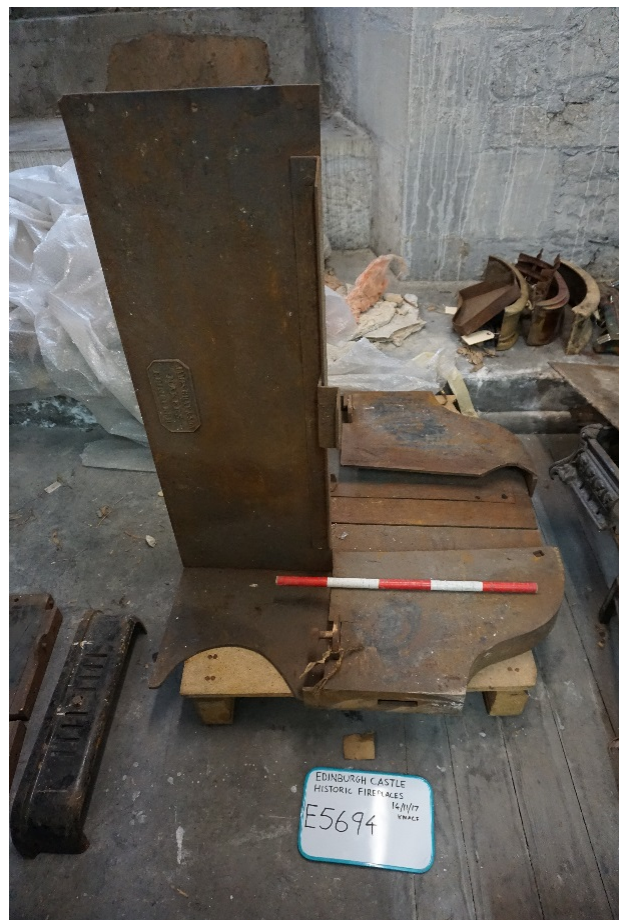
Plate 5 kitchen range back E5694 (on its side)