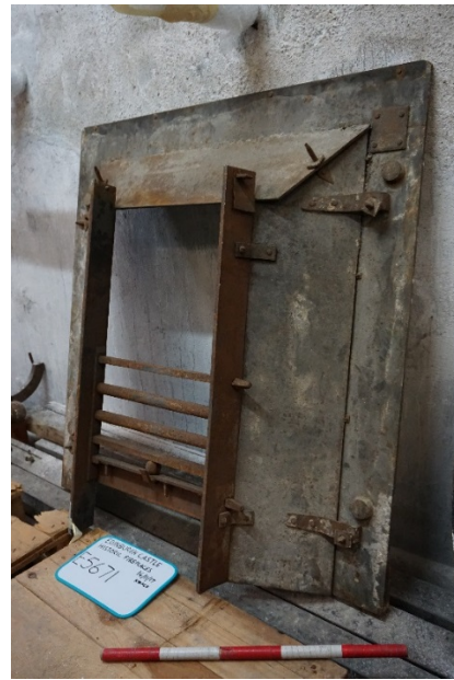
Plate 7 fire insert E5671 rear showing construction

Insert E5699 was formed in a single cast iron piece with a round topped opening with a decorative moulded surround. Tabs on the internal face show where fire bars would have been attached.