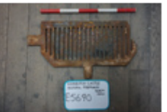
2313 ECHF (085)....