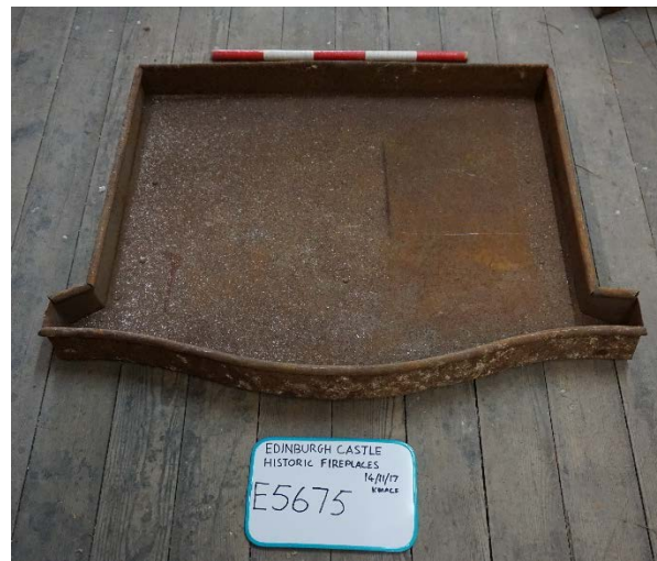
Plate 45 E5675 large ash pan ?