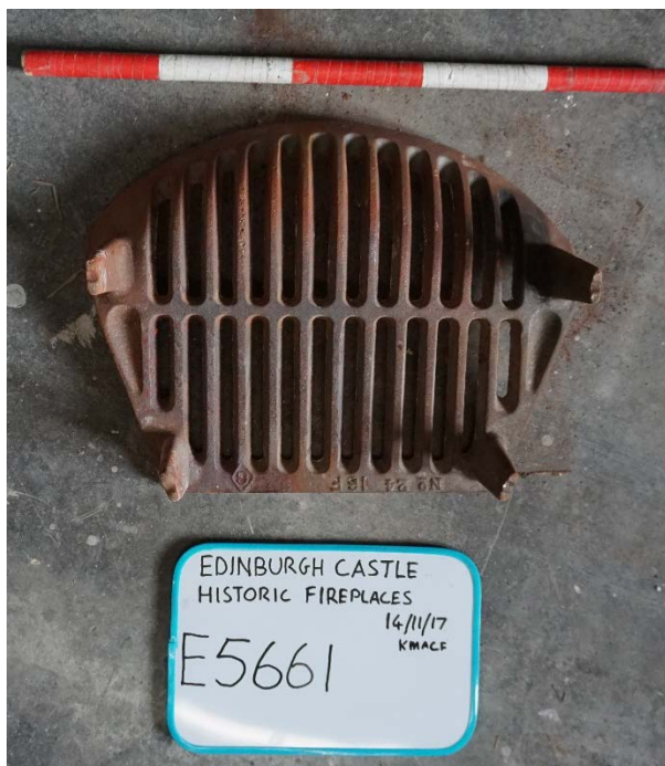
Plate 29 E5661 stool grate underside