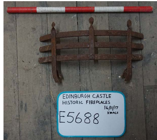
Plate 32 E5688 coal saver

E5683 would fit into the two tab slots on the front of a Joyce grate similar to E4689.