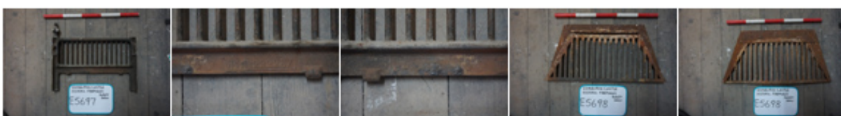
2313 ECHF (101).... 2313 ECHF (102).... 2313 ECHF (103).... 2313 ECHF (104).... 2313 ECHF (105)....