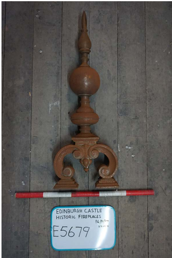
Plate 18 E5679 fire dog front

Within the collection three fire dogs were noted ( E5678 , E5679 & E5680 ), these originally were pairs of bracket supports holding a fire basket or logs within a large fireplace. On all three the rear horizontal legs are lost, only the decorative front vertical element remaining. These surviving parts were formed in two cast parts - a hollow cast foot bolted onto a hollow cast turned finial