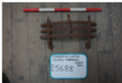
2313 ECHF (081)....