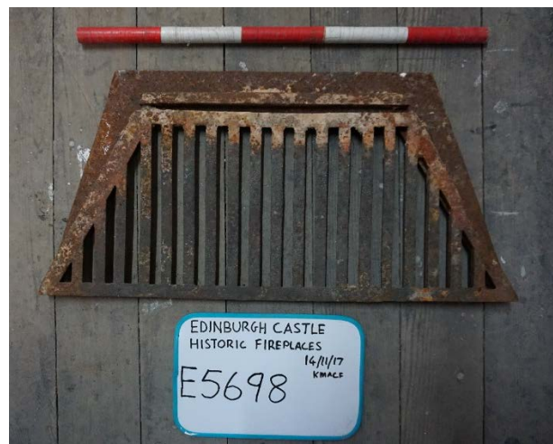
Plate 26 E5698 altered grate