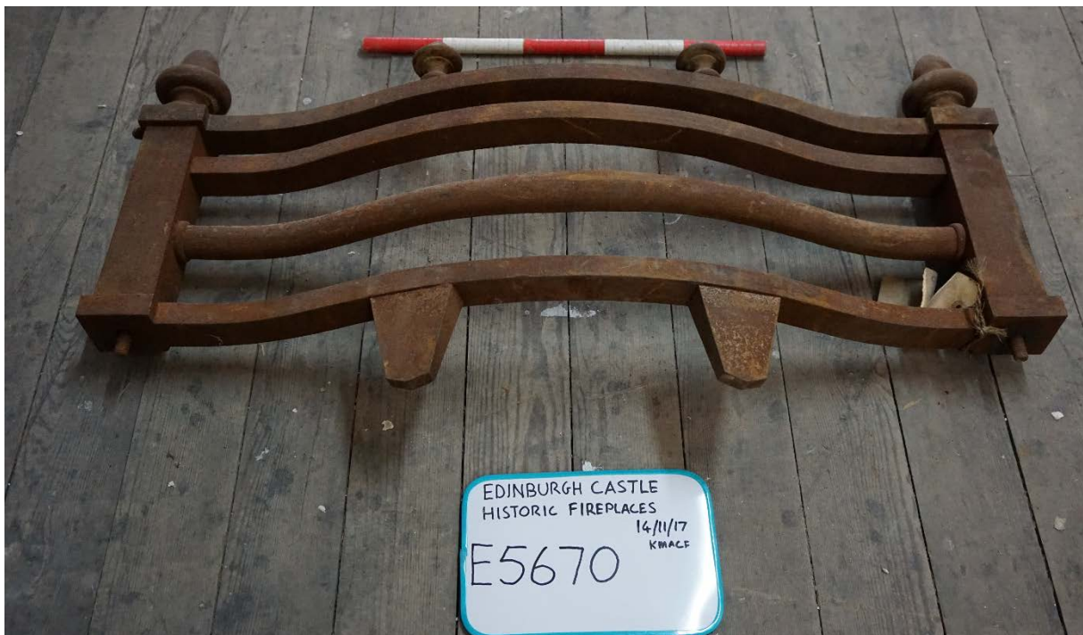
Plate 15 E5670 fire front

Both of the fire bar fronts E5666 and E5670 have very similar design features, with two square side uprights holding four substantial bowed out horizontal fire bars (3 alternating square and round and a