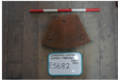
2313 ECHF (066)....