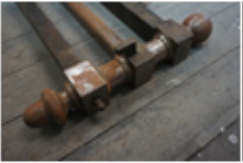
2313 ECHF (064)....