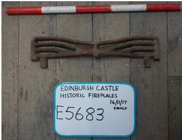
Plate 31 E5683 coal saver

Two coal savers/upstands were recorded within the collection, these would be attached to the front of a grate to stop coals from falling out of the fire.