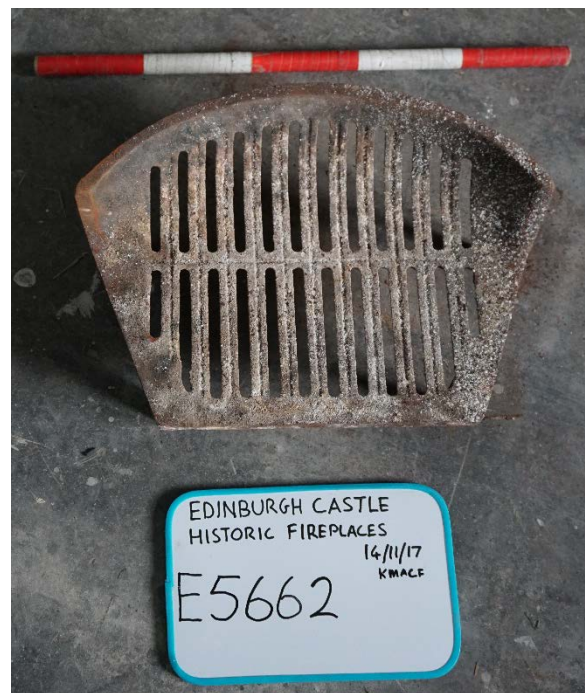
Plate 30 E5662 stool grate

E5659 a flat stool grate marked on the underside " THE JOYCE 16 "; two slot holes on the front would be to fit a separate coal saver like E5683 .