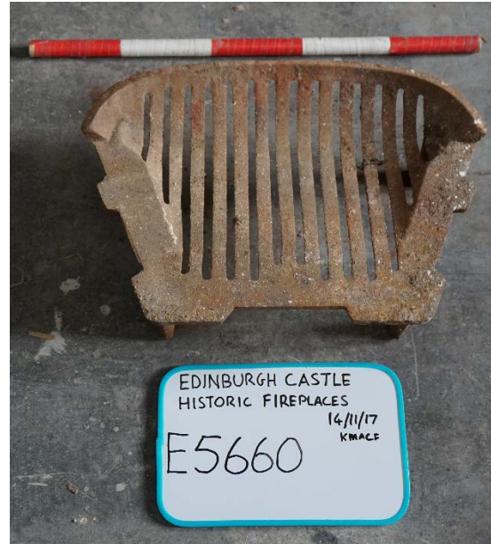
Plate 28 E5660 stool grate