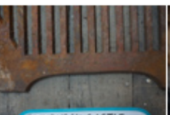
2313 ECHF (089)....