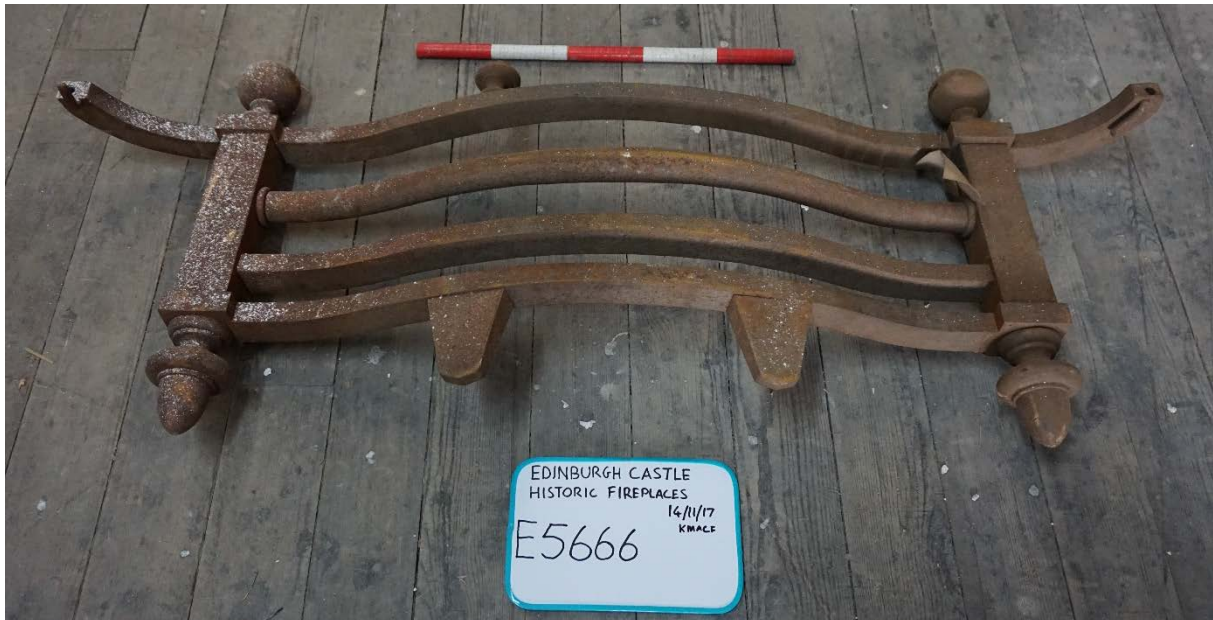
Plate 14 fire front E5666

Fires E5666 and E5670 are large 1m wide fire front/bars screwed and bolted together and formed from substantial pieces of iron. The front is bowed out and has moulded finials/feet. The surviving finish is heavily rusted.