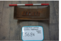
2313 ECHF (070)....