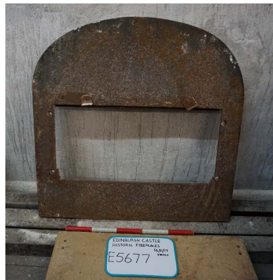
Plate 13, range front E5677, rear

A substantial and heavy arched front E5677 formed from thick heavy slabs of iron. It could be from a large and substantial kitchen range, a moulded detail was screwed around the opening but has been mostly lost.