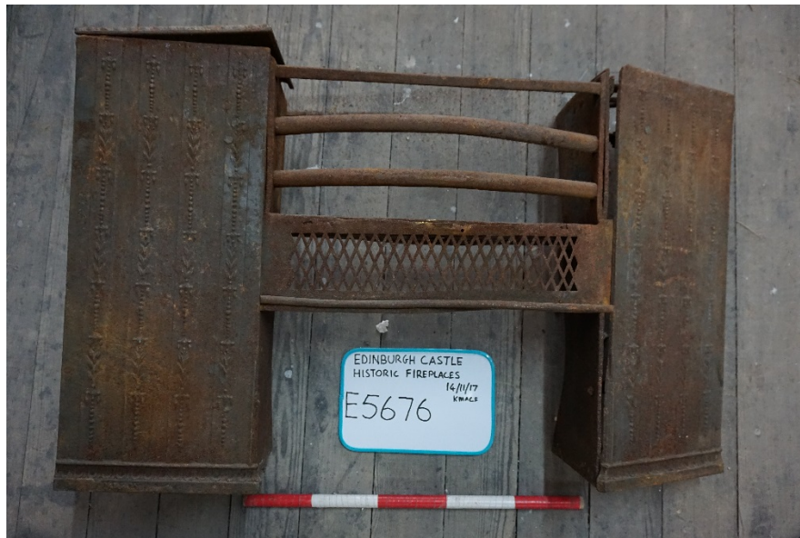
Plate 1 hob grate E5676 front

The earliest identifiable fireplace components in the group appear to be a near complete hob grate, E5676, this formed from a cast iron plate front, bolted and cramped together with plate metal to form the hobs. This was a combined fireplace and hobs (shelves) to stand kettles/pots or irons. These date from the 18 th to the early 19 th century; the present example is detailed with floral decoration to the sides.