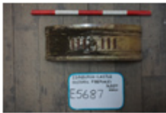
2313 ECHF (076)....