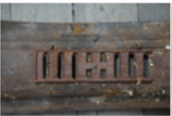
2313 ECHF (078)....