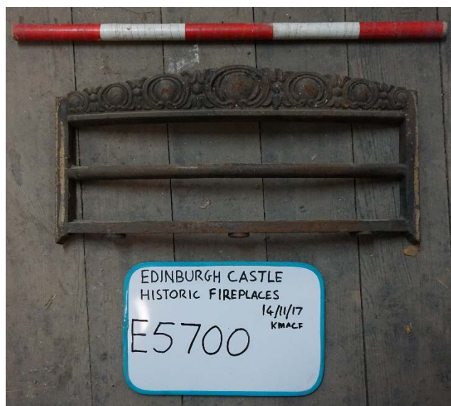
Plate 40 E5700 fireplace fret