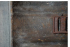
2313 ECHF (080)....