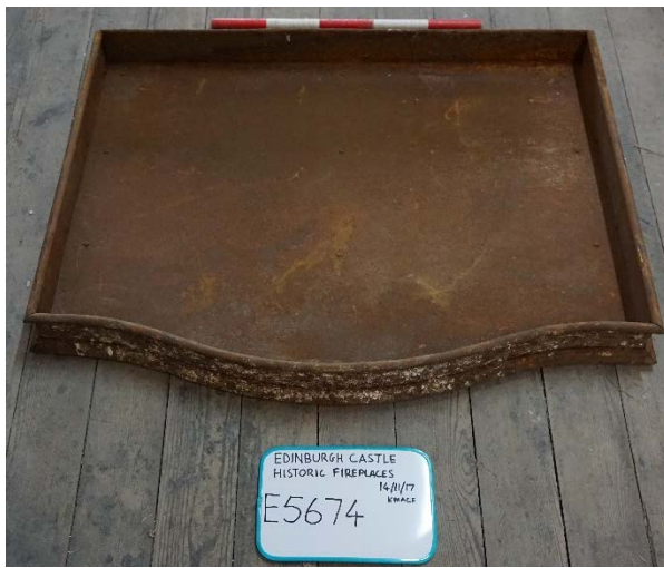
Plate 44 E5674 large ash pan ?

Very large possible ash pans E5674 and E5675 could have sat beneath large fires but no real heat damage in the thin metal can be seen as a large fire would leave behind, alternatively these are for some other function.