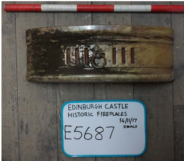
Plate 35 E5687 fireplace fret