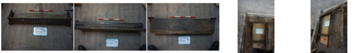
2313 ECHF (111).... 2313 ECHF (112).... 2313 ECHF (113).... 2313 ECHF (114).... 2313 ECHF (115)....