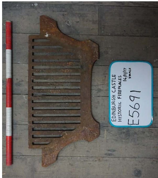
Plate 25 E5691 tabbed grate