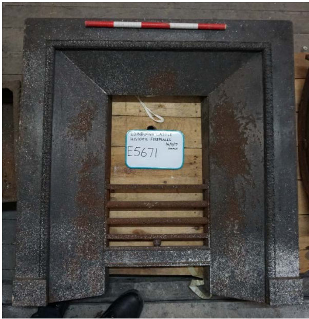
Plate 6 fire insert E5671

Insert E5671 was formed from six major flat plates bolted and cramped together to form a splayed fire opening detailed with narrow bolection frame with simple floral moulding. The front is of cast iron but the sides may be plate. The fire-bars were securely cramped into the frame. There appears to be a repair visible on the rear of the cast front