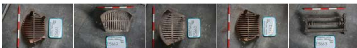
2313 ECHF (011).... 2313 ECHF (012).... 2313 ECHF (013).... 2313 ECHF (014).... 2313 ECHF (015)....