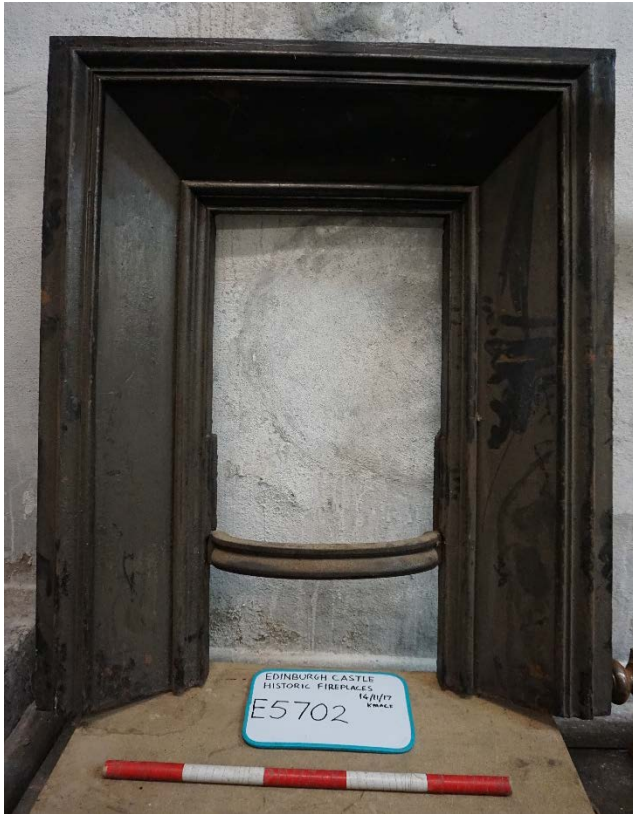
Plate 10 fire insert E5702 front

Insert E5702 was a further multi part cast iron/plate insert bolted and cramped together, this has an inner and outer moulded casting with the inner marked “ CARRON No3 14 ” and likely for a 14” grate.