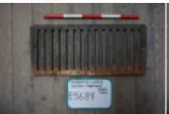
2313 ECHF (084)....