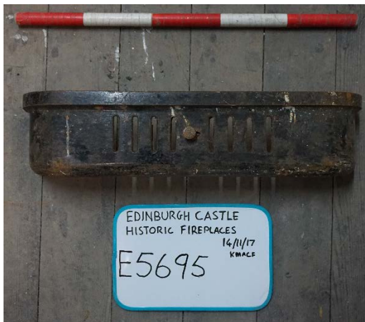
Plate 37 E5695 fireplace fret