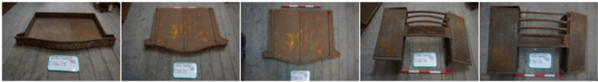
2313 ECHF (046).... 2313 ECHF (047).... 2313 ECHF (048).... 2313 ECHF (049).... 2313 ECHF (050)....