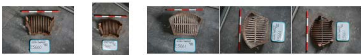
2313 ECHF (006).... 2313 ECHF (007).... 2313 ECHF (008).... 2313 ECHF (009).... 2313 ECHF (010)....