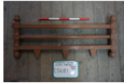
2313 ECHF (062)....