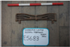
2313 ECHF (067)....