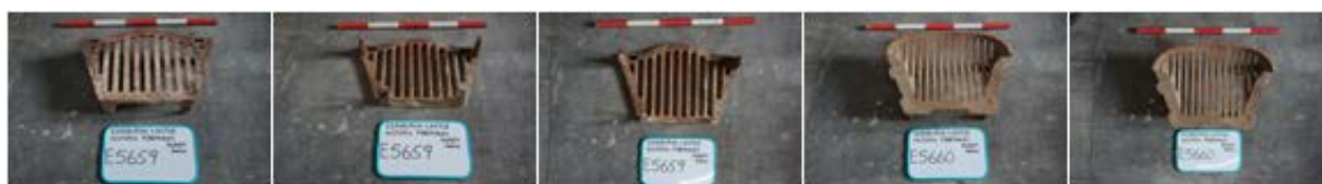
2313 ECHF (001).... 2313 ECHF (002).... 2313 ECHF (003).... 2313 ECHF (004).... 2313 ECHF (005)....