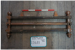
2313 ECHF (063)....