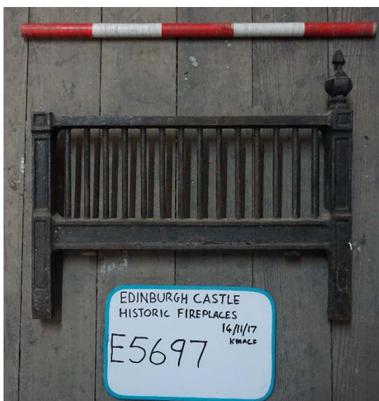
Plate 39 E5697 fireplace fret