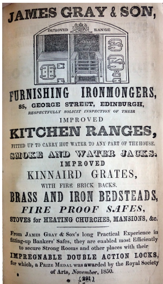
Plate 4 James Grey & Sons Edinburgh, 1852 Advert