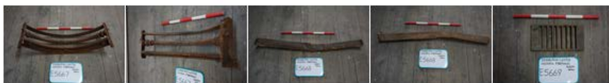
2313 ECHF (026).... 2313 ECHF (027).... 2313 ECHF (028).... 2313 ECHF (029).... 2313 ECHF (030)....