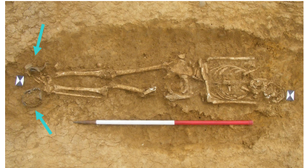
The remains of two pottery vessels placed near the feet

Several graves contained pottery vessels (which presumably originally held either food or drink) and one grave contained animal bone. These offerings could have been for the individual's use in the afterlife or for the gods.