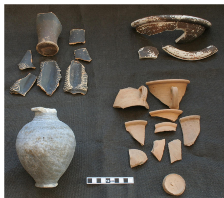
Some of the pottery recovered from graves

Three main types of grave goods were found in the graves: pottery vessels, coins and animal remains. These are usually interpreted as offerings to the gods or as things the individual might need, either in the afterlife or during the journey to it.