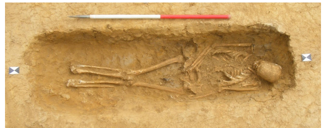
One of the many supine burials

In the majority of the graves the body had been laid out straight on its back with legs extended (a position termed “supine” by archaeologists). The arms were crossed on the front in various attitudes. This was the typical burial position within Roman Britain.