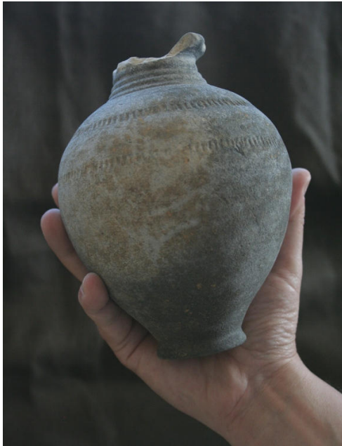
One of the pottery vessels placed in a grave

Two graves contained coins. These are a good example of objects likely to be needed for the journey to the world of the dead (Charon's fee). One of the graves is intriguing because three coins were found at its base on carbonised wood. This grave was one of the triple-deckers and the presence of three coins suggests that the occupants died and therefore journeyed to the afterlife simultaneously.