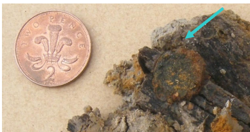
Coin attached to carbonised wood found at base of grave

Two graves contained coins. These are a good example of objects likely to be needed for the journey to the world of the dead (Charon's fee). One of the graves is intriguing because three coins were found at its base on carbonised wood. This grave was one of the triple-deckers and the presence of three coins suggests that the occupants died and therefore journeyed to the afterlife simultaneously.