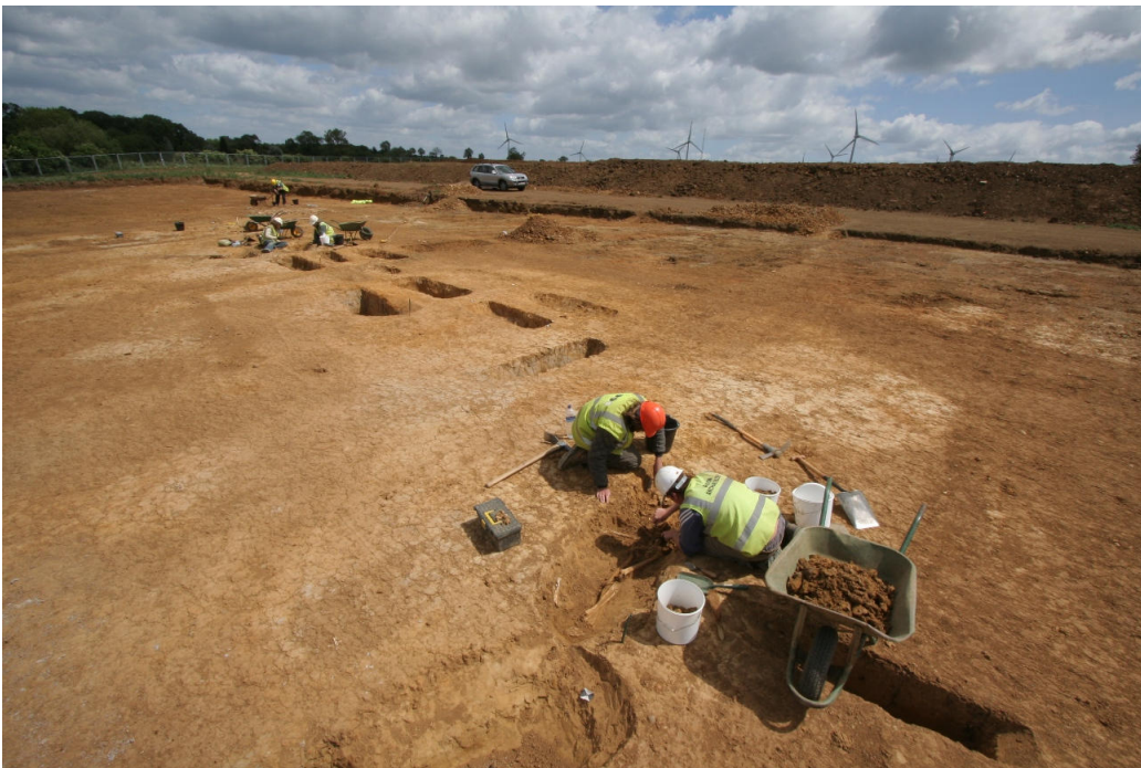
Archaeological investigation of two graves within the cemetery with other fully excavated graves visible (note the Burton Wold wind turbines in the background)

Over the last month Albion Archaeology has undertaken archaeological investigations of a Romano-British cemetery on the outskirts of Burton Latimer. Work has been overseen by CgMs Consulting on behalf of David Wilson Homes (South Midlands) in advance of housing development. The investigations have been undertaken in accordance with a WSI approved by the LPA and a licence for lifting human remains issued by the the Ministry of Justice. This report presents a preliminary summary of results and it should be stressed that it has been written prior to any analysis of the records, human bone or finds which will reveal significant details about the inhabitants, their health, lifestyle and cause of death.