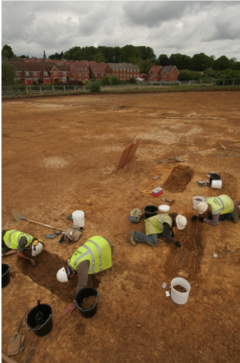
Two graves under investigation

remainder of which seemed to be just open space.