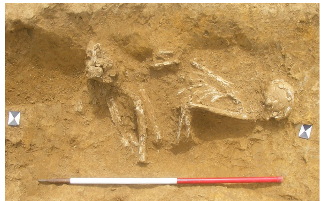
Only one of the burials was in a crouched position

There were, however, single examples of alternative body positions — crouched, body laid on its side and prone (on its front). It is not clear if these different positions had any special significance.