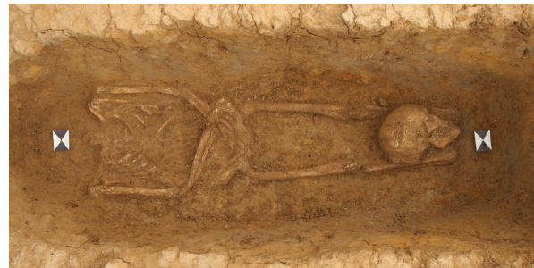
One of the two decapitation burials under investigation

Although fairly rare, such burial practice is known in Roman Britain. Only analysis of the bone will reveal whether beheading was the cause of death - but it is more likely that the heads were removed as a ritual act after death.. The position of the body and the presence of grave goods tend to suggest that these people were not criminals. However, an understanding of the reasons for such occurrences remains elusive. Some heads may have been removed after death to “prevent the dead walking” or as part of religious rites indicating respect for the head as the seat of the soul.