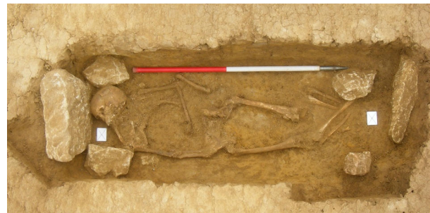
An example of stone lining

Several of the graves produced evidence for coffins or protection of the body by some other means, e.g. a timber cover, supported on stone blocks placed around the head and feet. Evidence for coffins was found in the form of coffin nails, coffin fittings, the position of the body and grave shape.