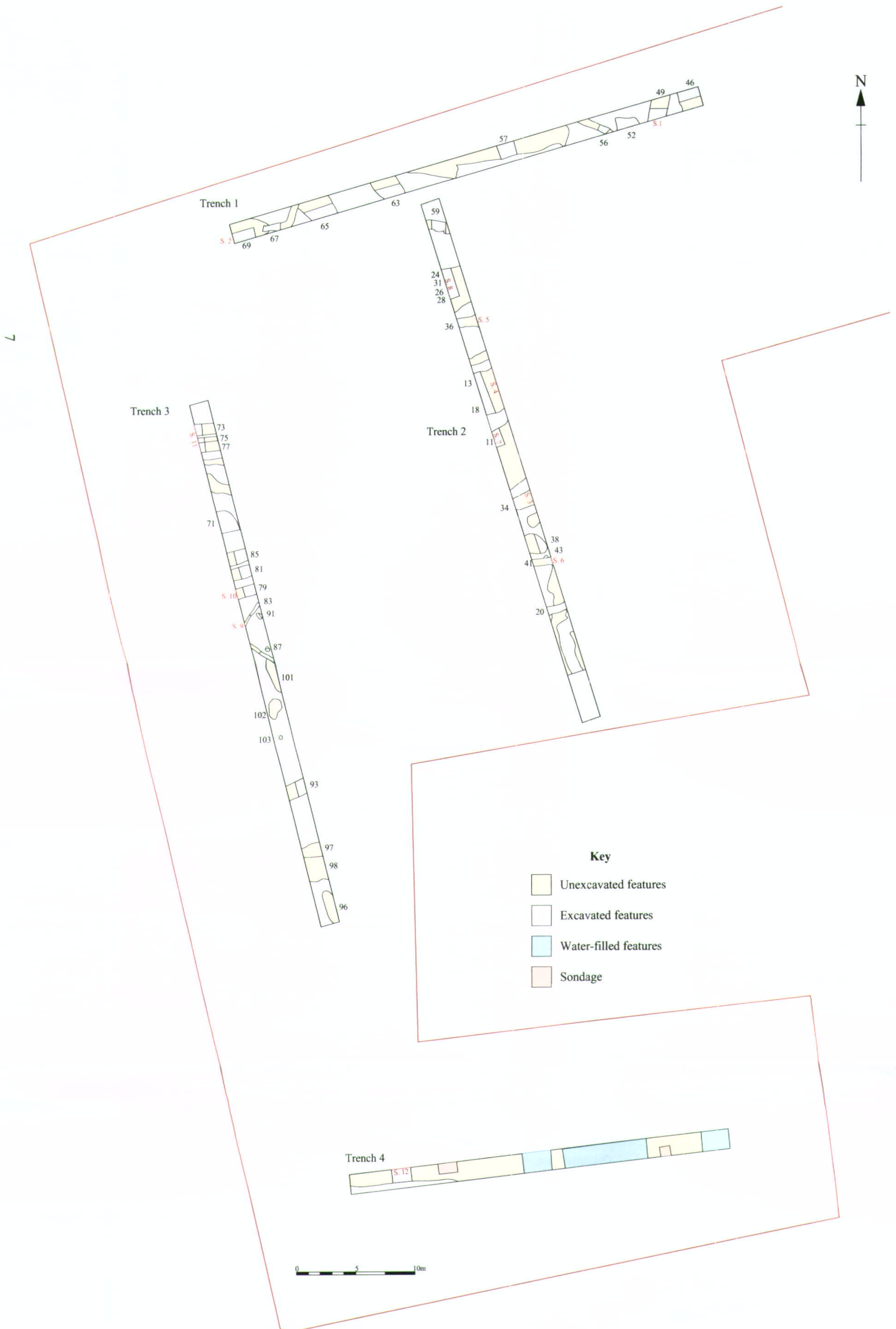
Figure 2 Trench Plans