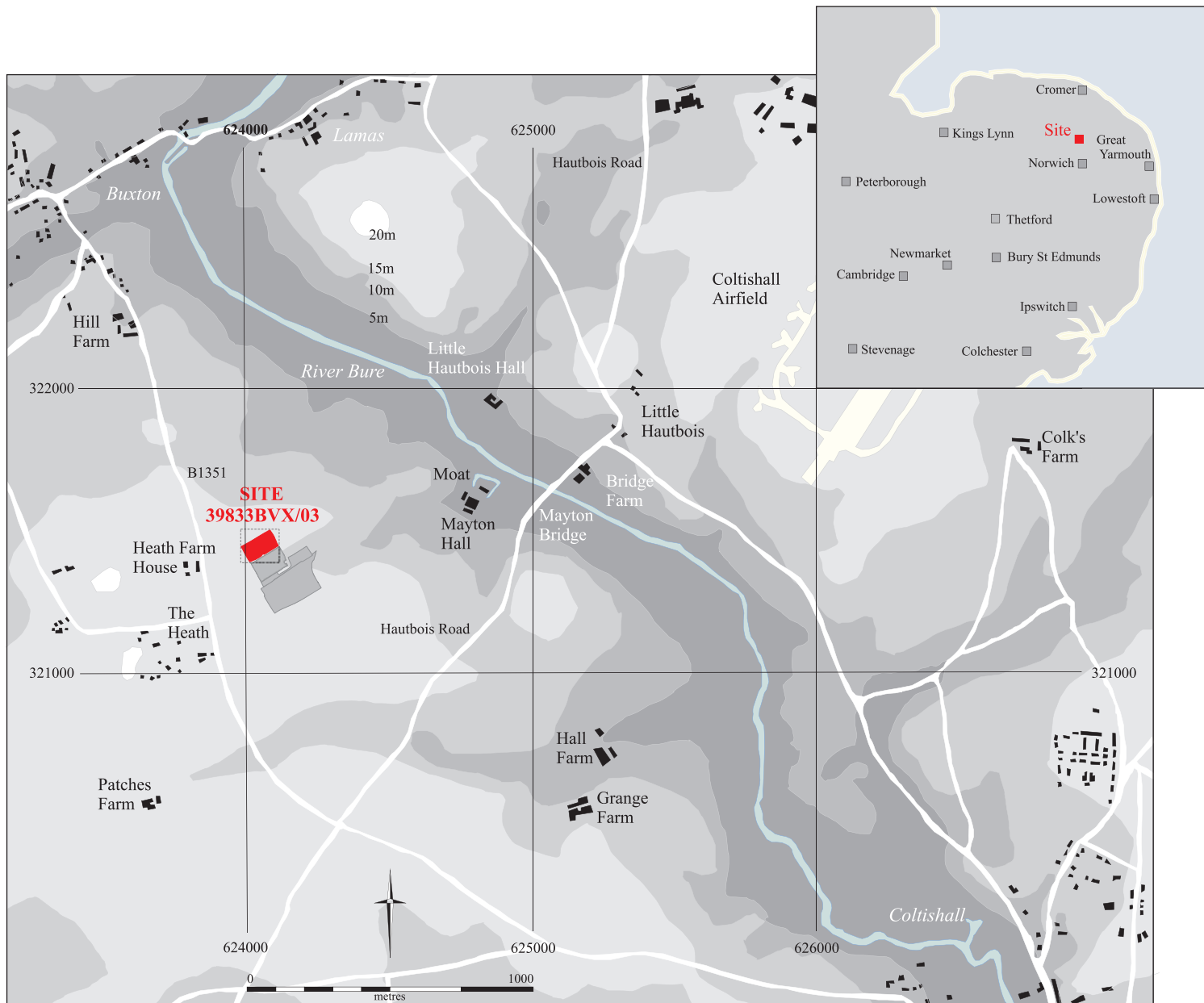
Figure 1. Location map