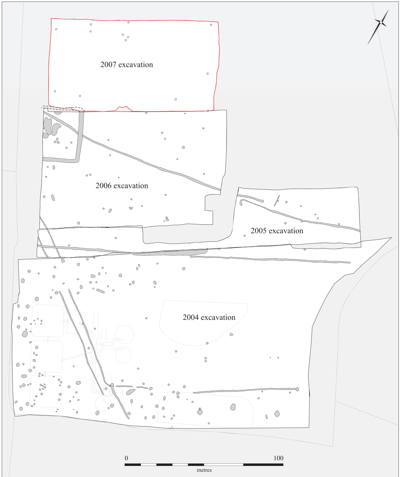
Figure 3. 2004, 2005, 2006 and 2007 excavation phases