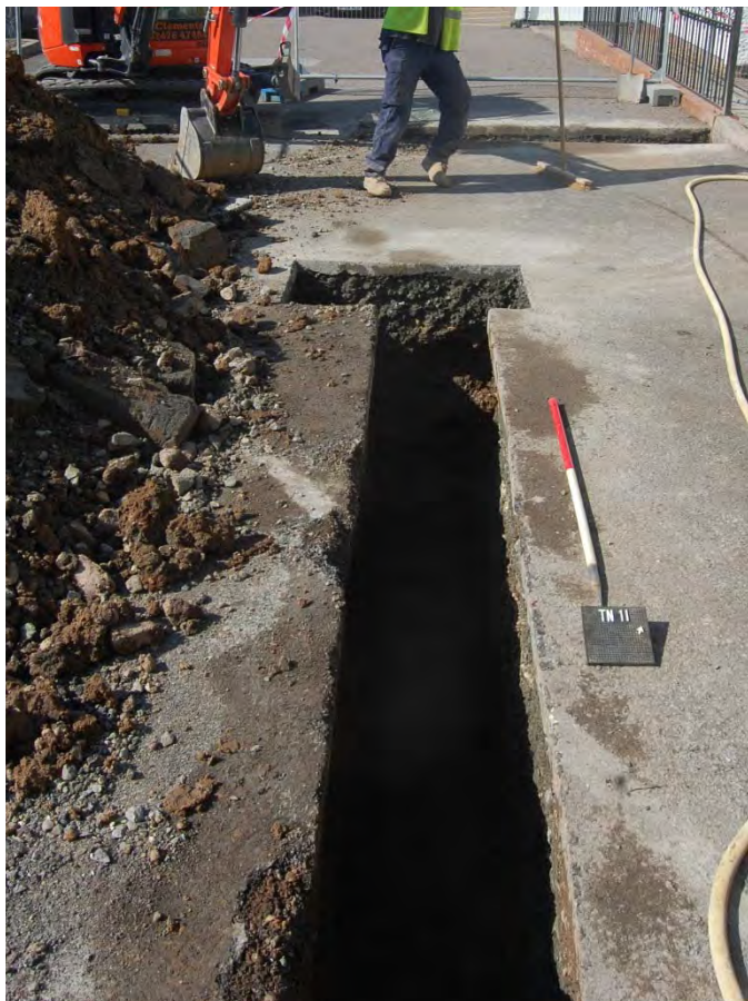
General view of the excavated trenches