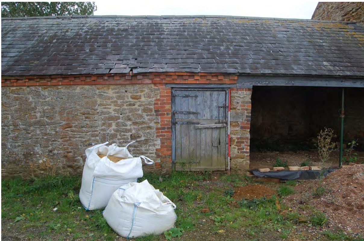
10: Door in north wall of Room 6 showing joints in the stonework