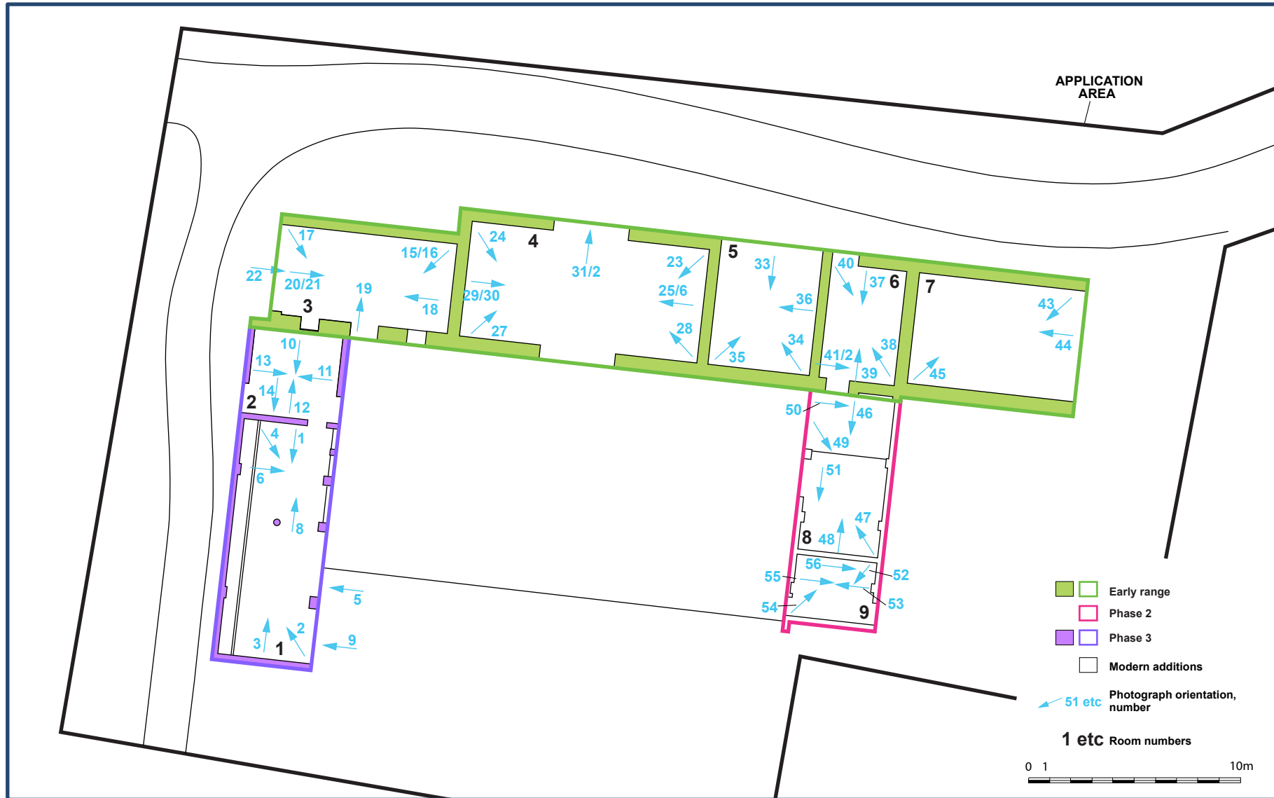
Fig 3: Plan of buildings with phasing, room numbers and location of interior photographs