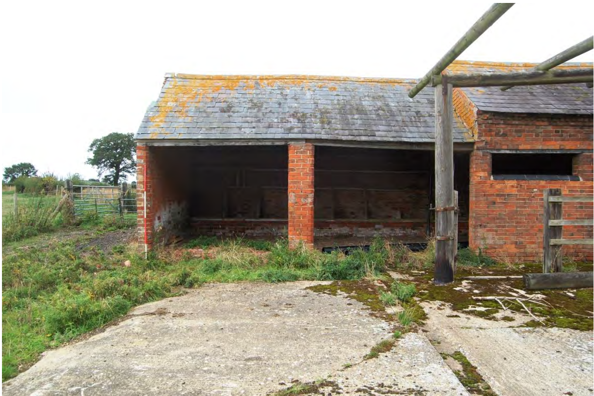
12: View east into western shelter Shed (Room 1) showing the open east side and feed troughs along west wall