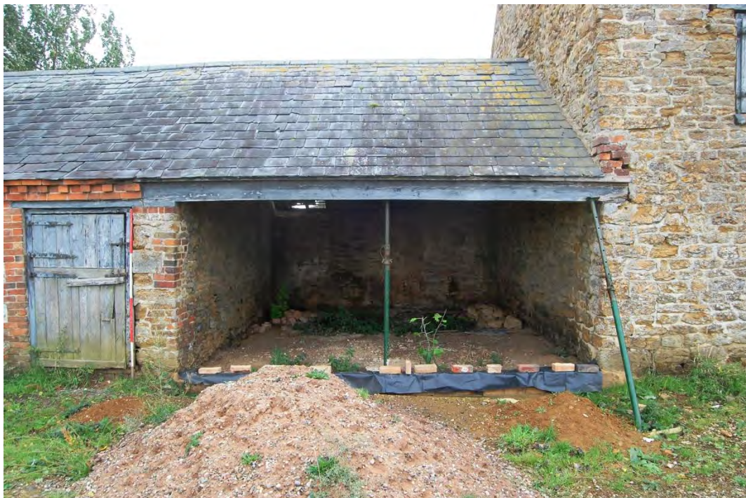
8: View into former cart shed (Room 5)