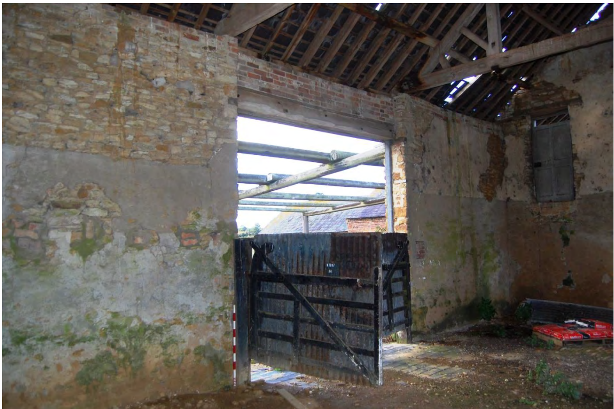
4: South wall of barn (Room 4) showing full height central door onto yard