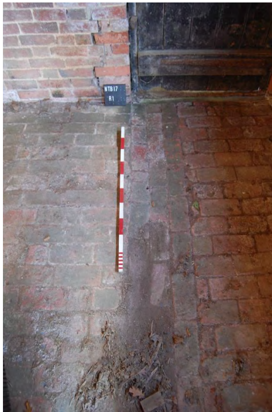
13: Detail of brick floor and drainage channel in Room 1