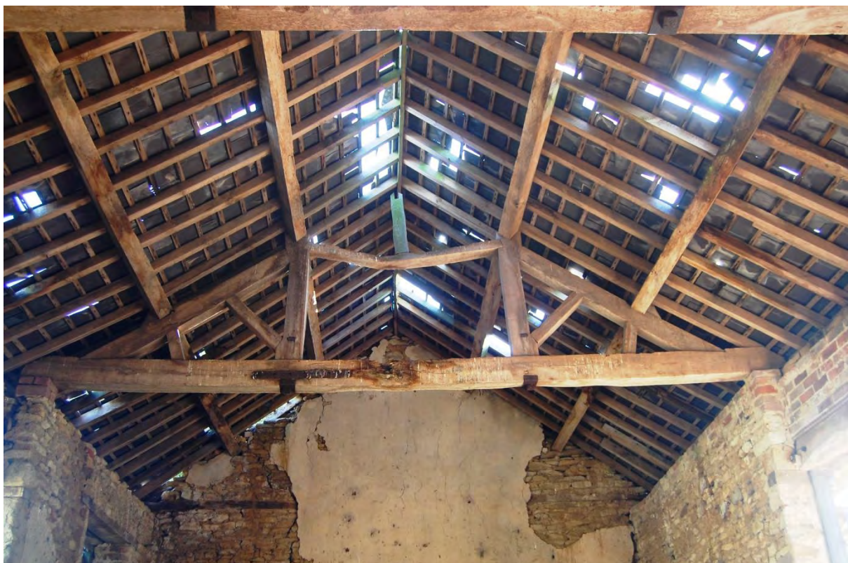
6: The roof structure of the threshing barn (Room 4)