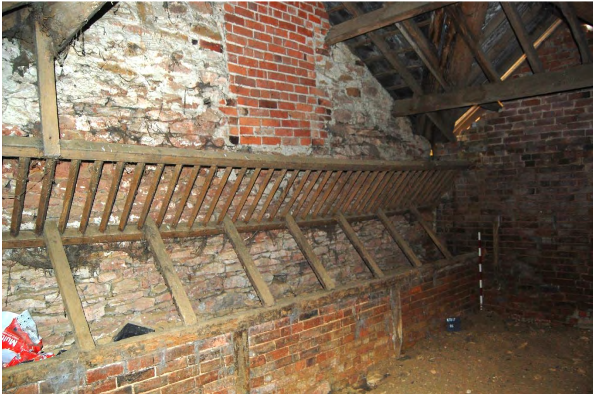
9: East wall of Room 6 showing feeding trough, hay rack and blocked opening