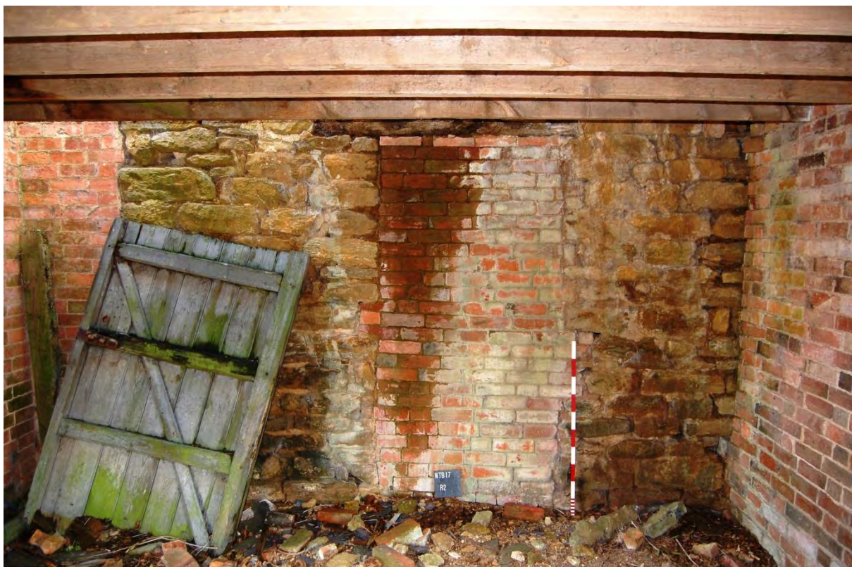
14: North wall of Room 2 and the blocked doorway into the original range