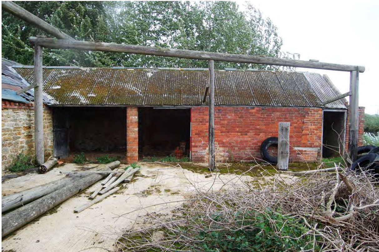
15: Eastern range viewed from the yard (Rooms 8 and 9)