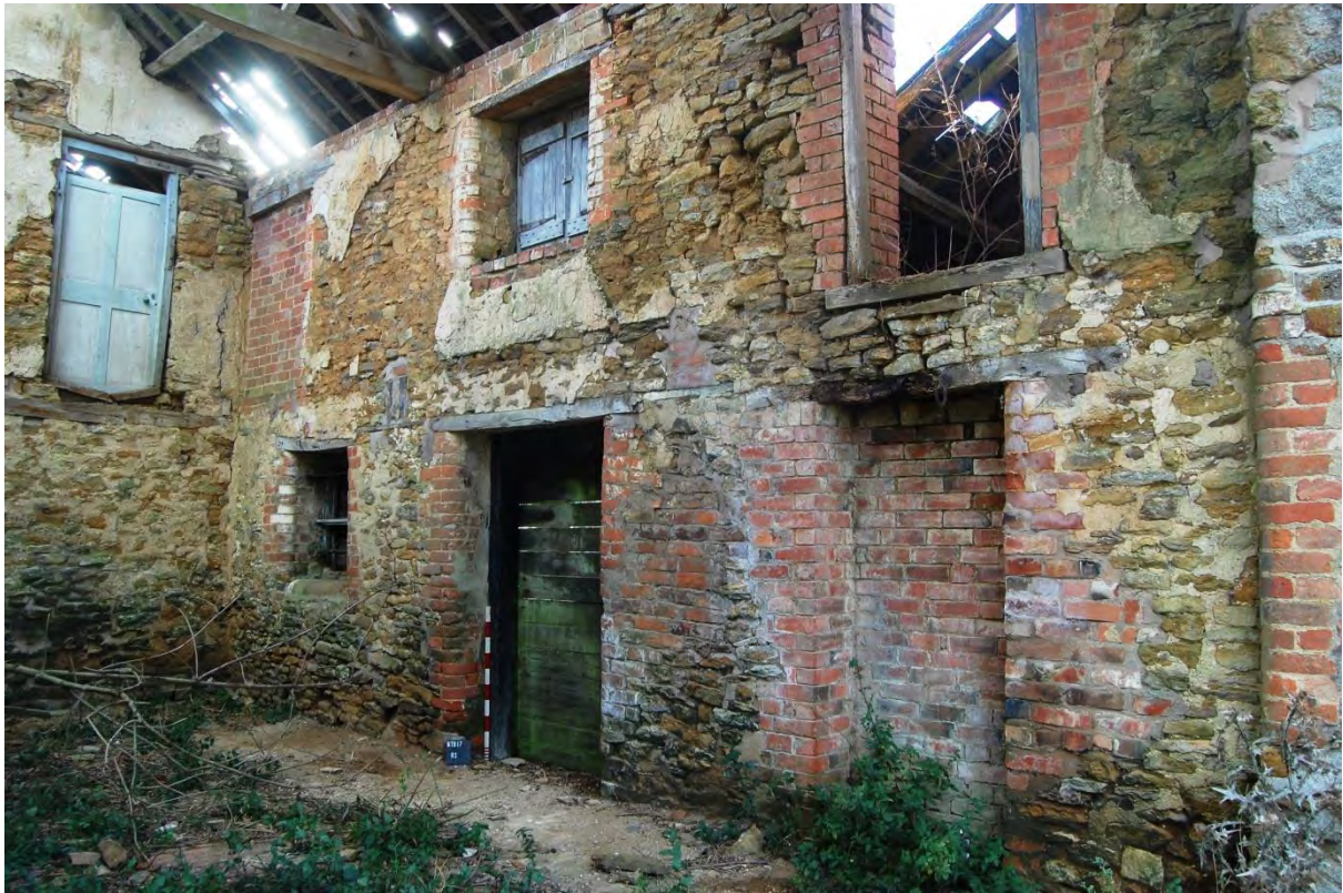
3: South wall of granary (Room 3) looking south-east