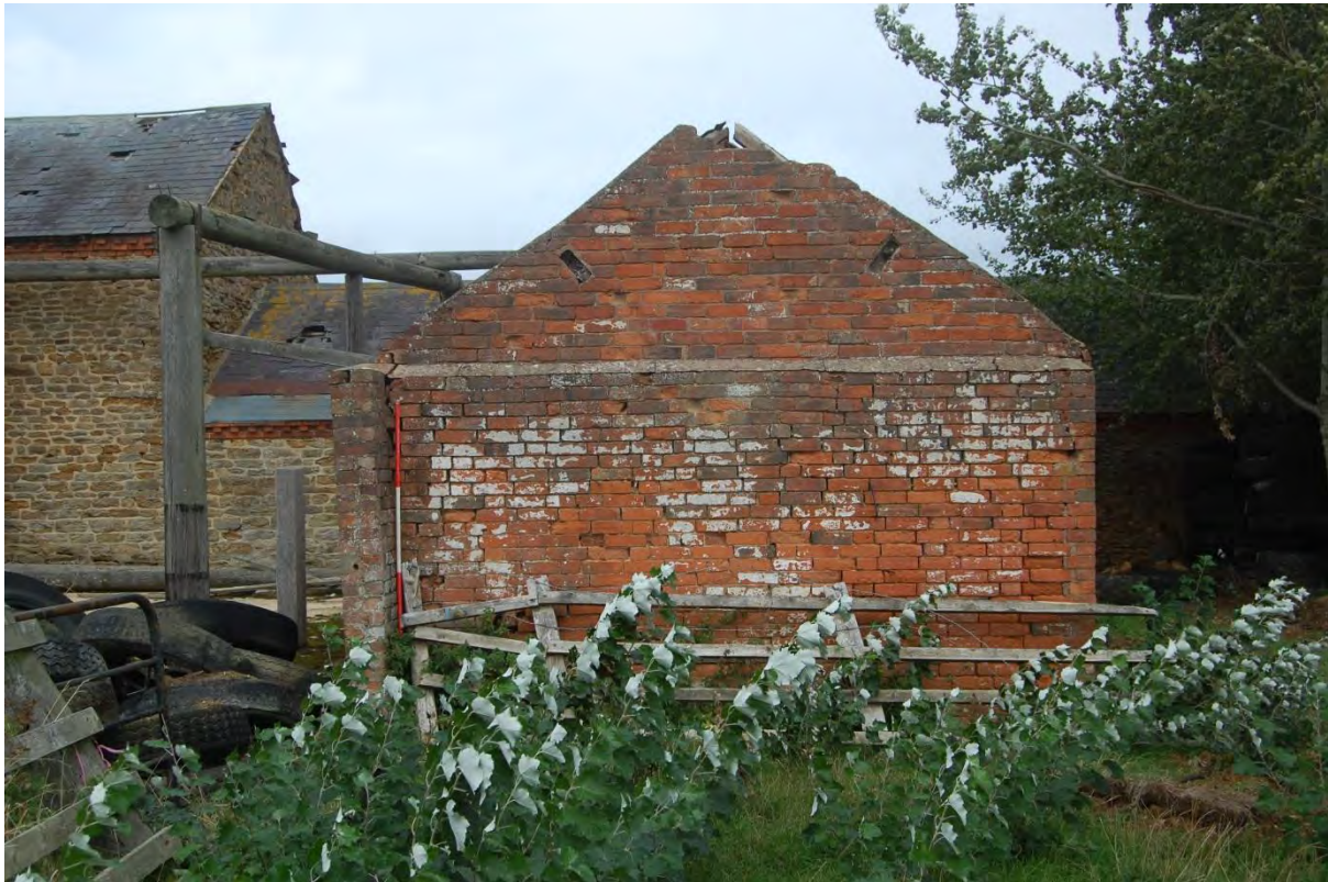
Photo 19: Purlins visible on the south gable wall of eastern range