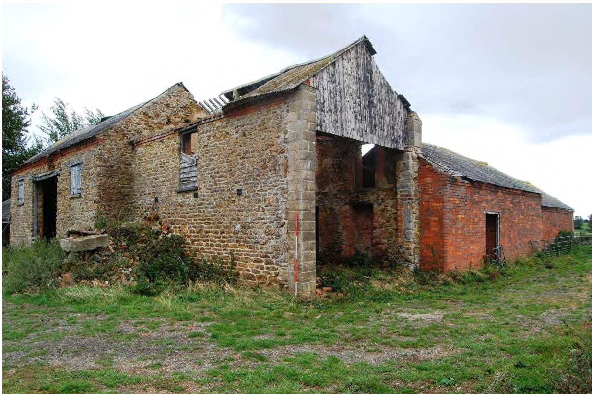
2: Entrance in west wall of granary (Room 3)