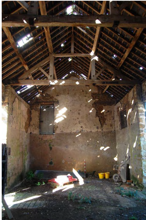
7: West wall in Room 4 showing former upper floor level marked by different paint colours and connecting door to Room 3