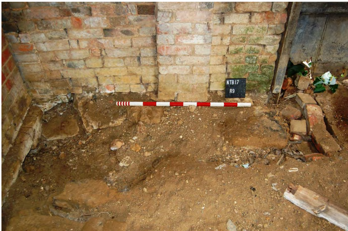
18: Sandstone block foundation below the east wall of Room 9