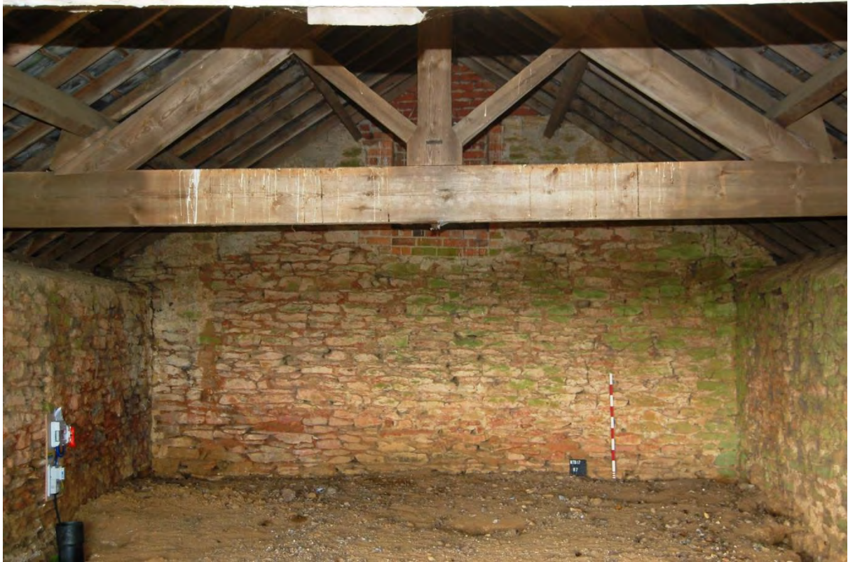
11: View into cart shed (Room 7) from open east end