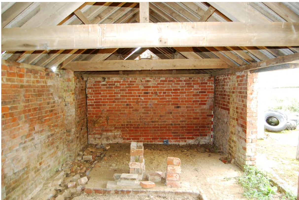
16: South wall of Room 8, a later insertion to create a small store room (Room 9) on the south end of the east range