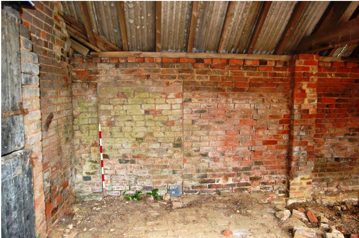
17: Blocked doorway in east wall of Room 8