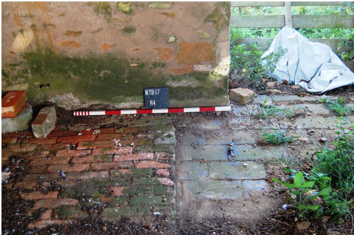
5: Brick floor in barn (Room 4) showing differences in the floor between the central threshing area and side storage areas