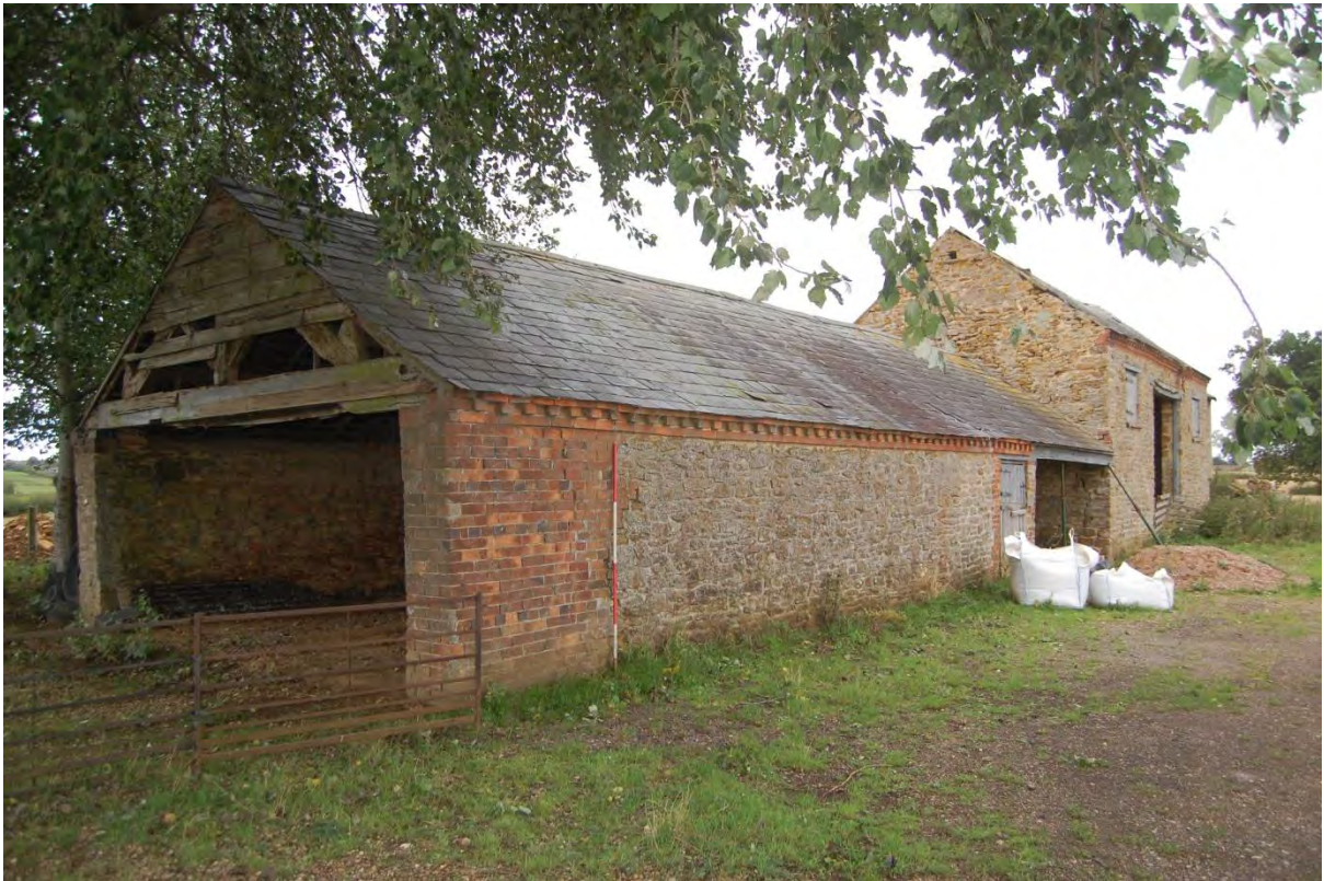
1: View south-west along the north side of the early range