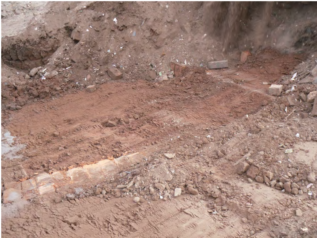
2. General view of stripping in progress