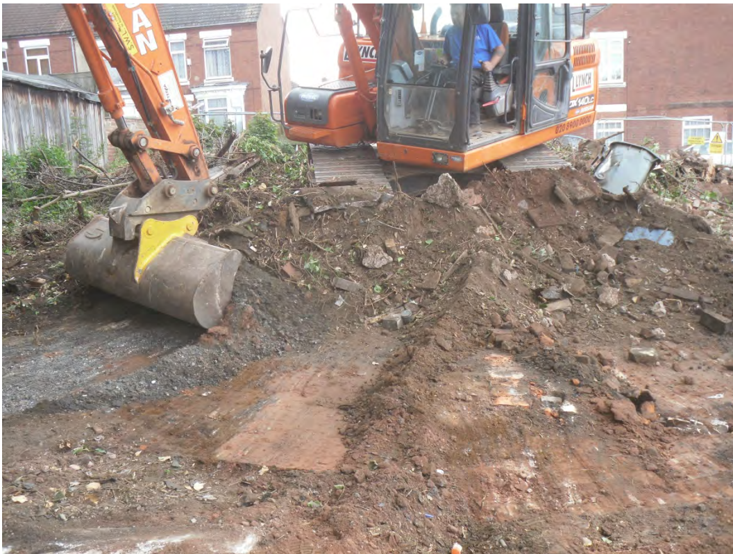
4. General view of stripping in progress