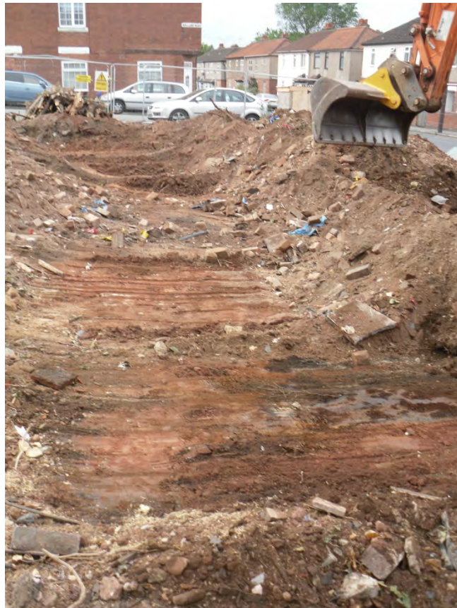
3. General view of stripping in progress