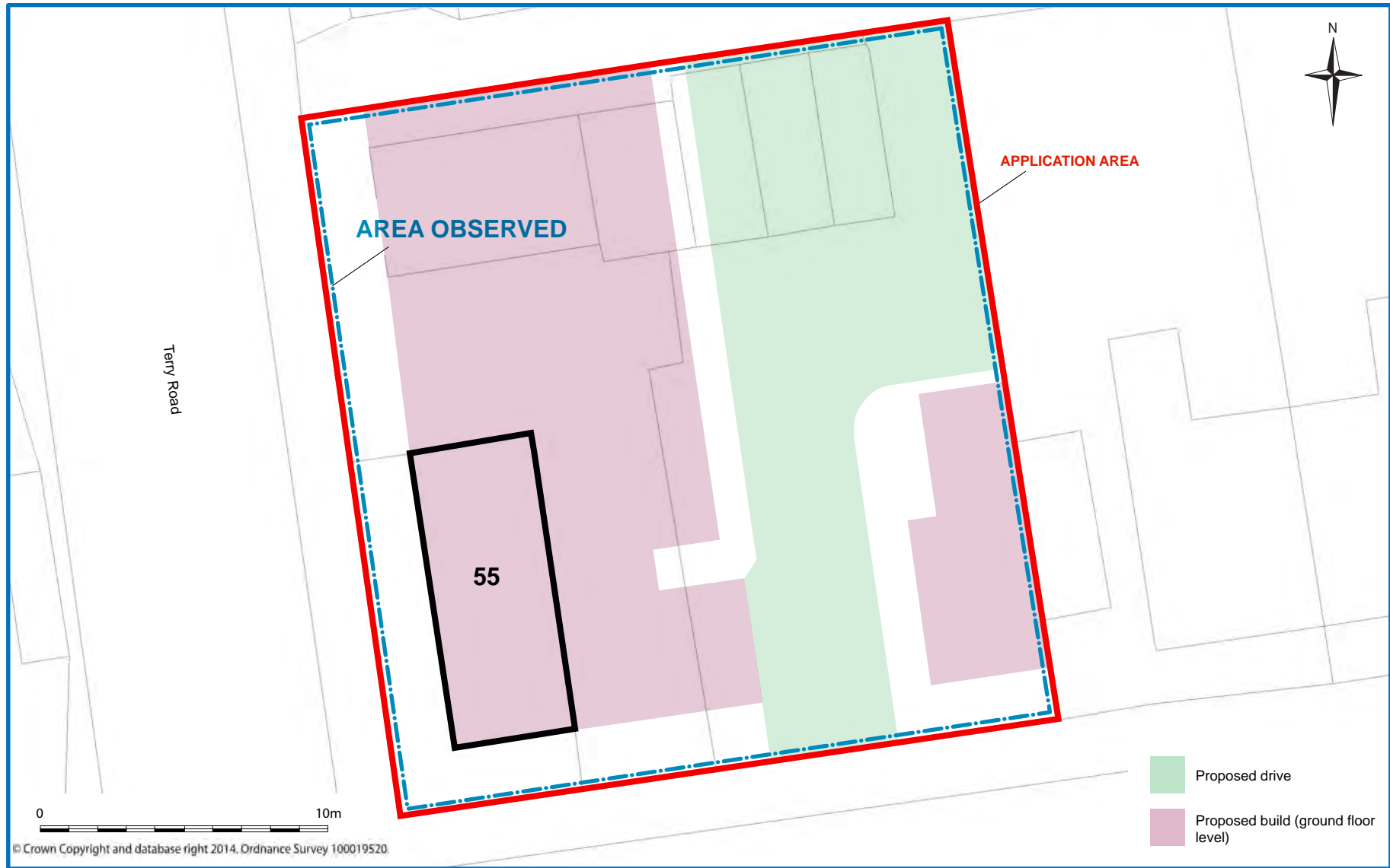
Fig 3: Area observed