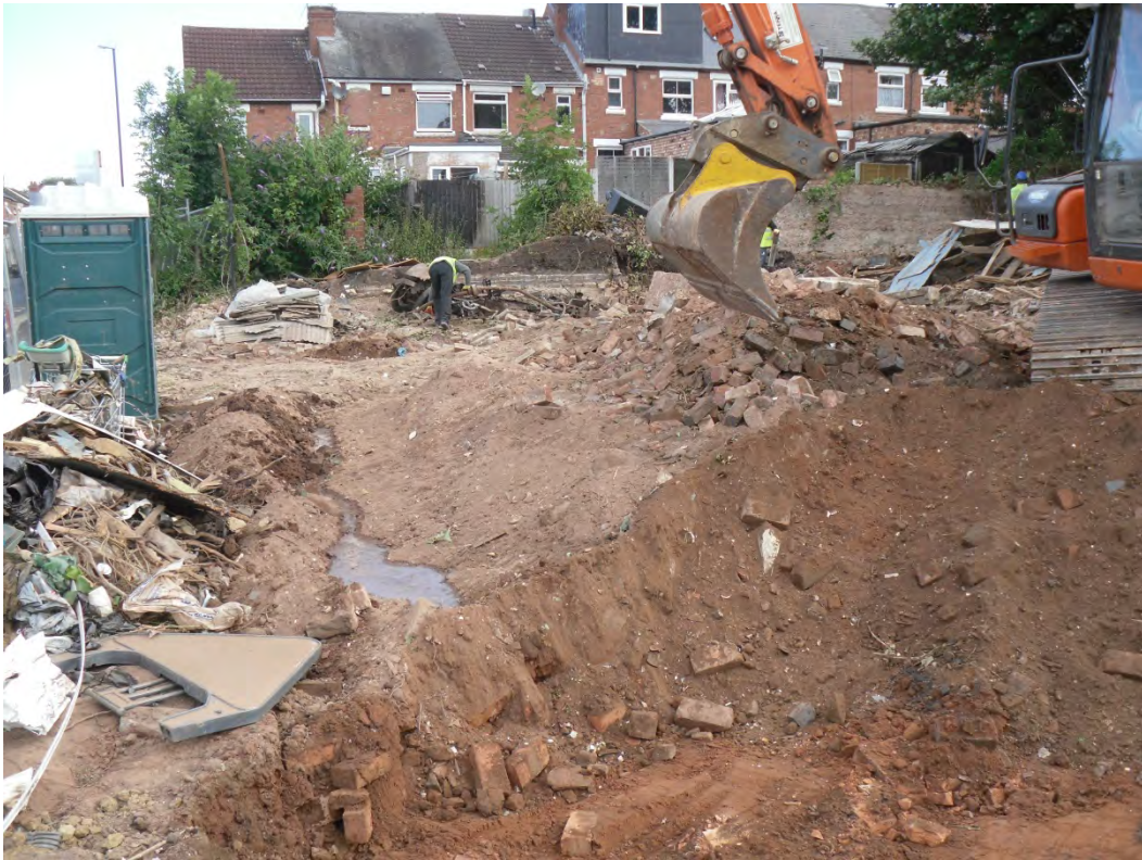
1. General view of stripping in progress