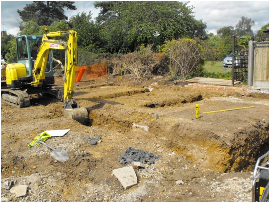
Fig 4: General view of site looking north