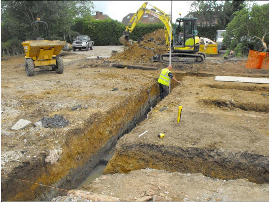
Fig 3: View of site looking north-west, showing typical foundation trench with layers of geological natural