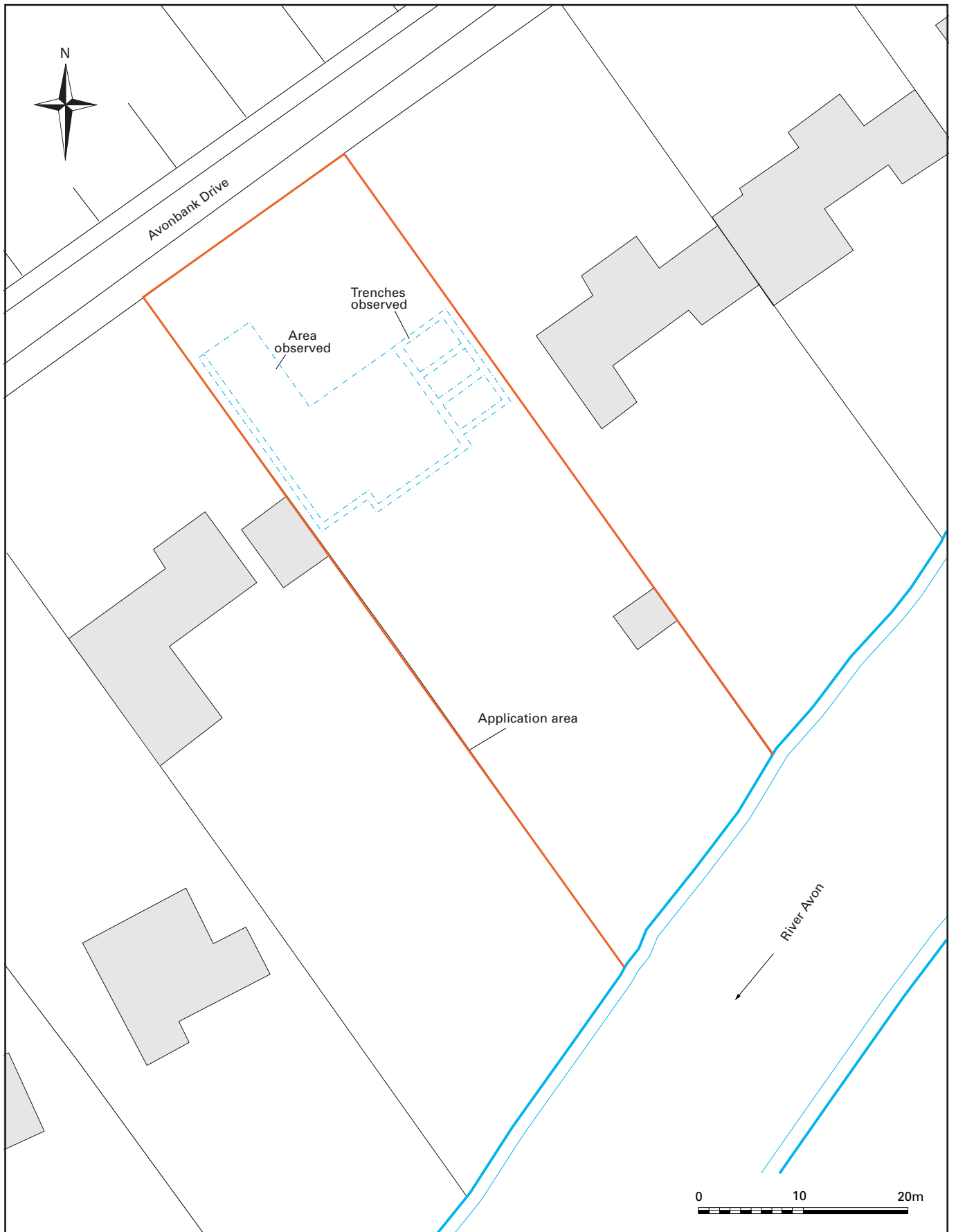
Fig 2: Area and trenches observed