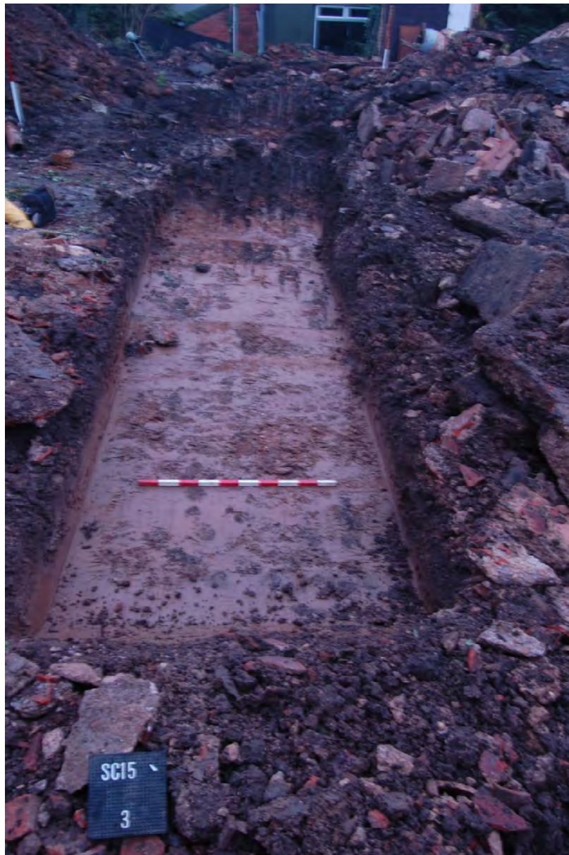
3. Trench 3