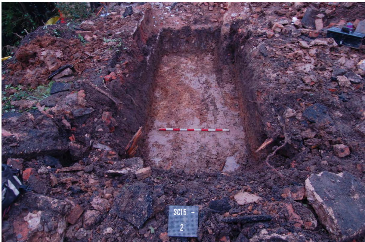
2. Trench 2