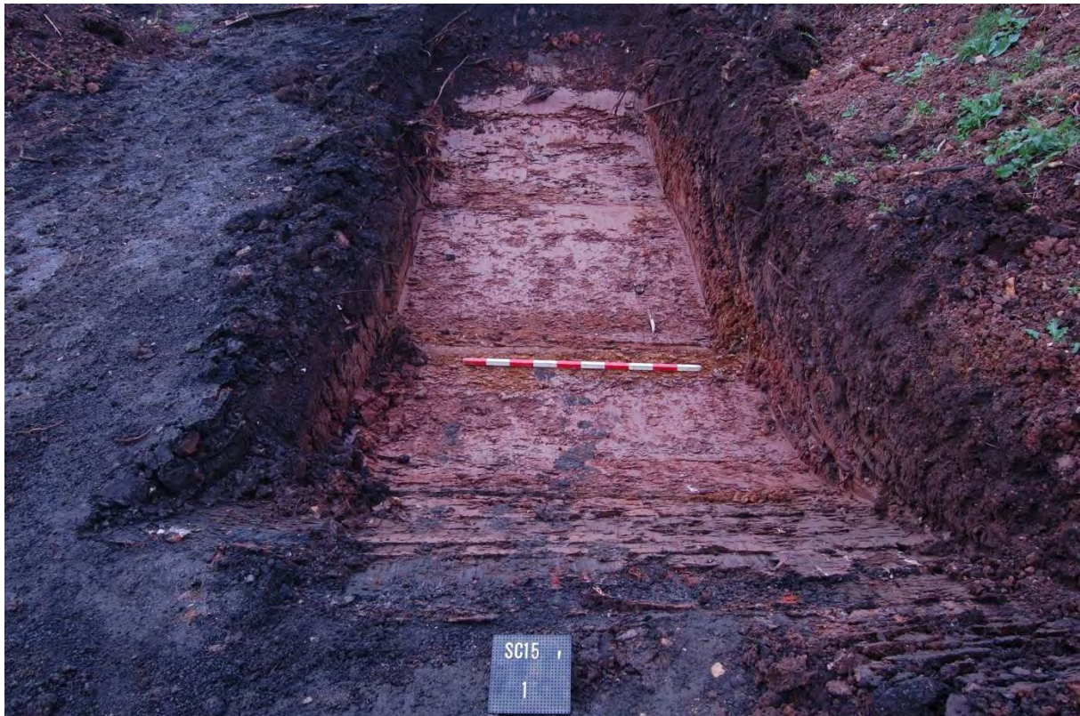
1. Trench 1