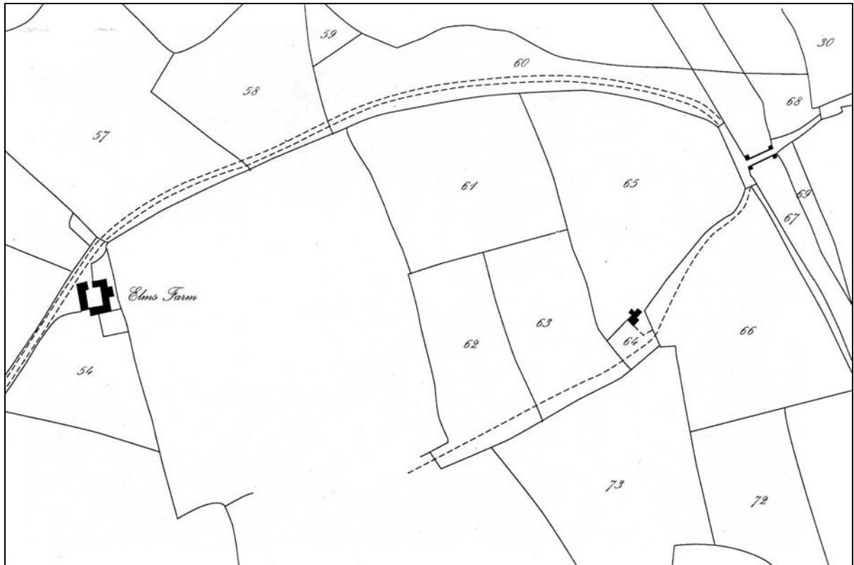
Fig. 2: Tracing after Glenfield Tithe Map, 1853 (LRO Ti/118/1)