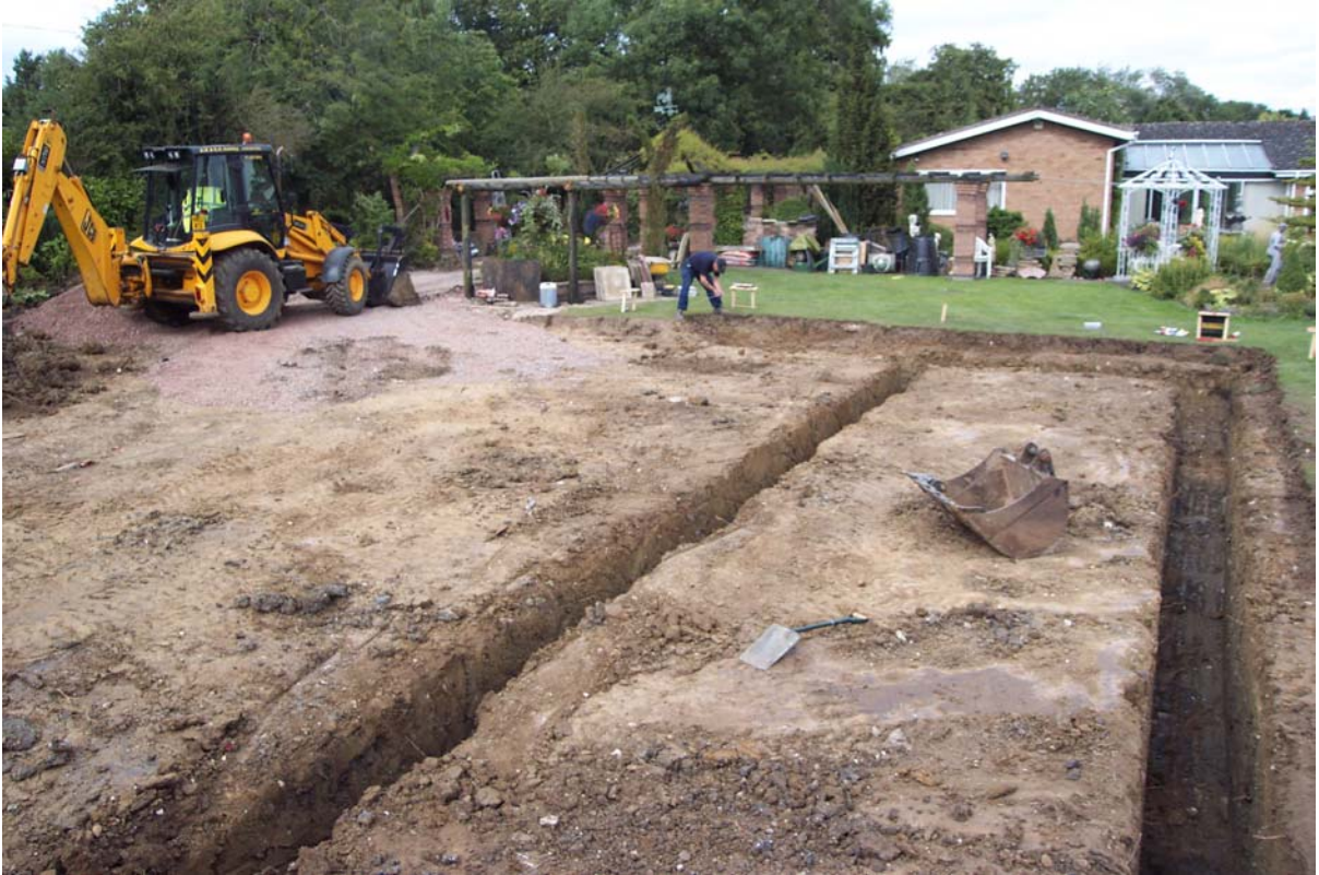
Fig. 4: Foundation trenches, facing north-east