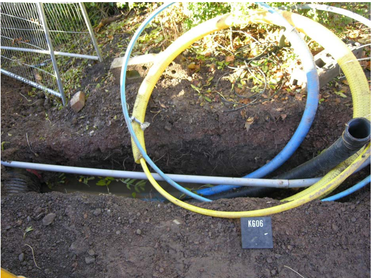
Fig. 5: Service trench, facing north-west