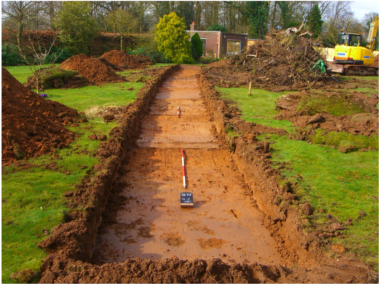
2: Trench 2 Looking west