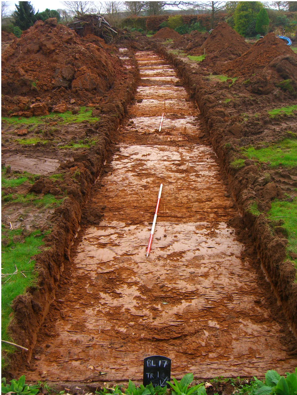
1: Trench 1 looking SE