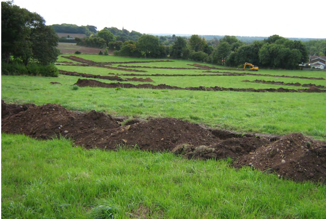
1: General view south-east showing the steep slope across the site.