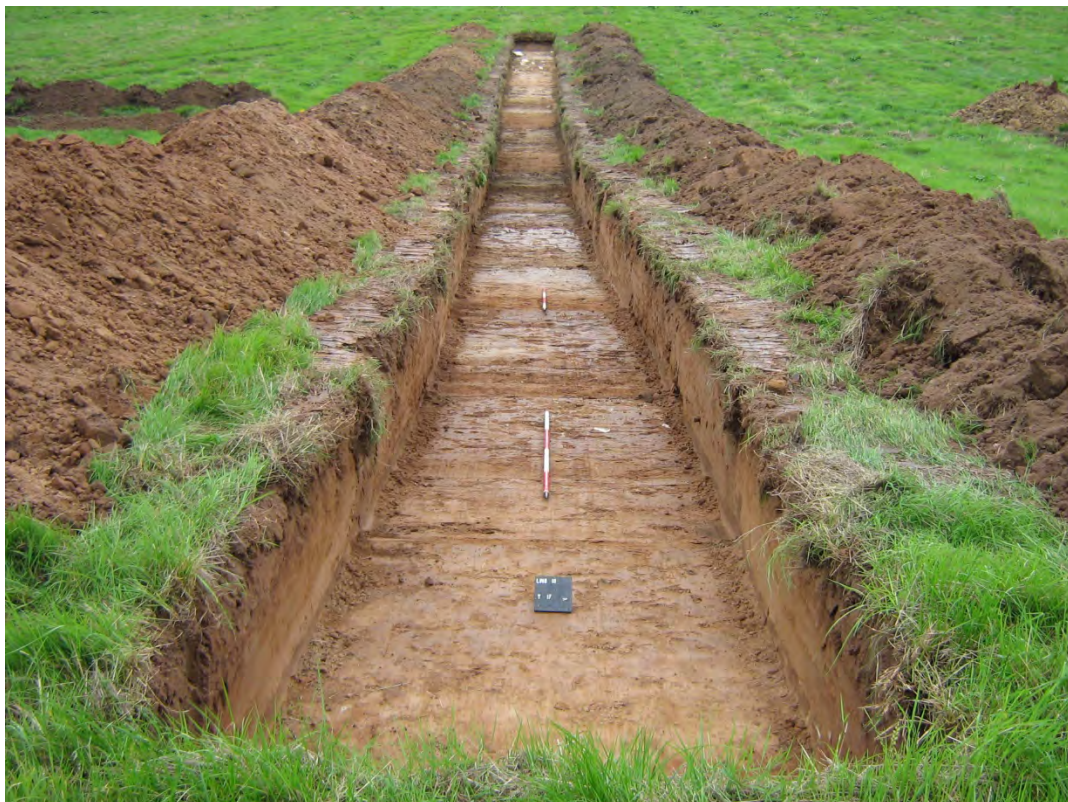
4: View west of Trench 17 showing the hollow that extended into Trench 18.