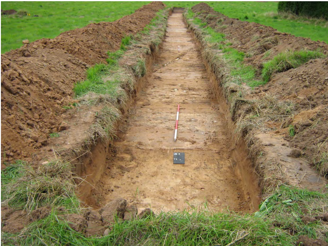
3: View west along Trench 6 showing the clay natural and a land drain