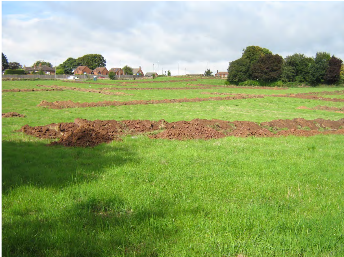
2: General view north-west across the site showing the slope up towards the north-west corner of the site.