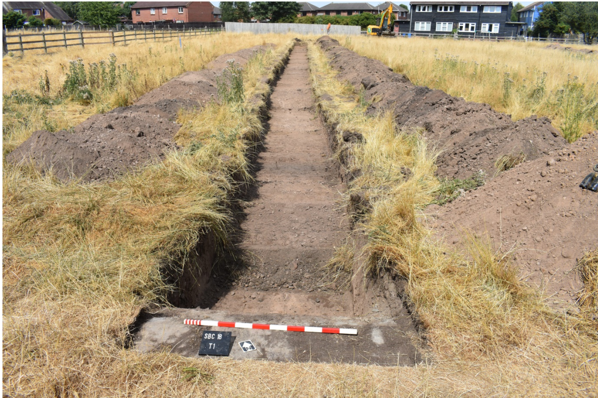
1: Trench 1, looking north, with pit 103 in foreground