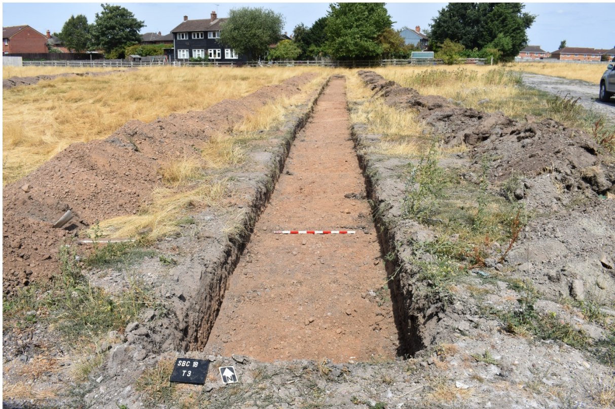
4: Trench 3 looking north