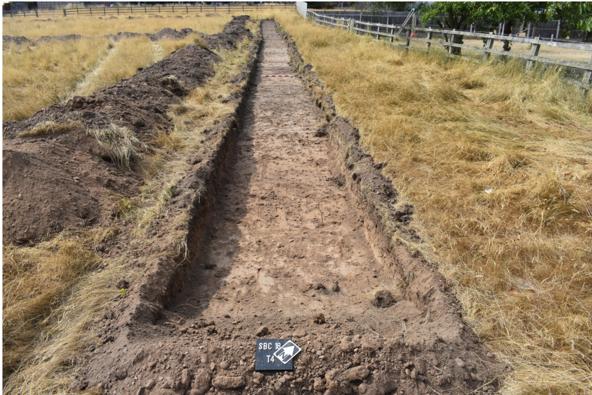
5: Trench 4, looking west