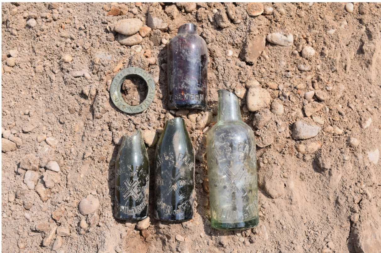
2: Beer bottles and barrel plug from pit 103