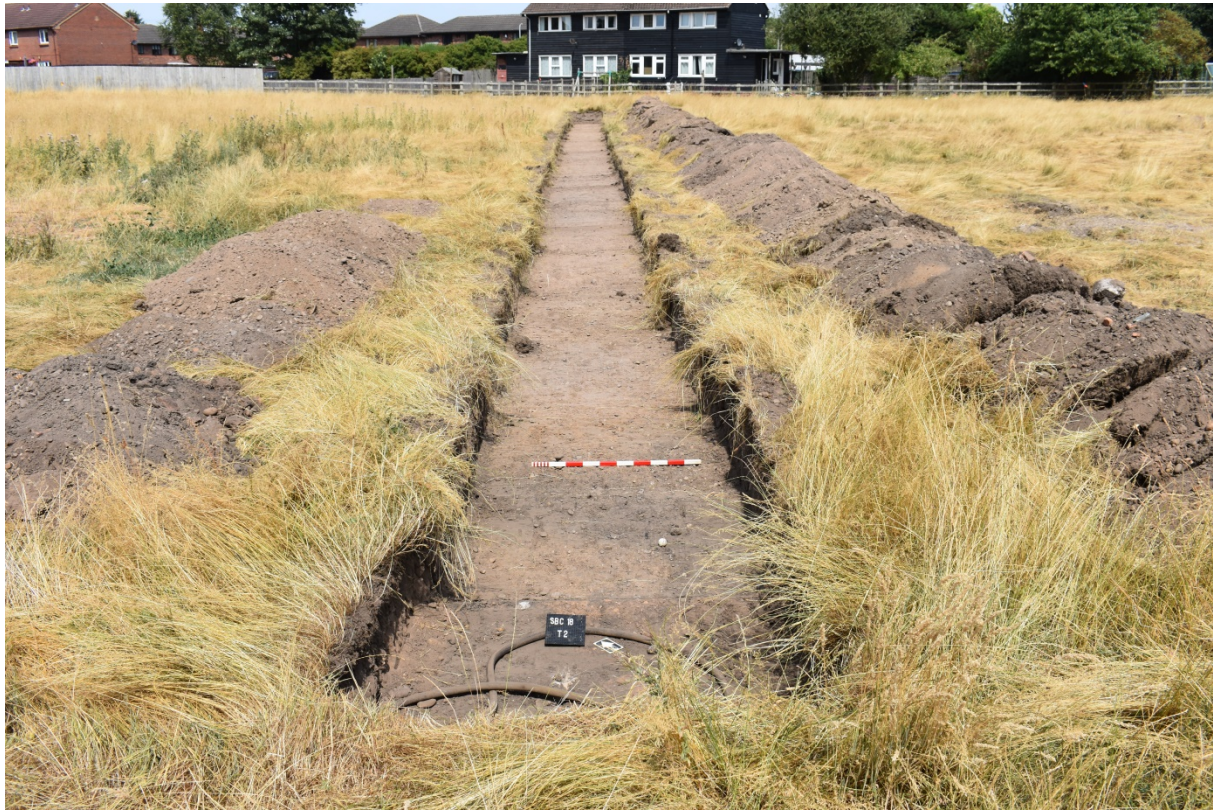
3: Trench 2, looking north, with pit 203 in foreground