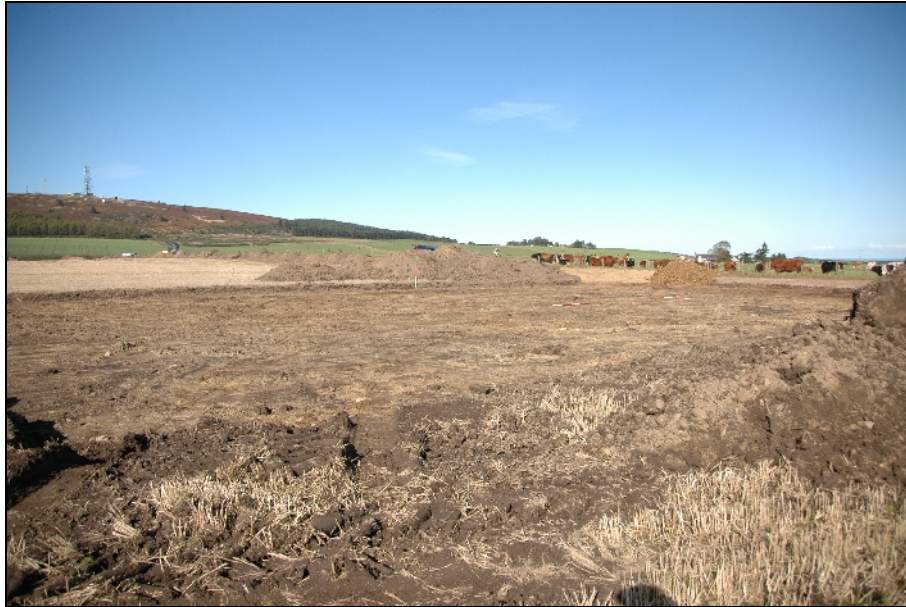
Illus. 2: View, looking NW, at area of hard standing