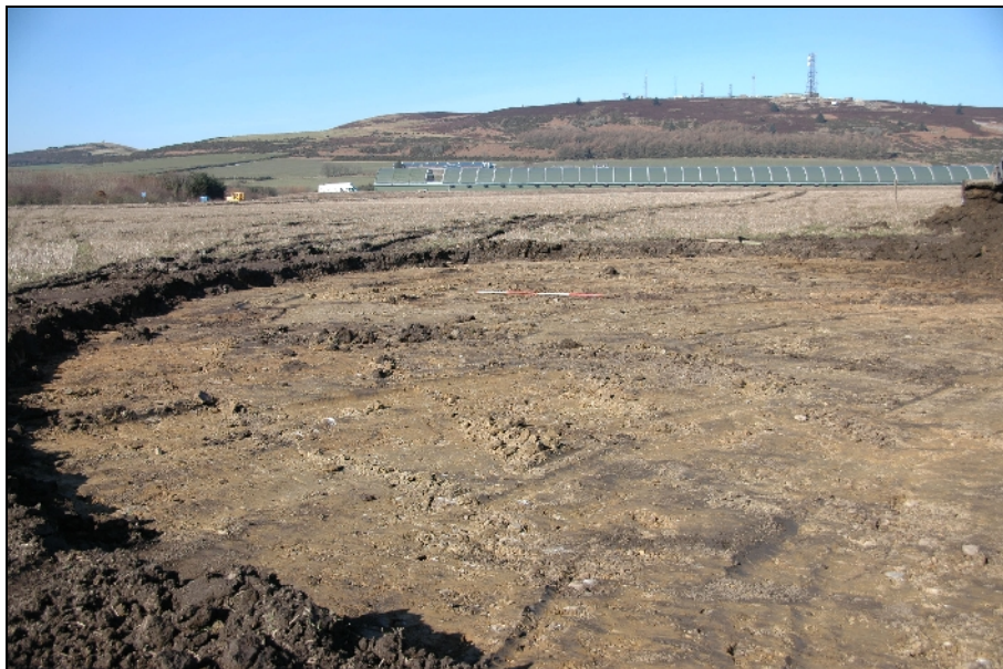
Illus. 3: Soil strip over area of wind turbine, looking NW