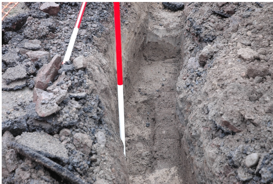
Illus 3 F2, looking S

F2 GPS 394234,807971. A cut c 600-800mm wide and up to 400mm deep ran NNE/SSW across the trench and was cut into the natural sand. The fill was the same as the garden earth extending between F2 and F1. Although this feature appears to be near the position of the Fidler's Well it is difficult to interpret it as relating to it.