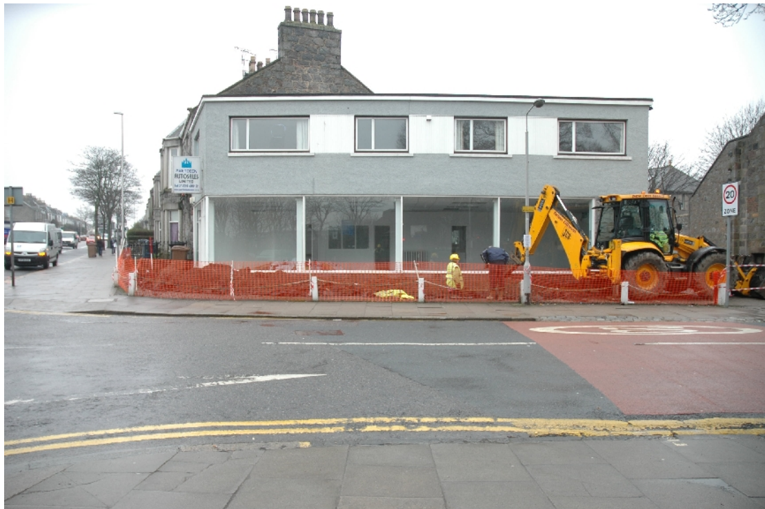
Illus 1 General view of site looking S

3.2 Part of the site ( shown grey on illus 2) could not be trenched because of live services, a small area at the back of the King Street frontage was also not trenched because of the difficulty of breaking 150mm thick concrete without damaging the walls of the site.