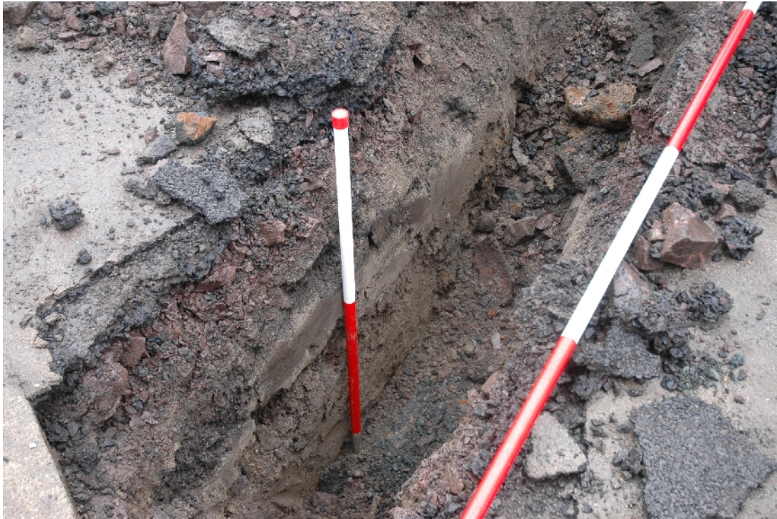
Illus 5 Trench 2 section