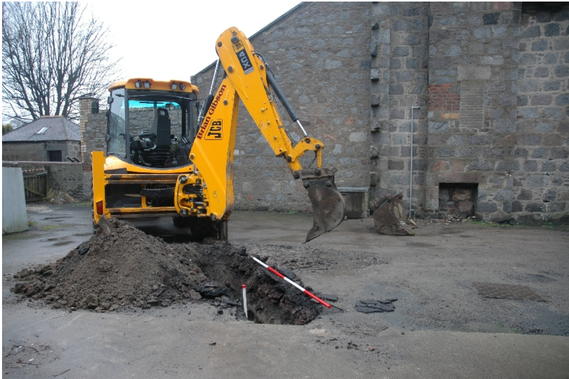
Illus 4 Location of trench 2 in relation to scar of bombed building visible on house behind

The trench lay just outside the footprint of the bombed house on University Road and may have been related to bombing debris. Three bombs fell on King Street, one on this site, one by the Esso garage and a third - which did not explode – near the present site of Lidl's. The unexploded bomb was taken to Black Dog and destroyed by controlled explosion; it comprised granulated rubber, phosphorus and petroleum jelly (pers comm Stuart McRae).