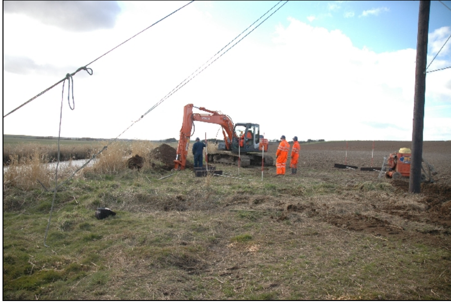
Illus. 4: Position of stay holes to S of pole 67