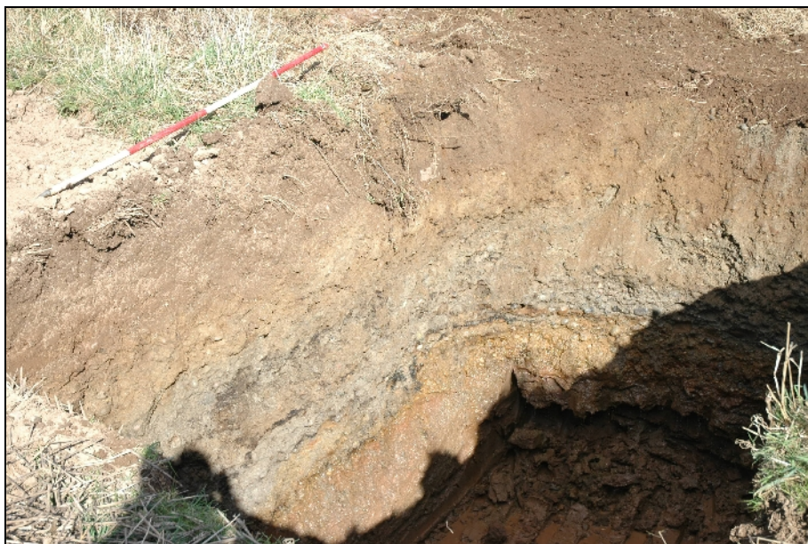
Illus. 3: S facing section of pole trench