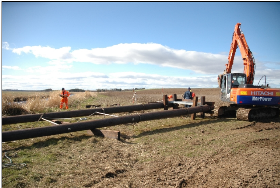
Illus. 2: Position of Pole 67, looking W