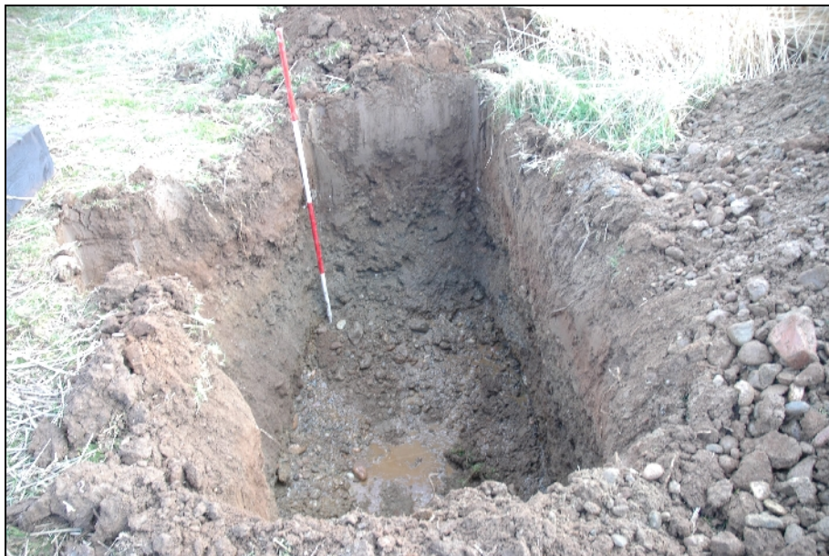
Illus. 5: Trench for stay, looking W