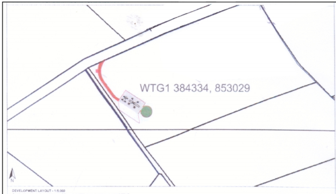
Illus. 2: Detail of site layout.