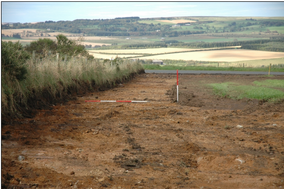
Illus. 3: Access track, looking N.