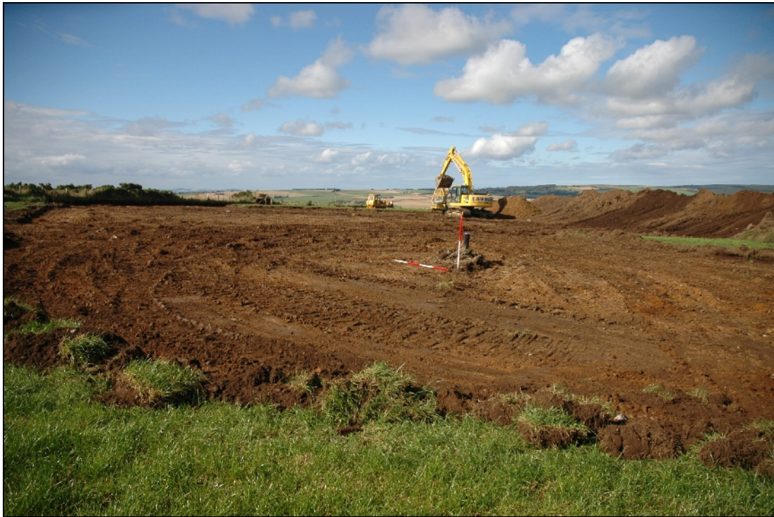
Illus. 4: Area of Turbine base, looking N