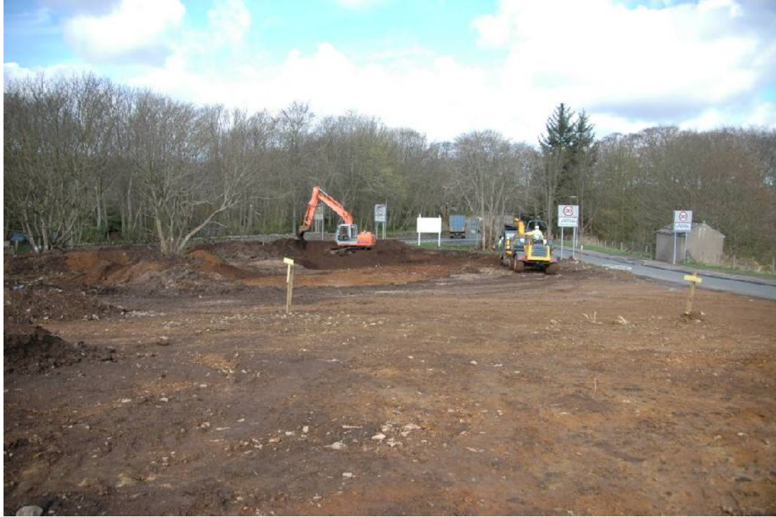
Illus 4 NW area of site soil stripped.

Services Ltd, must be informed immediately so that an appropriate archaeological response can be formulated and agreed by all parties concerned.