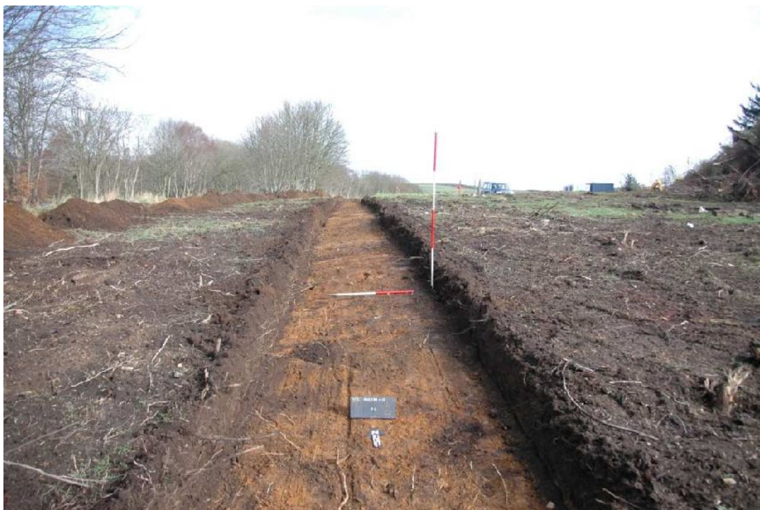
Illus 3 Trench 2 looking N. showing root marks in natural