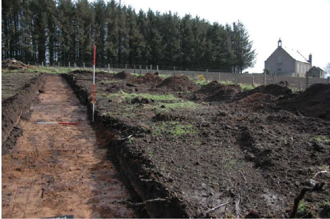
Illus 2 Trench 1 looking E with 1799 church in background