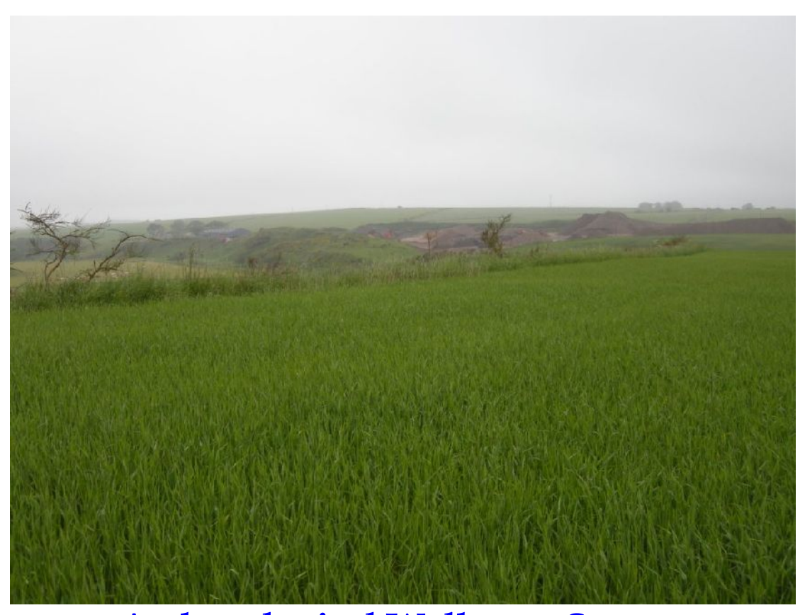
- Archaeological Walkover Survey -Carried out 28th June 2012 by Murray Archaeological Services Ltd