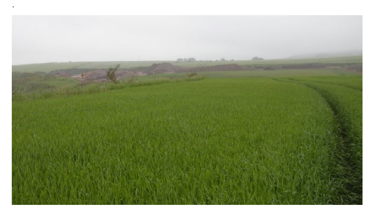
Illus 1 Looking W across field 2 to the existing quarry