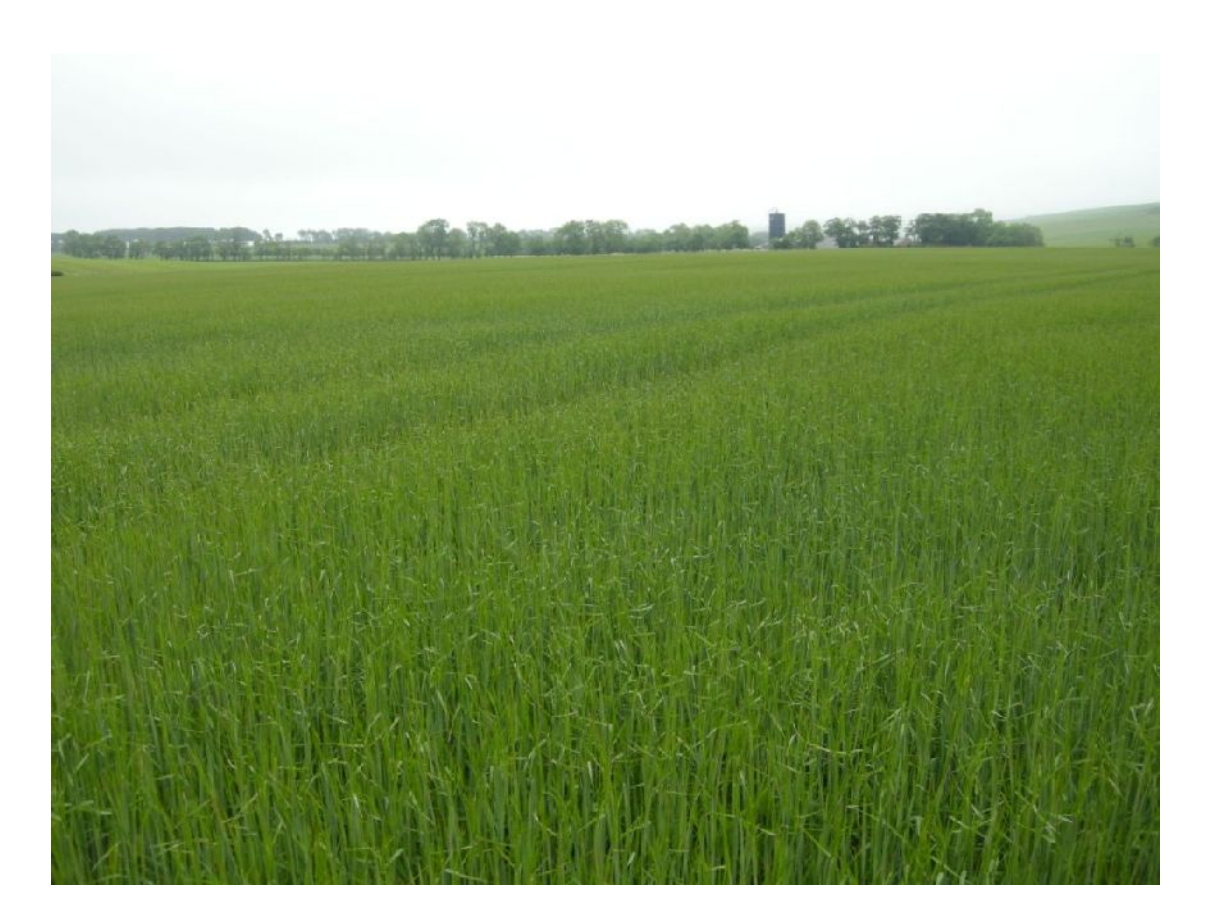
Illus 3 Looking E across field 1 towards Mill of Balmaud

4.1 As the three fields were in crop at the time of the walkover survey, it was agreed with the landowner that the archaeologist should walk through the fields along the lines of the agricultural tram lines. This allowed a systematic survey of both the field margins and the centre.