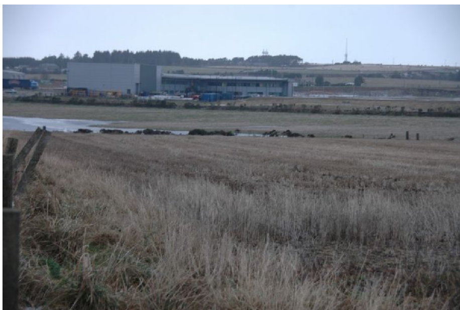
Illus 2 Looking W across the site towards Moss-side where traces of Early Neolithic activity were excavated in 2008.

The only artefacts visible in the exposed soil were sherds of 19 th /20 th century china and glass derived from midden manuring.