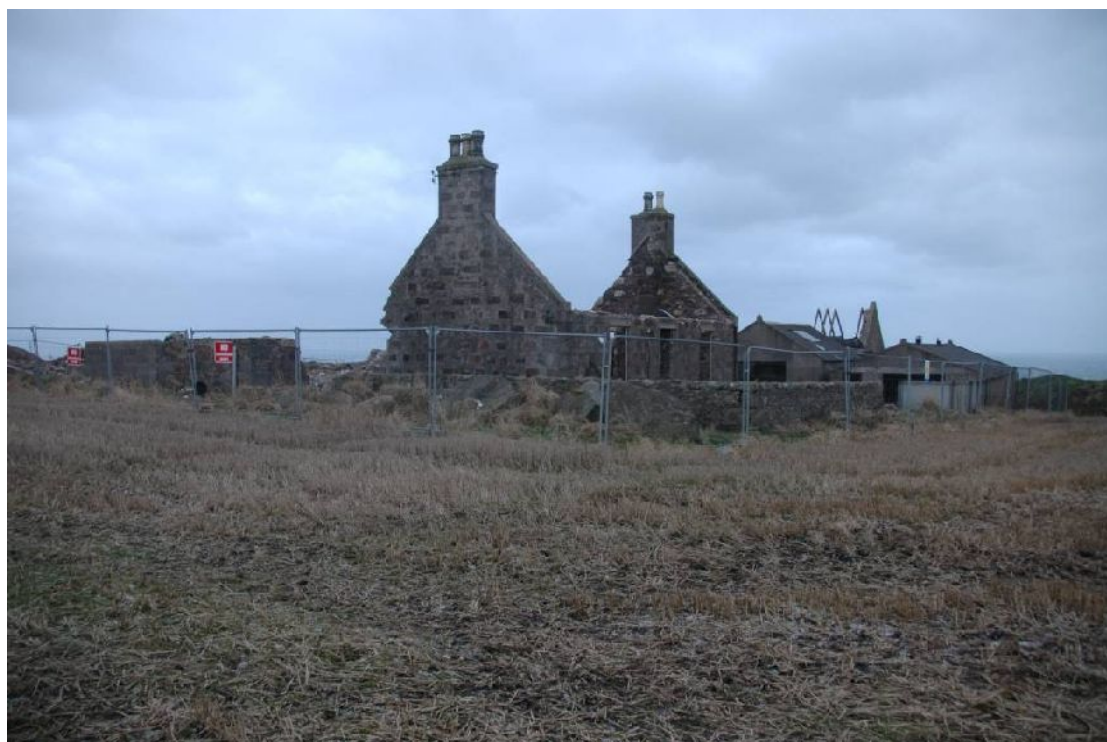
Illus 3 South Blackhill farmhouse