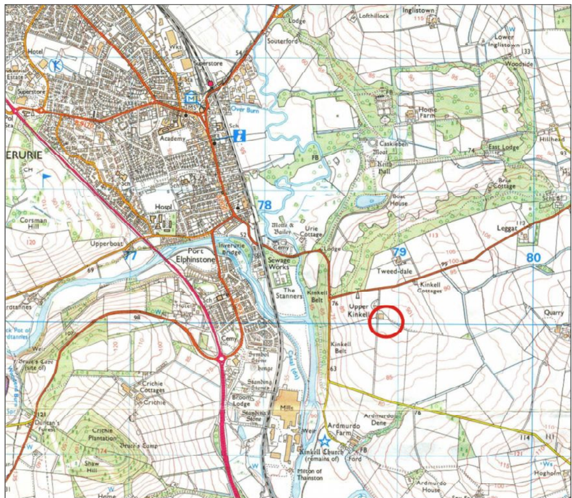
Illus 1: Location Map with site in red circle.