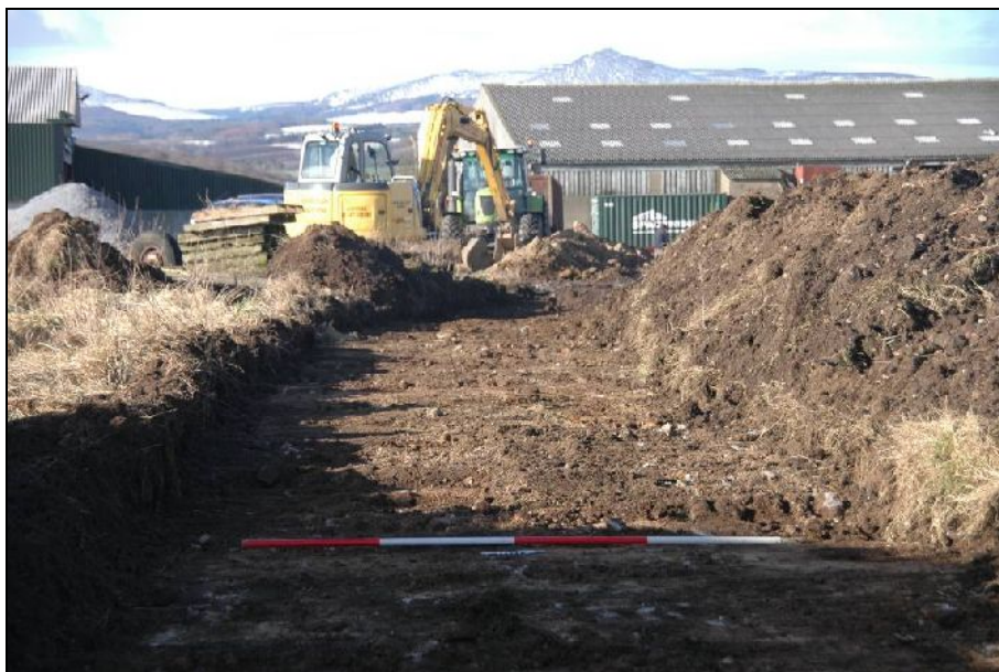
Illus 4: W end of cable track