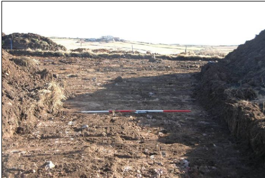
Illus 3: E end of cable track and area of turbine base, looking E

3.5 No archaeological features or finds were evident during the soil strip.