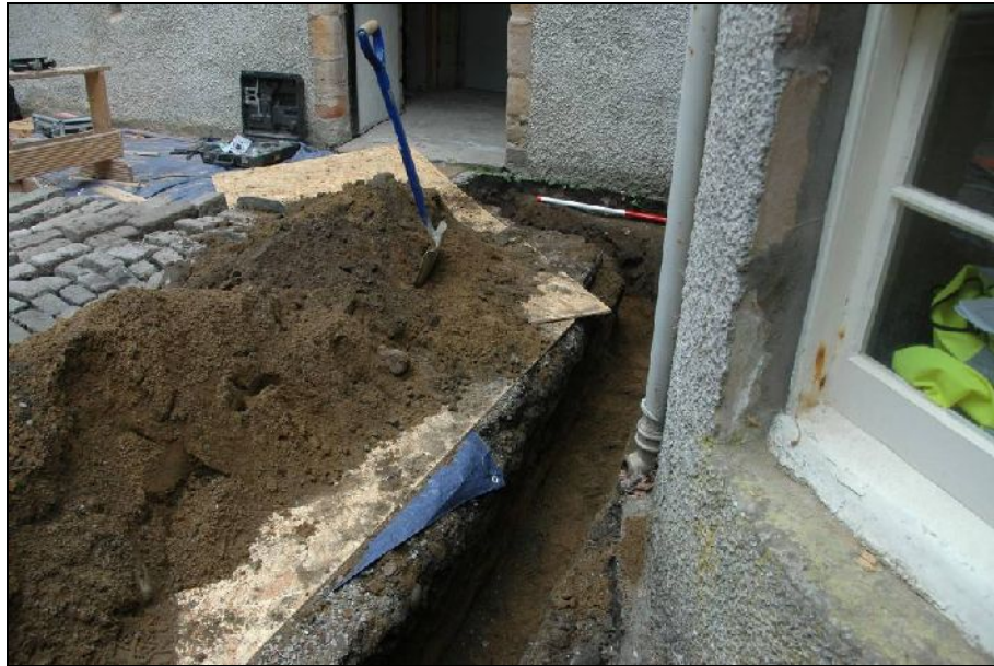
Illus 8: N section of trench to vestibule door