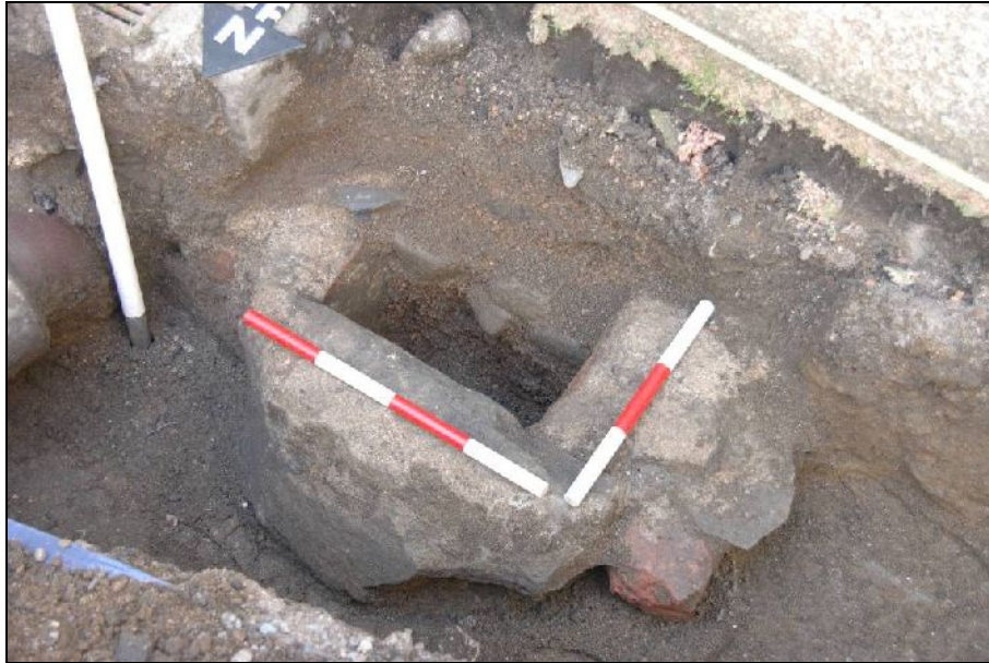
Illus 4: Stone and brick drain at E end of trench