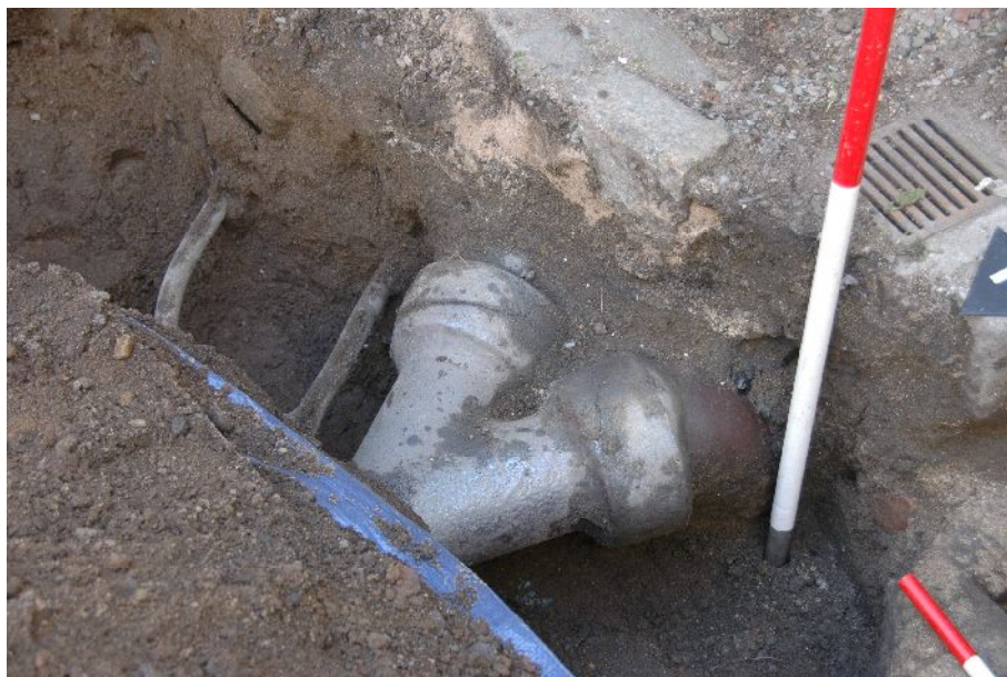
Illus 5: E end of trench showing the pipes and water pipes