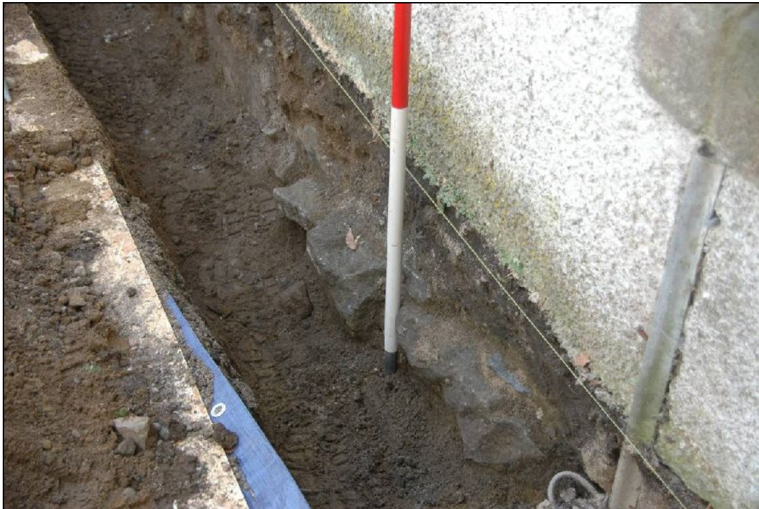
Illus 3: Wall foundation in SW end of trench