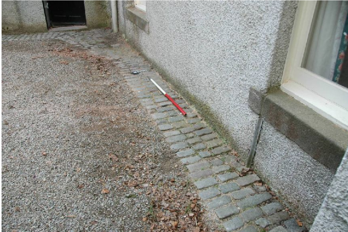
Illus 1: Granite setts along the S side of the courtyard