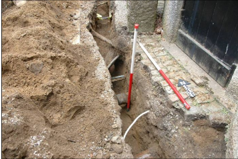
Illus 6: Services in front of Boiler Room door

and five smaller services placed above the water pipes. At this point the depth of the trench was deepened to 800mm to allow the new cable duct to pass below the existing services [see No.3 On Site Plan, Illus.9].