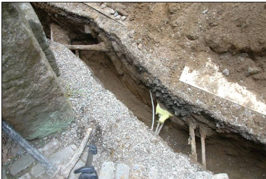
Illus 7: Services N of the Boiler Room