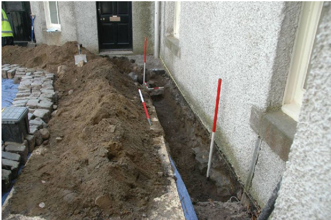
Illus 2: Trench on S side after excavation