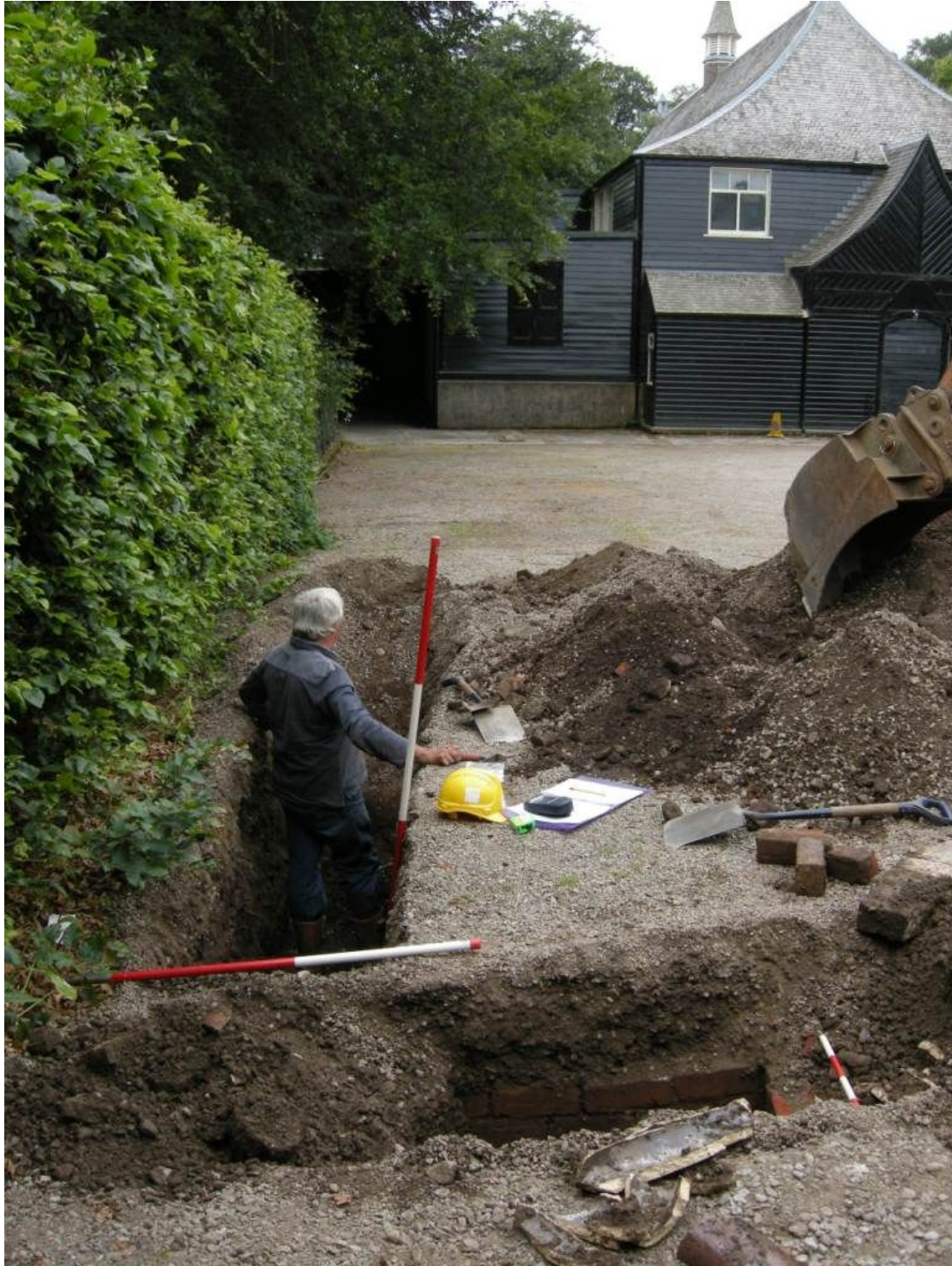
Illus 3 Location of trench 1 in relation to Haddo House Hall