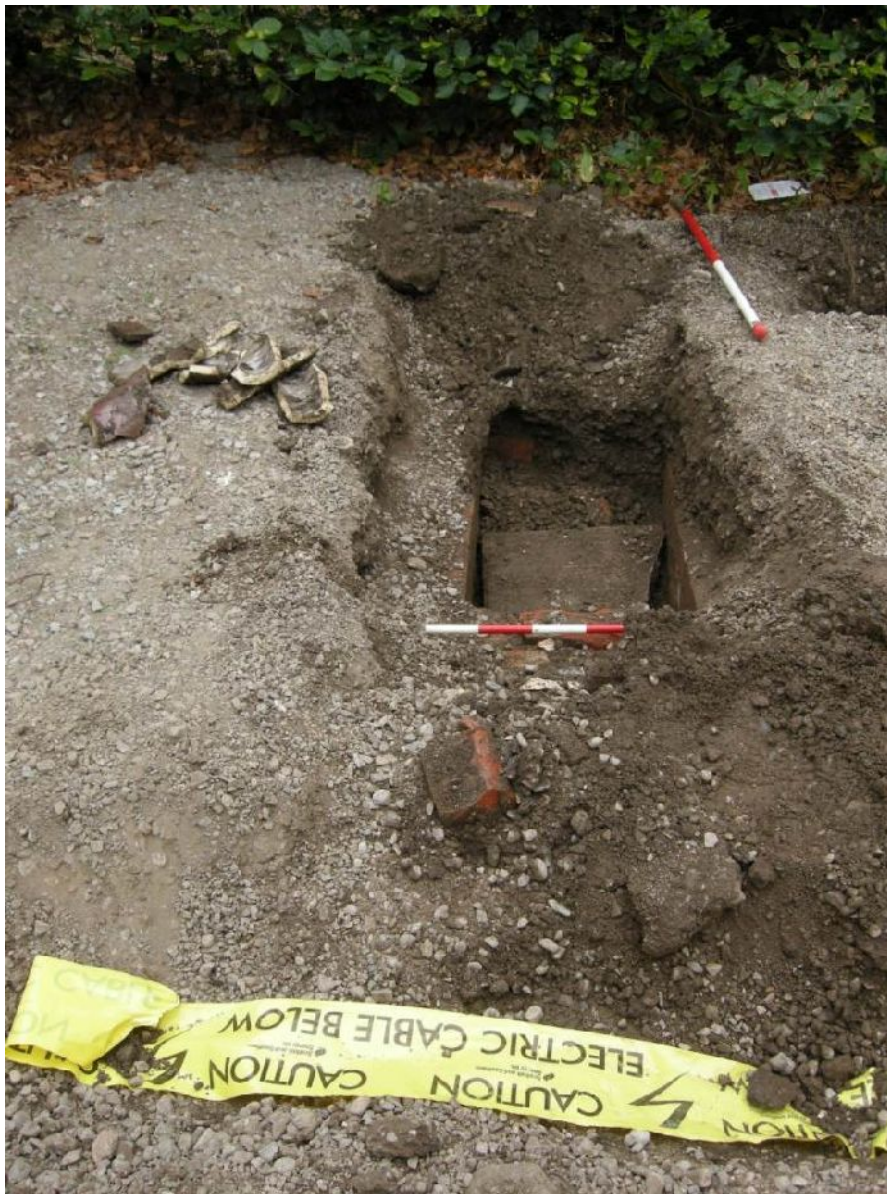
Illus 5 Looking E along trench 2. Electric cable in foreground with brick inspection pit behind.

No archaeological features or artefacts were observed.