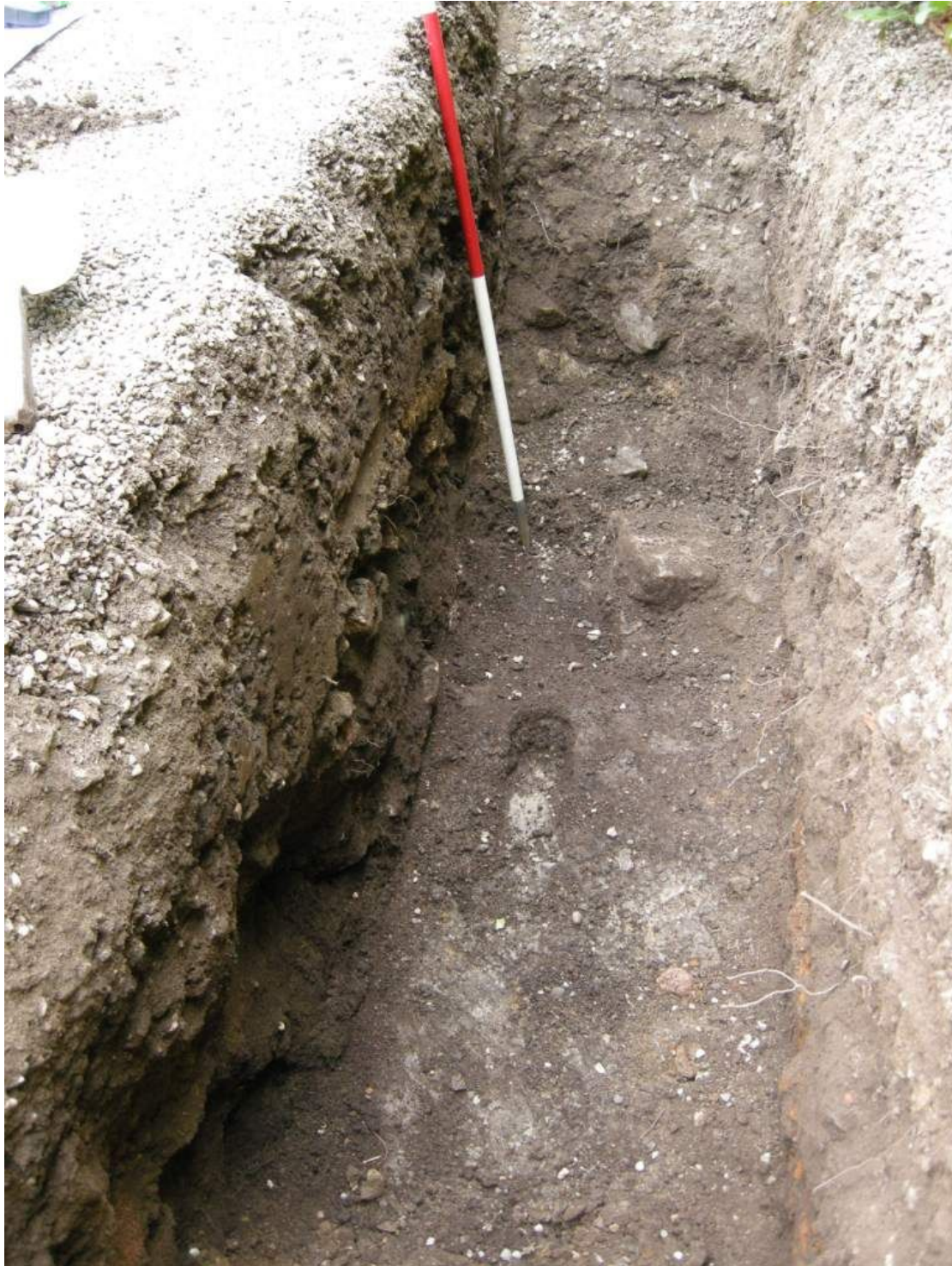
Illus 4 Trench 1 looking N. In E (RHS) section brown line is the exposed iron water main. In the W section (LHS) the undisturbed stratigraphy is visible.