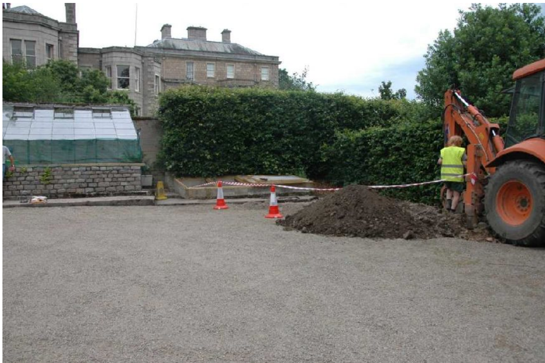
Illus 1 Location of trenches in relation to Haddo House

NMRS ref: NJ 83SE 42.32 (Haddo House Hall) NJ83SE 21 (House of Kelly), NJ83SE 42.00 (Haddo House)