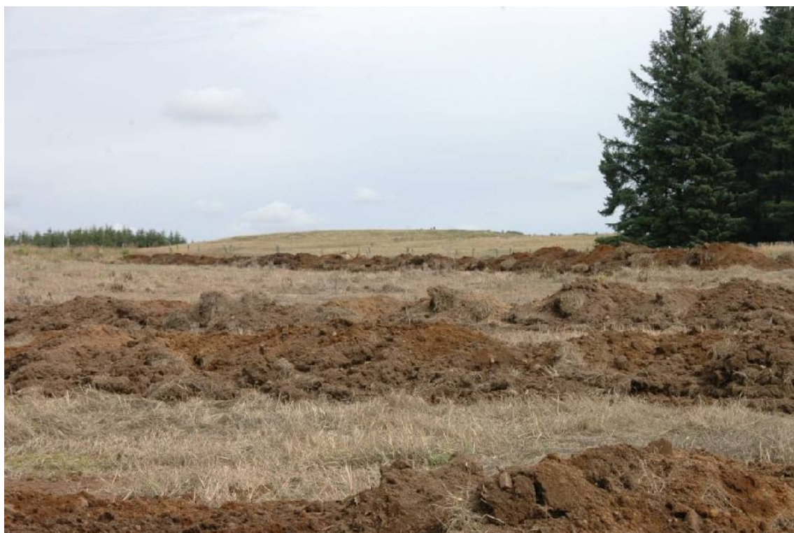
Illus 1 General view across site looking NE to rig and furrow on higher ground on the horizon.

4.1 Trenches 1-5, in the housing area, were on fairly level, slightly lower ground and trenches 6-8 were on the higher ground which is intended for landscaping only.