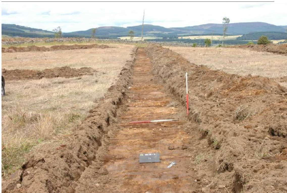
Illus 3 Trench 3 looking NW