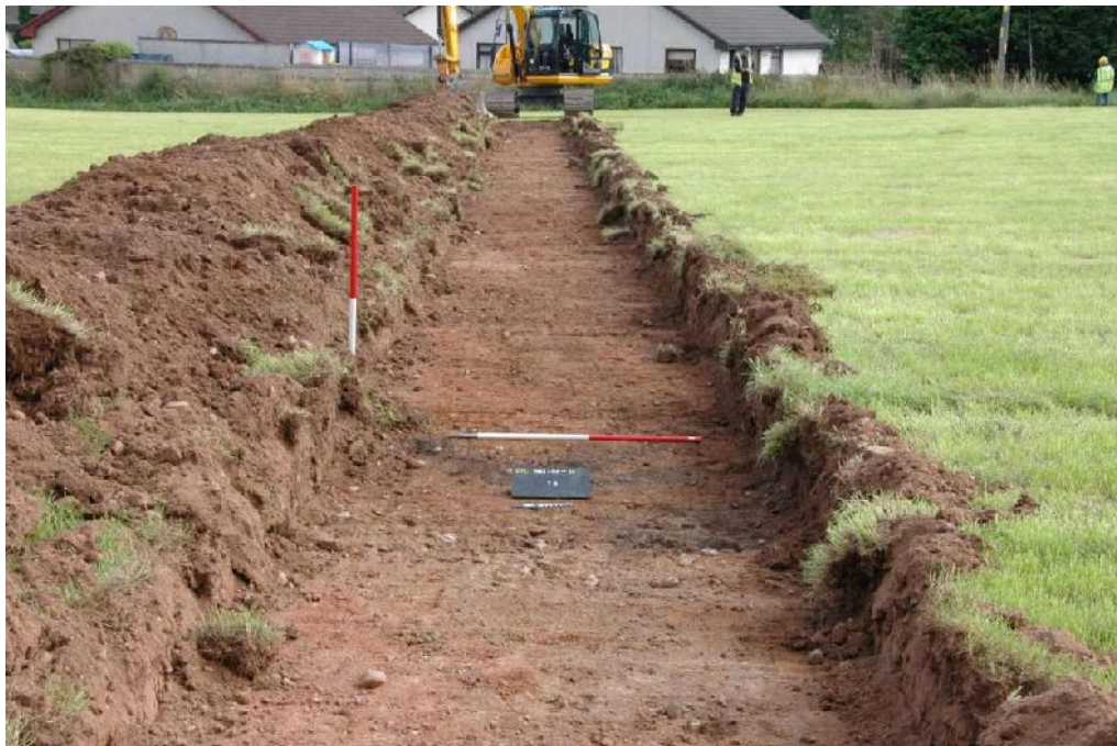
Illus 5 Trench 8 looking E