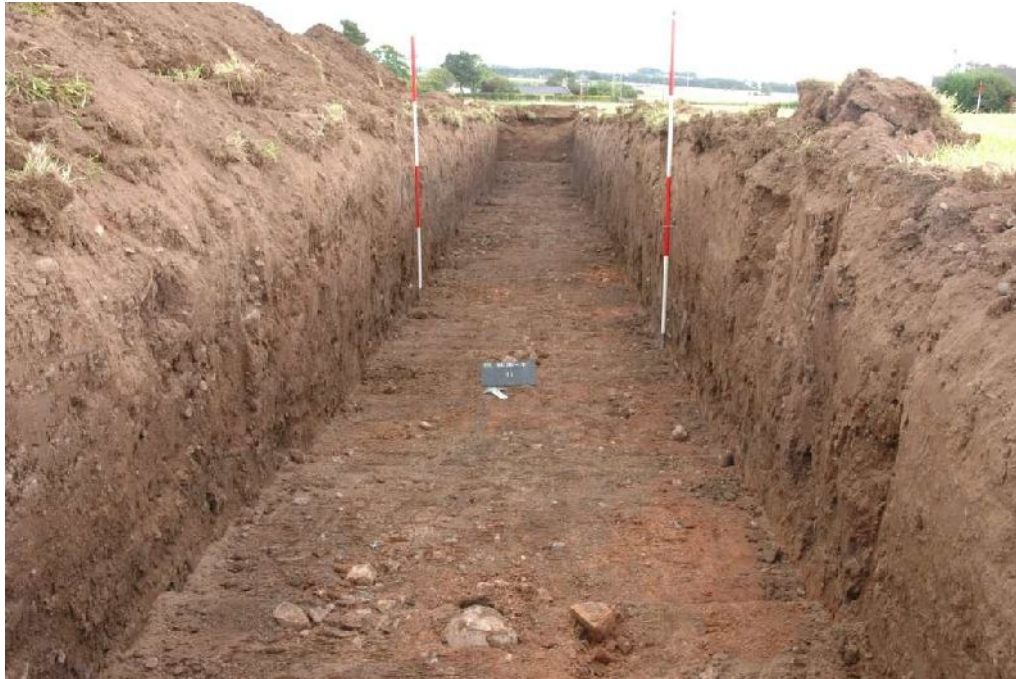
Illus 3 Trench 2, N end looking N