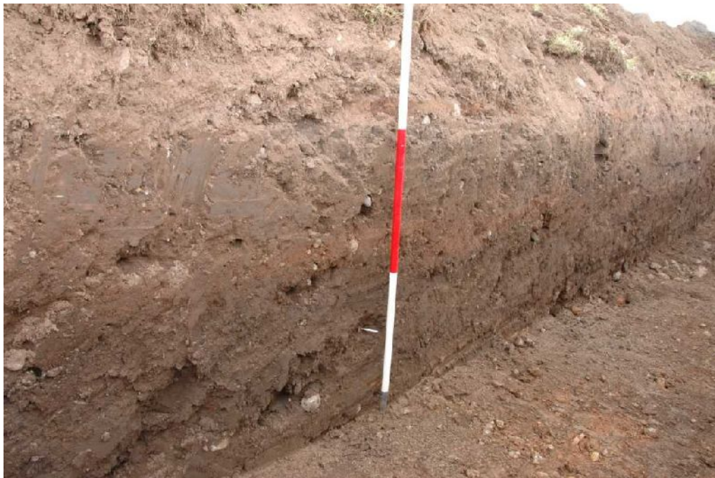
Illus 4 Trench 2 W section detail at N end showing L19th/E 20 th century infill. White tag (halfway up lowest white bar on ranging rod) indicates position of sherd of L19th/E 20 th century redware pottery.