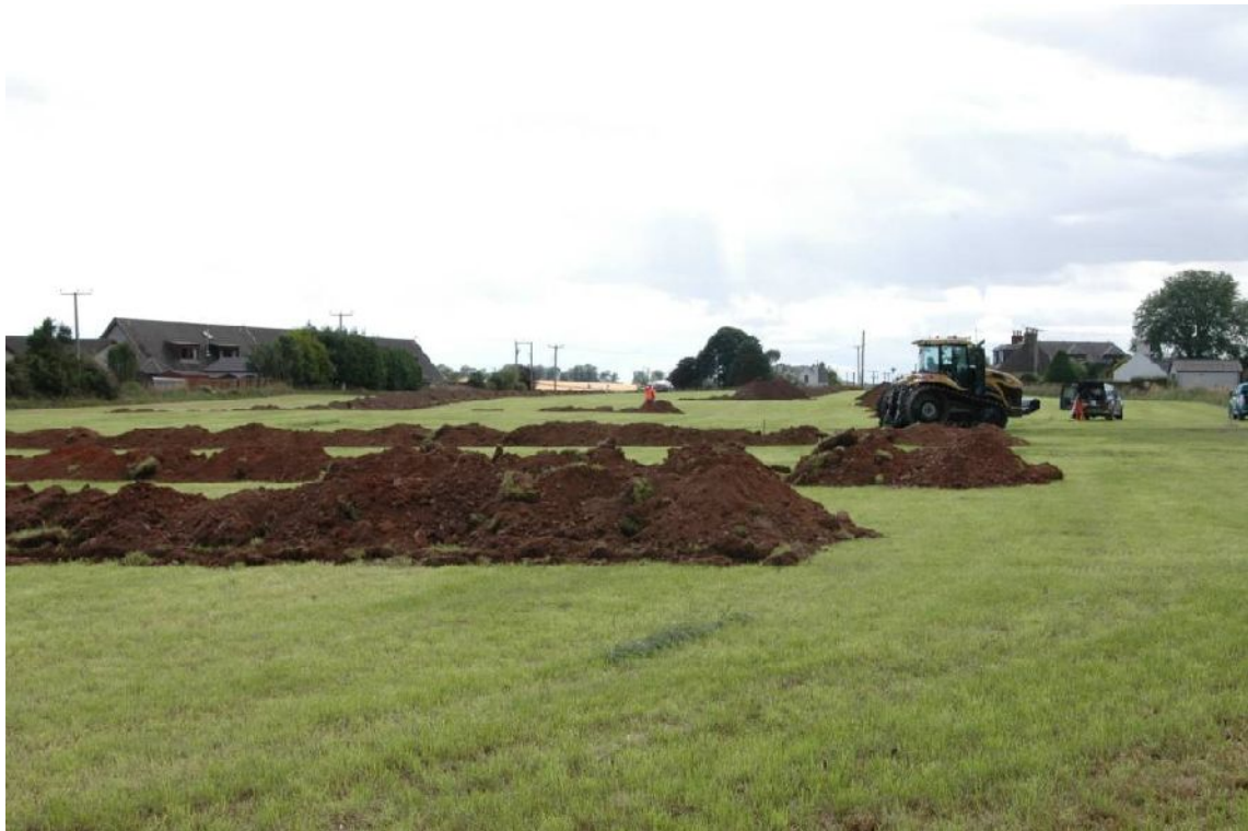
Illus 1 General view across site looking S, Trench 7 in foreground