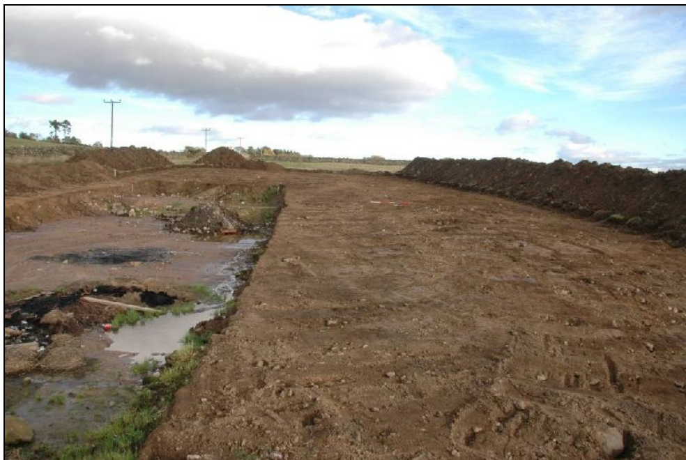
Illus 2: View, looking E, of site with area previously excavated on LHS