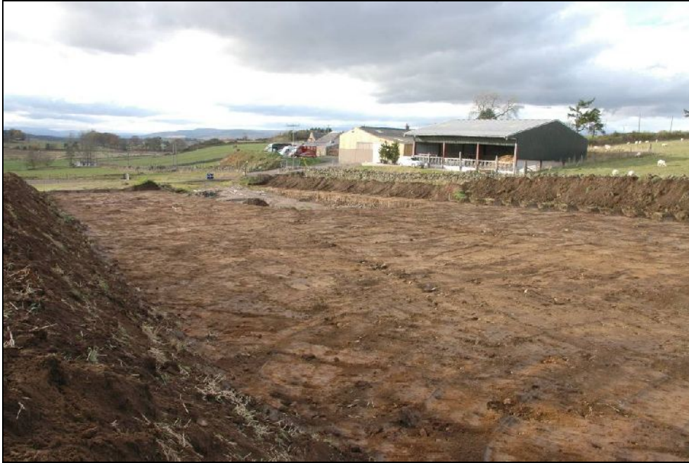
Illus 3: View of site, looking NW