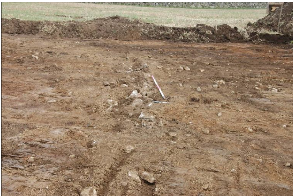
Illus 4: View of stone field drain, looking E