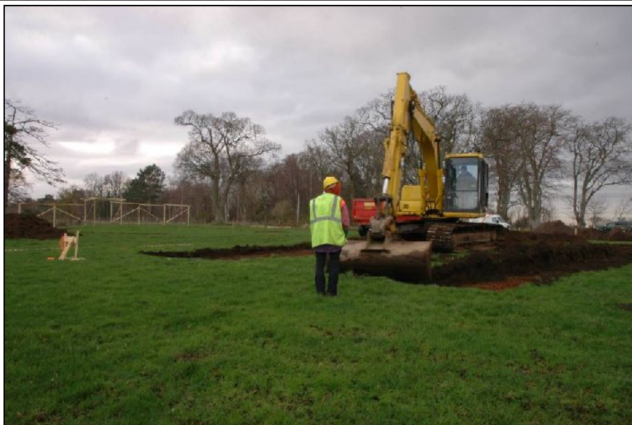
Illus 3: Soil strip in progress, looking W