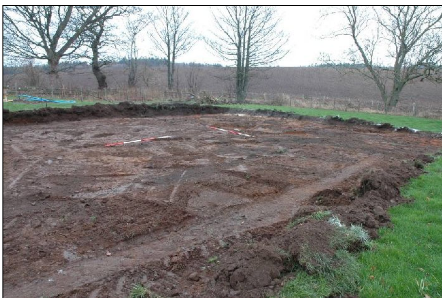
Illus 4: Area stripped, looking NE

4.1 Although the site lies to the S of an area of intensive archaeological activity, no archaeological features or finds were evident during the watching brief.