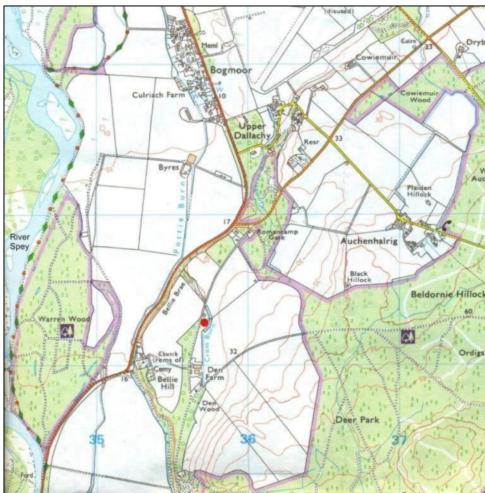
Illus 1: Location map with the site shown in red.