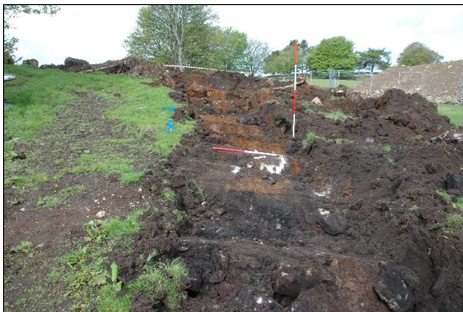
Illus 5: Area 2, looking W