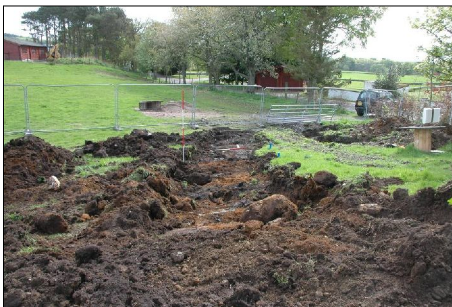
Illus 6: Area 2, looking E