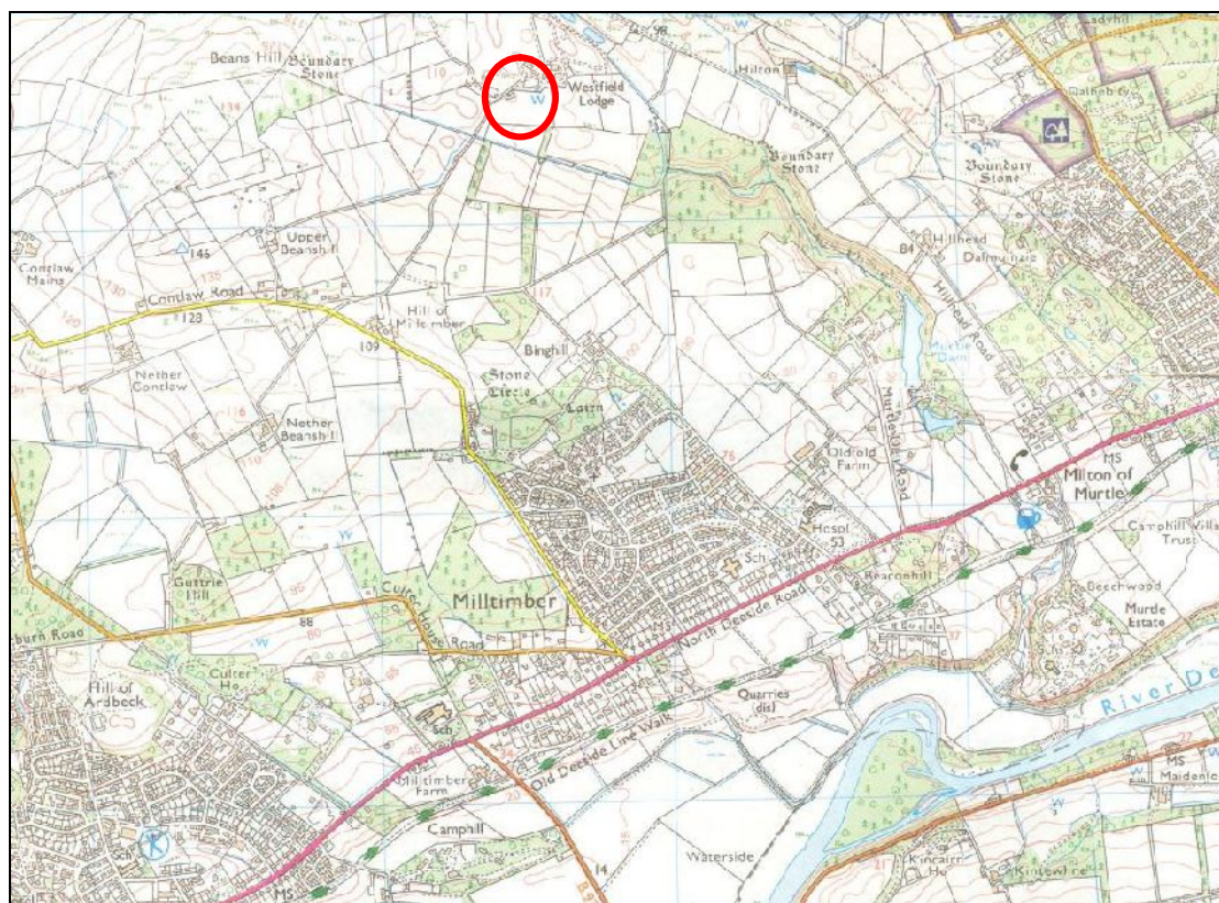
Illus 1: Map showing site location circled in red.