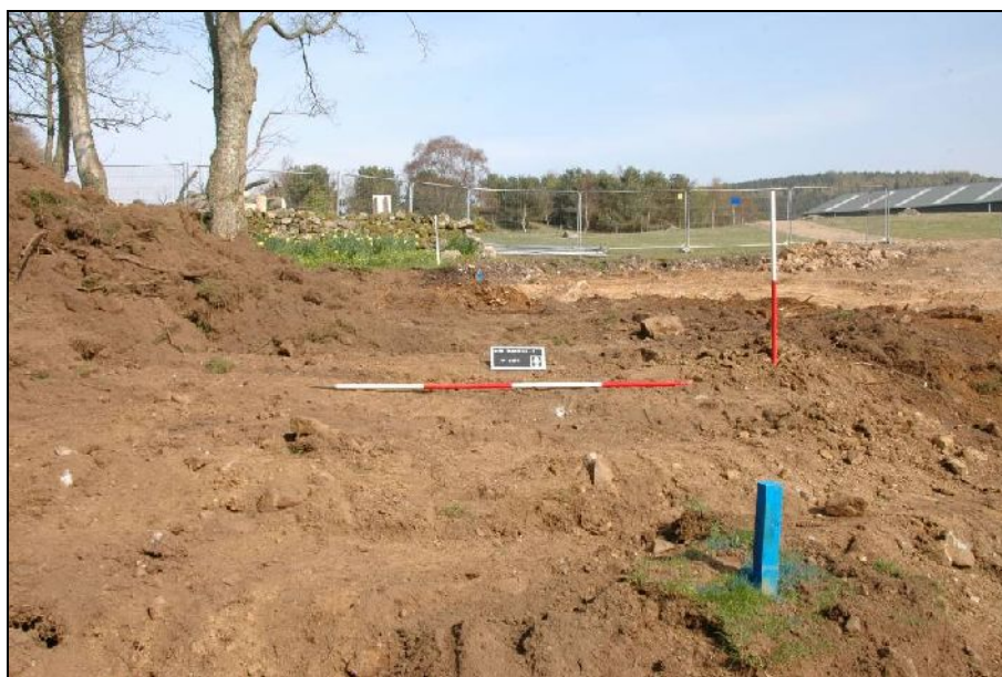
Illus 4: Area 1, after soil strip, looking N