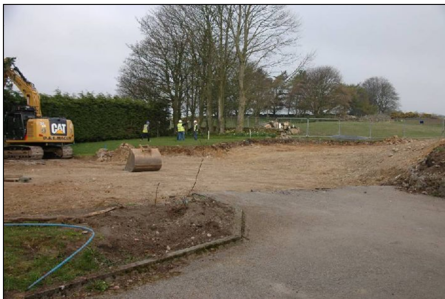
Illus 2: View of the central area of the site, looking NW to Area 1.