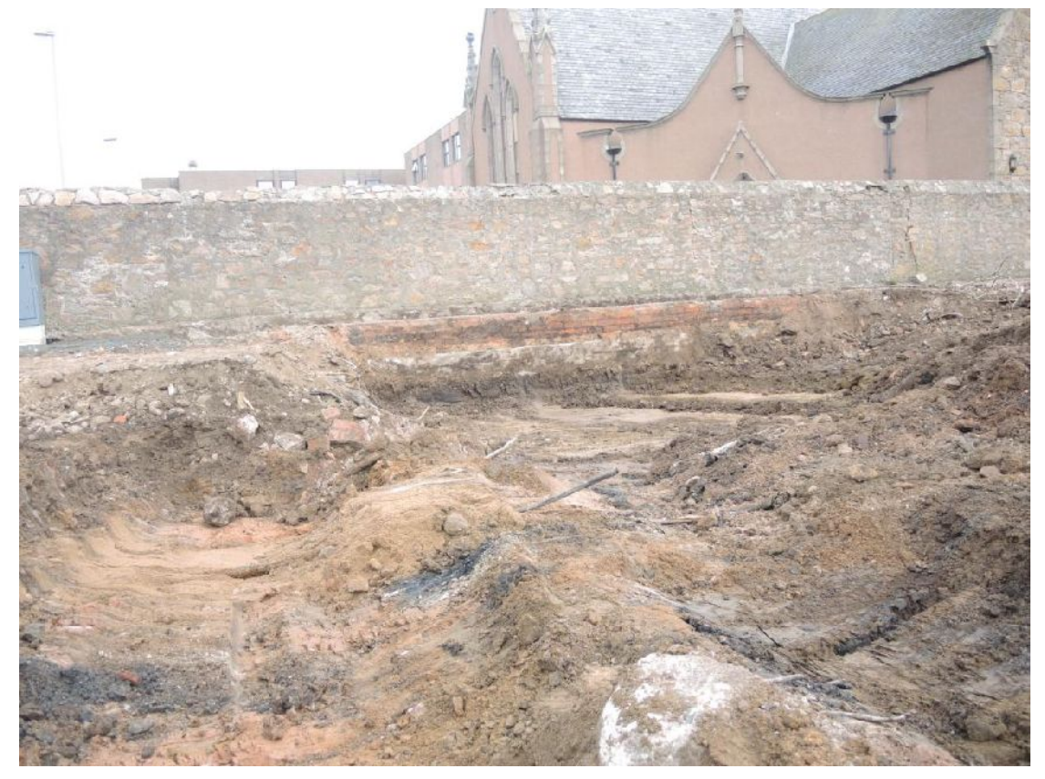
Illus 6 NE sector. Piles and concrete ring beam from 20<sup>th</sup> C flats