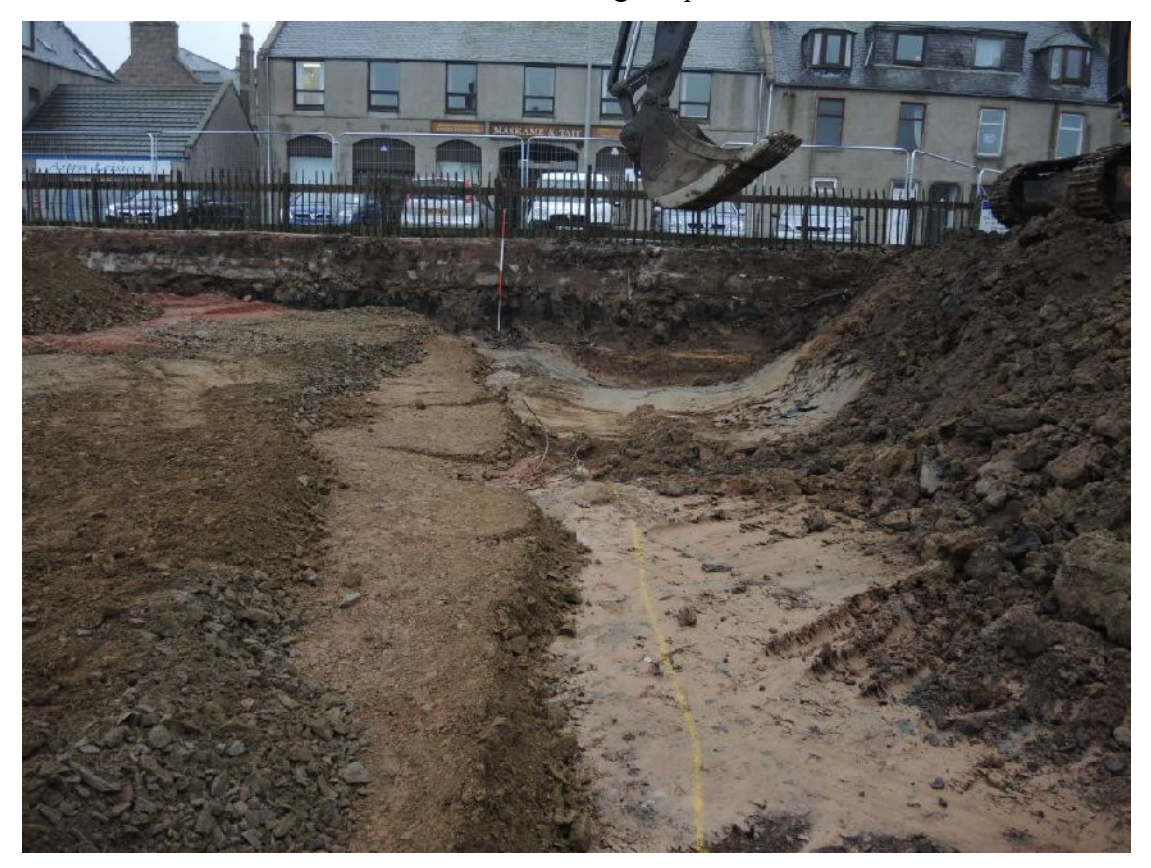
Illus 9 NE sector showing clean hardcore put in to new building level