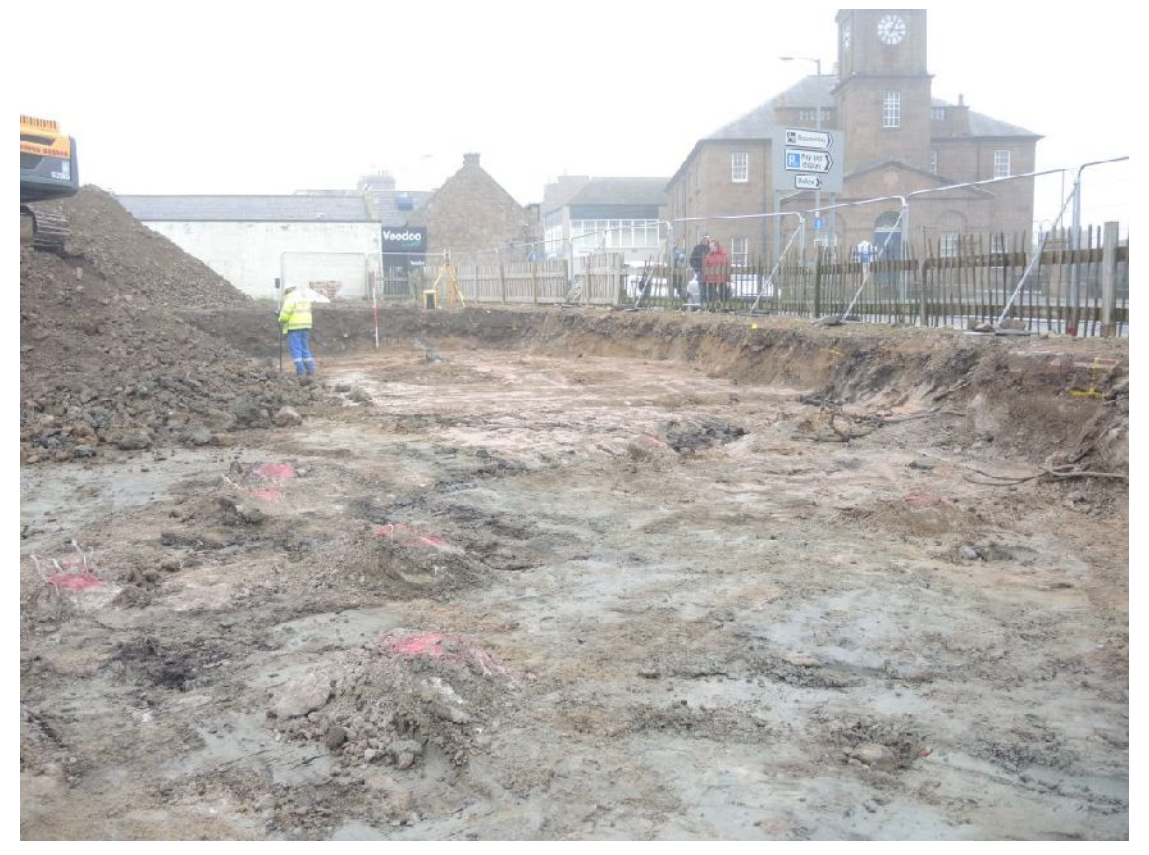
Illus 7 W sector general. Red marks indicate concrete foundations in natural clay