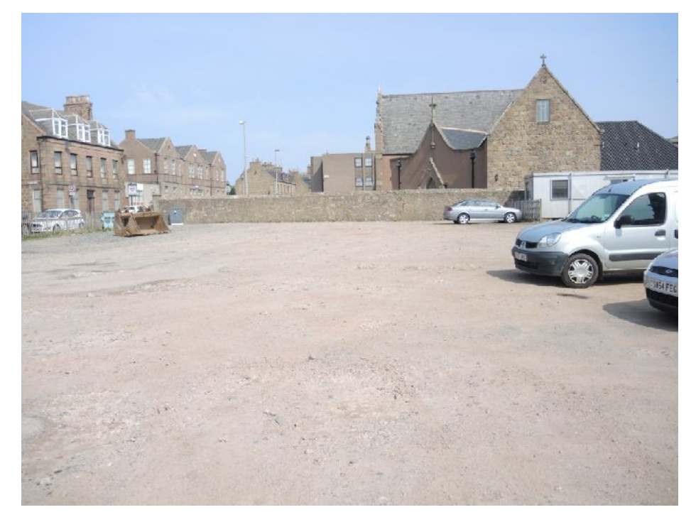
Illus 2 Site before machining looking to NE sector