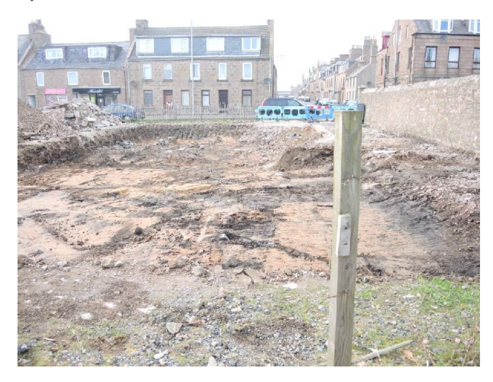
Illus 5 NE sector. Post-demolition fill removed to natural clay. Piles from flats visible