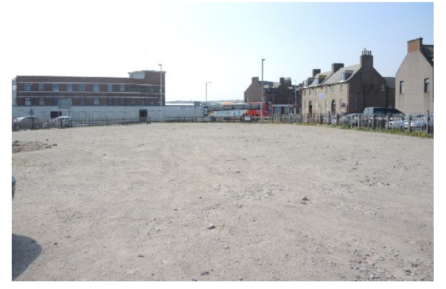
Illus 3 Site before machining looking to W sector at junction of St Peter Street and Erroll Street