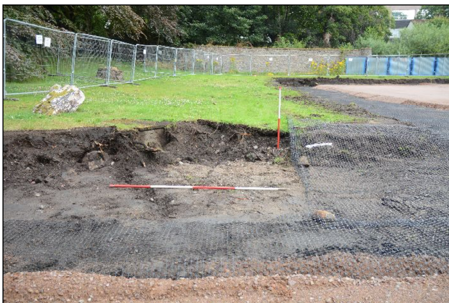
Illus 3: Dump material below topsoil, looking N