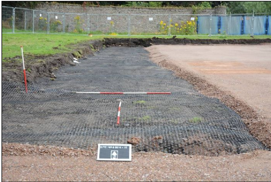
Illus 2: Strip on W side of site, looking N

stripped topsoil. A depth of c.400-500mm of topsoil had been removed. Where it was possible to observe it, the underlying strata seems to be a made up dump of broken brick, stone and rubble. This seems to be accord well with observations undertaken in 2009 by Alison Cameron, then Assistant Archaeologist, City of Aberdeen Archaeological Unit of adjacent areas immediately N of the site excavated as part of the Old Aberdeen Heating Replacement (site code 0388) and the adjacent Halls of Residence on the E side of the site.