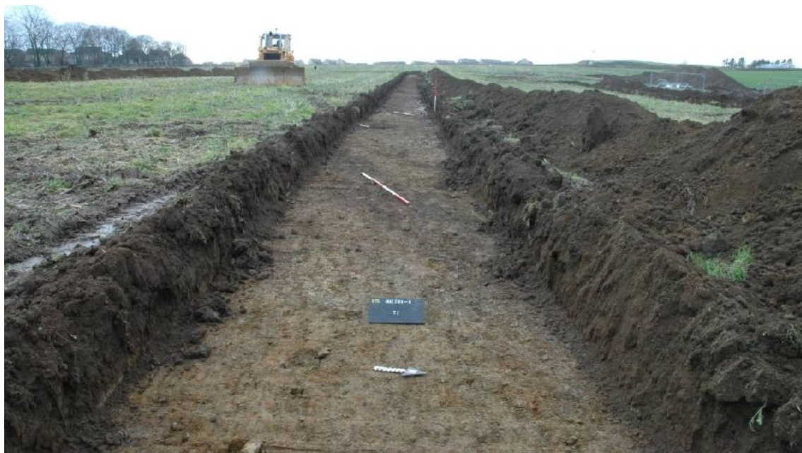
Illus 3 Trench 2 looking SW showing rig and furrow

The two flints indicate some prehistoric activity in the area, which agrees with the number of stray finds from Conglass Farm and the evidence of the evaluation undertaken by Cameron Archaeology to the N of the road in 2013. However, as the surviving rig and furrow suggests, there has been intensive agricultural activity on the site for several hundred years and no features of prehistoric date were observed surviving in any of the evaluation trenches.