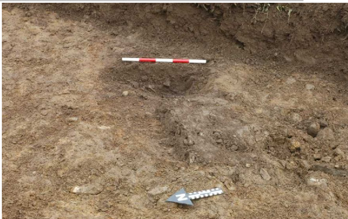
Illus 2 Animal burrow/stone hole context 5 in Trench 2