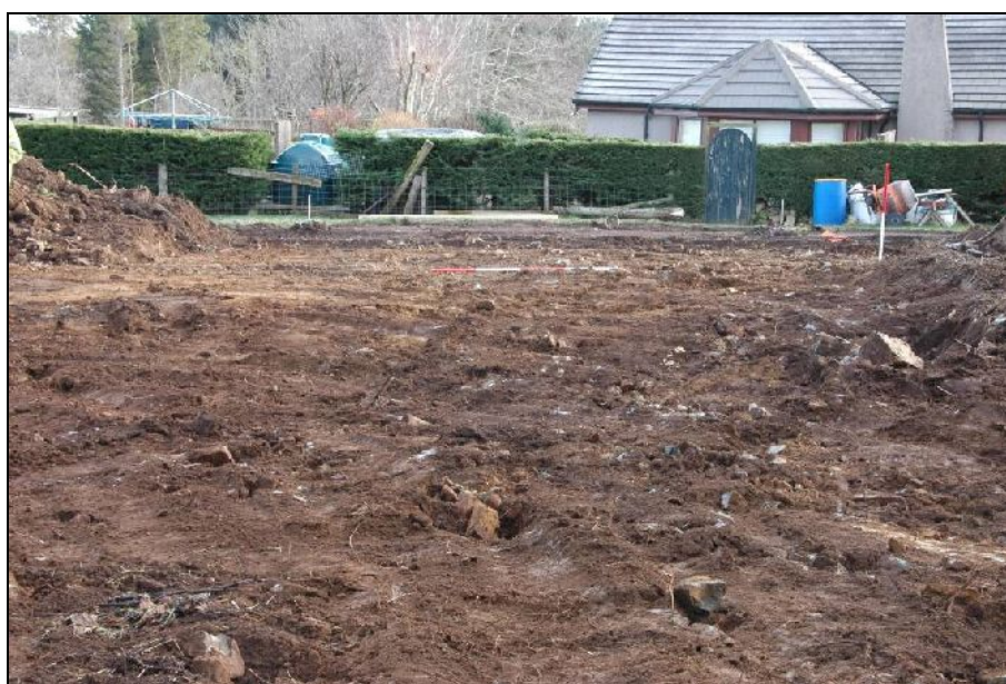
Illus 5: View of site, looking E