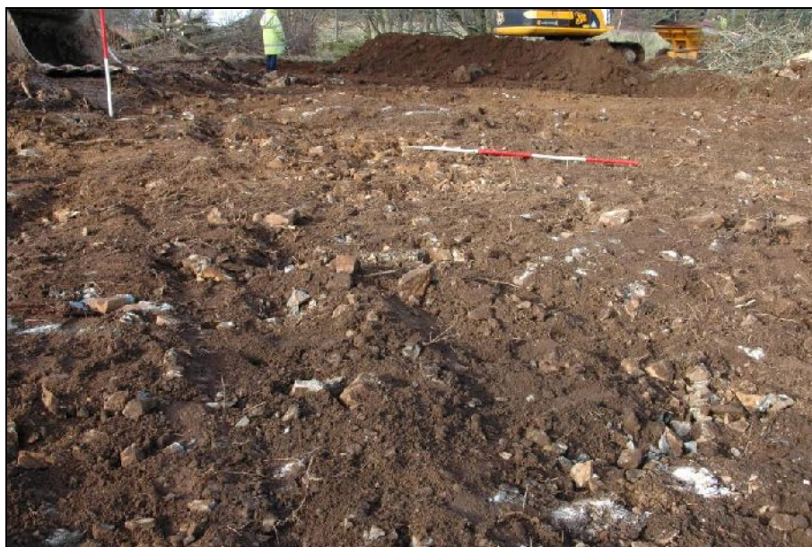
Illus 4: View of Site, looking SW