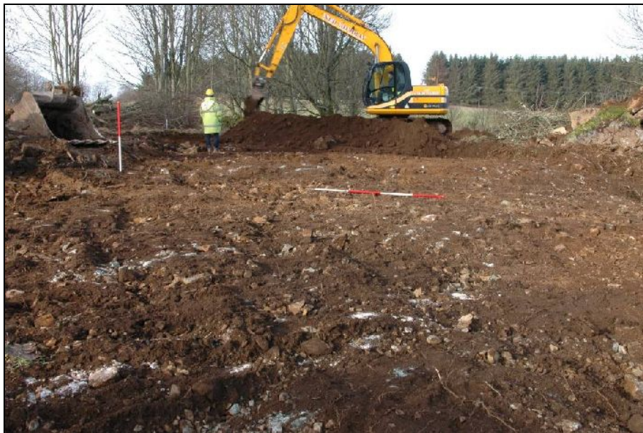
Illus 3: Soil strip of site, looking W