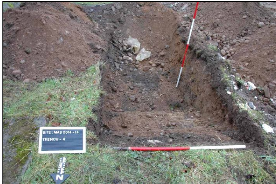
Illus 4 Trench 4, looking S

GPS E end: 397647, 847624 W end: 397630, 847633