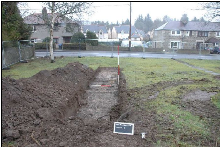
Illus 6 Trench 9, looking N

Stratigraphy: Redeposited topsoil with quantity of 19 th /20 th century glass, china etc, over clay natural. 0.30m deep at N to 0.70m deep at S end.