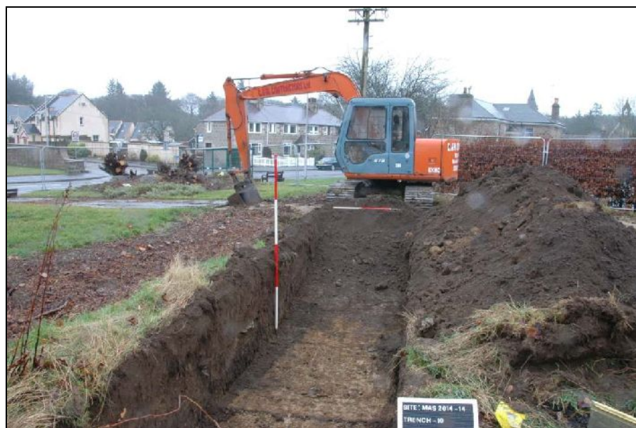
Illus 7 Trench 10, looking NE

Stratigraphy: Redeposited topsoil with quantity of 19 th /20 th century glass, china etc, over clay natural. 1m deep.