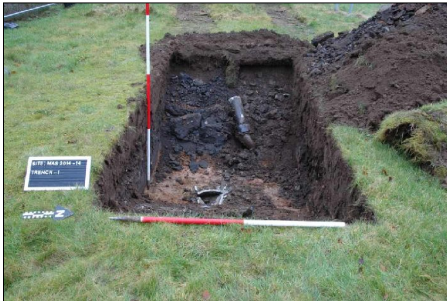
Illus 2 Trench 1, looking W

Stratigraphy: Made up ground containing bricks, pipe etc in fill. Depth: 0.95m