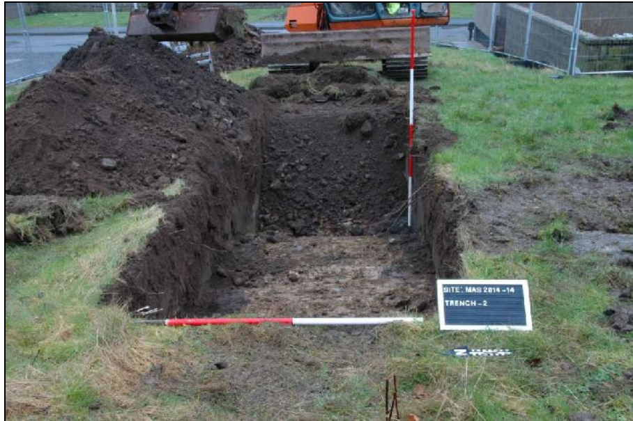
Illus 3 Trench 2, looking E