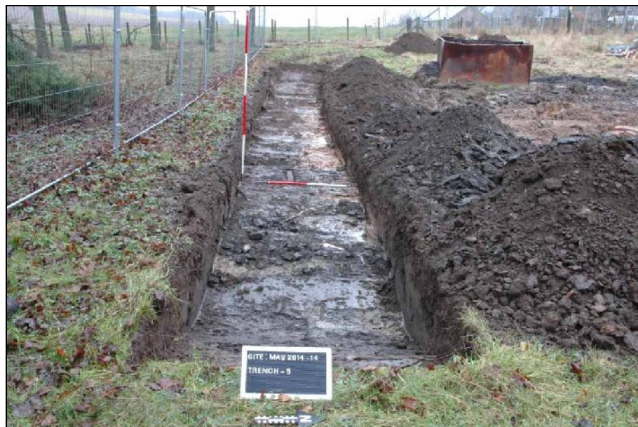
Illus 5 Trench 5, looking W

Stratigraphy: Made up ground and redeposited topsoil over clay natural, from 0.60m deep at E to 0.40m for most of trench.