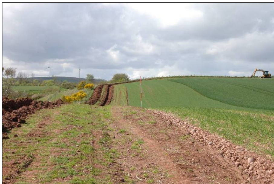
Illus 5: Cable trench, looking NW. Ranging pole is the suggested location of the 1864 cist.