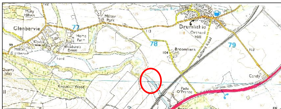
Illus 1: Map with area of watching brief circled in red. © Crown Copyright. All rights reserved License No.100049810.

2.2 A number of archaeological sites are recorded in the area. To the SE, and on the E side of the North Eastern Railway are two sites, a cropmark site at Pade O'France [NGR: NO783 798; NMRS No. NO77NE 42] and the site of a battle between Mary of Guise, Queen Regent and the Scottish nobles in 1559-60 [NGR: NO 7838 7986; NMRS No. NO77NE 64].