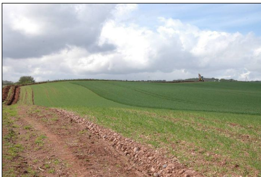
Illus 6: View, looking NE, to 'B'.