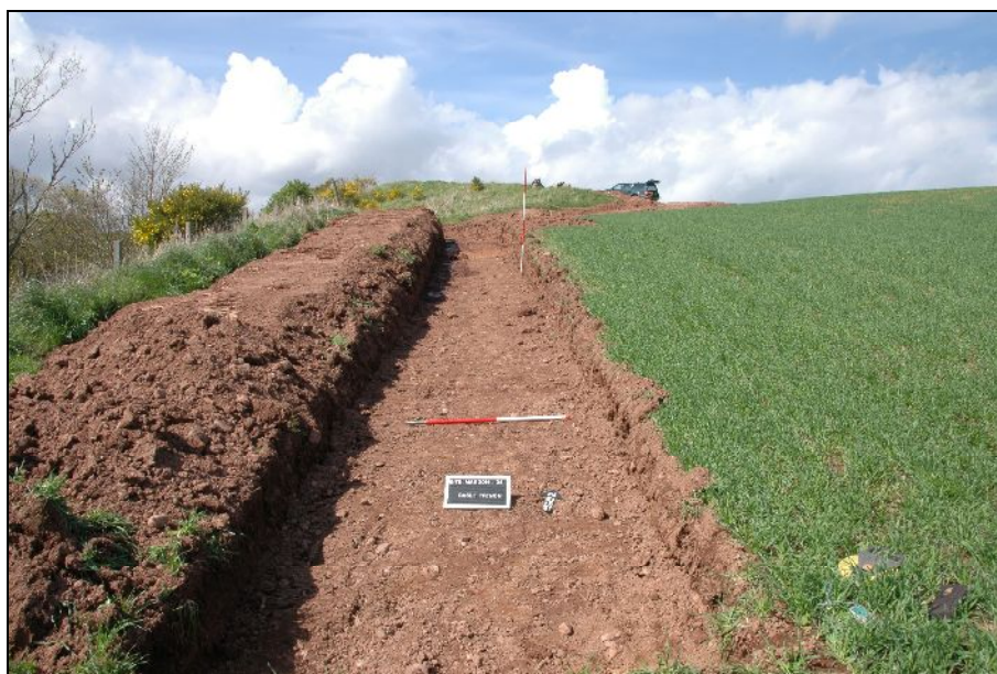
Illus 3: Cable trench going N from 'A'.

No archaeological features or finds were evident.