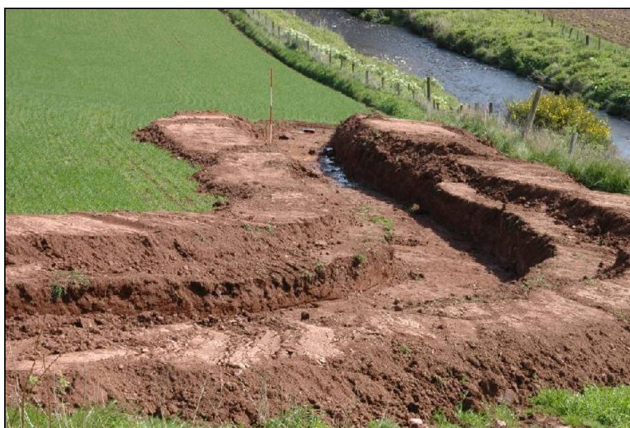
Illus 4: Cable trench, looking SE to 'A' and the Bervie Water.