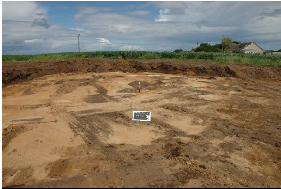
Illus 4: Natural sand below topsoil, looking N

No archaeological features or finds were evident.