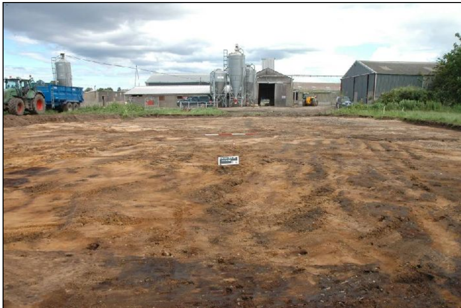
Illus 5: Site following soil strip, looking E