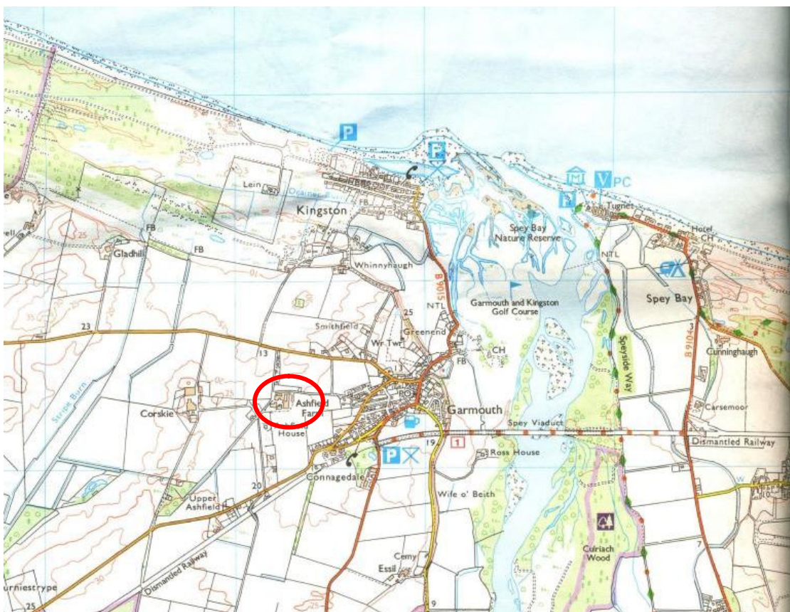
Illus 1: Map showing site location circled in red.

2.1 Ashfield Farm is located on the W side of the village of Garmouth, Moray (NGR: NJ 33165 64378; Illus.1). The farm itself is located a short distance to the E of Corskie Farm, where a number of crop marks have been identified. The crop marks show a possible prehistoric field system and small settlement. There are a series of linear enclosures bordered by irregular boundaries, one of which overlies a small sub-oval enclosure. There are also faint traces of pits scattered over the area and two possible ring ditches (Moray SMR ref: NJ36SW0045)