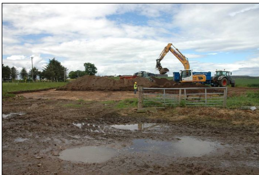
Illus 3: View, looking W, at soil strip in progress