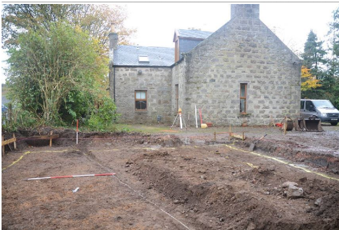
Illus 1 The site looking towards the house.